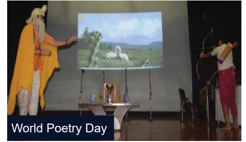
World Poetry Day

विश्व कविता दिवस के अवसर पर, सिंधिया स्कूल, फोर्ट, ग्वालियर में हिंदी साहित्य सभा ने सुबह की सभा में एक नाटक और कविता पाठ का आयोजन किया। यह लघु नाटिका मानव जाति के इतिहास में पहले श्लोक के इर्द-गिर्द घूमती है, जिसे वाल्मीकि ने एक शिकारी द्वारा "क्रौंच" पक्षी की मृत्यु के लिए उस पर अपने दुःख के परिणामस्वरूप अनायास ही कहा था। 'विश्व कविता दिवस' कवियों को सम्मानित