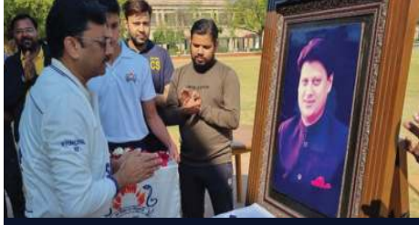
Paying homage to H.H. Maharaja Madhavrao Scindia II

On 10th March 2024, on the Birth Anniversary of H.H. Maharaja Madhavrao Scindia II, a