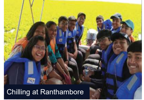
Chilling at Ranthambore

We left after breakfast the next morning, stopping near the Chambal for a tranquil boat ride where we saw several gharials and a delightful lunch as well. We reached as the sun was setting, tired smiles on our faces as we recounted the two days spent in complete peace.