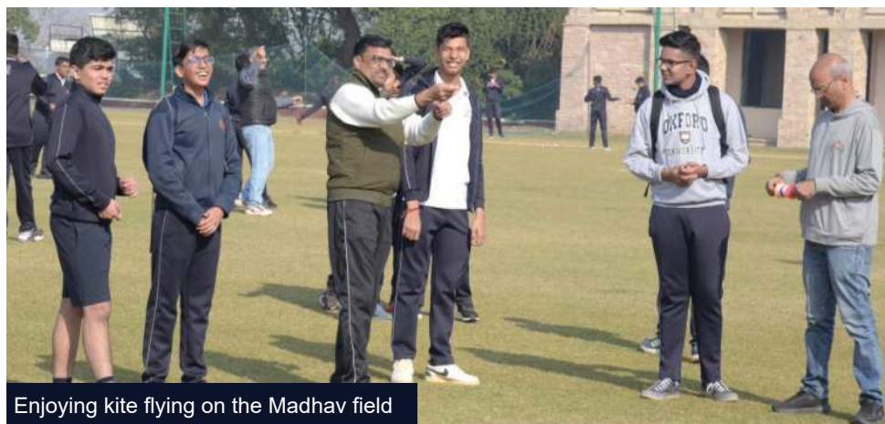
Enjoying kite flying on the Madhav field

14th January 2024 will surely be a special day in my life, for it was the first time that I ever flew a kite. Though it may surely sound odd to many, it is the pure truth.