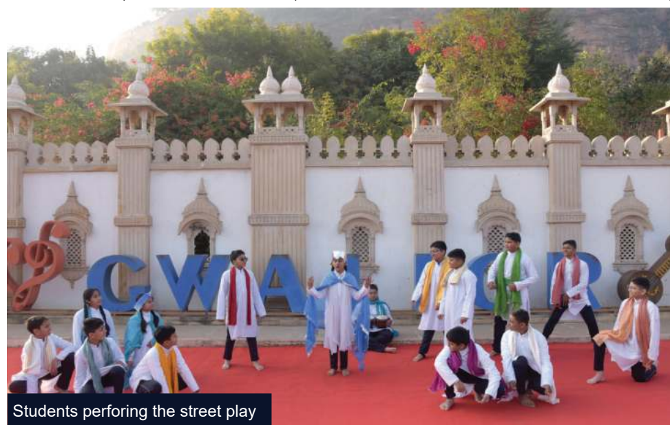
Students performing the street play

On 21st January 2024, the Scindia School organized the impactful 'Stride for Solutions: Join Water Warriors in Walkathon for Change.' Engaging 120 students, teachers and staff, the event traversed Gwalior's landmarks,