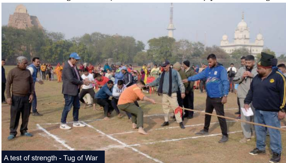
A test of strength - Tug of War

On the evening of 26th January 2024, the social service league organized various competitions for the support staff and their families. Members of the Social Service League and the Junior School students enjoyed the amazing skill