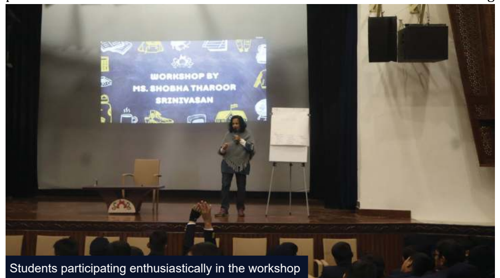
Students participating enthusiastically in the workshop

On 19th January 2024, renowned author Ms Shobha Tharoor Srinivasan graced our school with an enlightening workshop on the art of crafting diverse poems. Students were enthralled as she unraveled the intricacies of writing