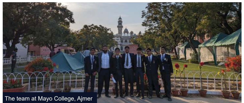
The team at Mayo College, Ajmer

On 19th January 2024, a team of 6 students and 1 teacher escort went to Mayo College, Ajmer, for the Model G20 event. The students participated in a non-