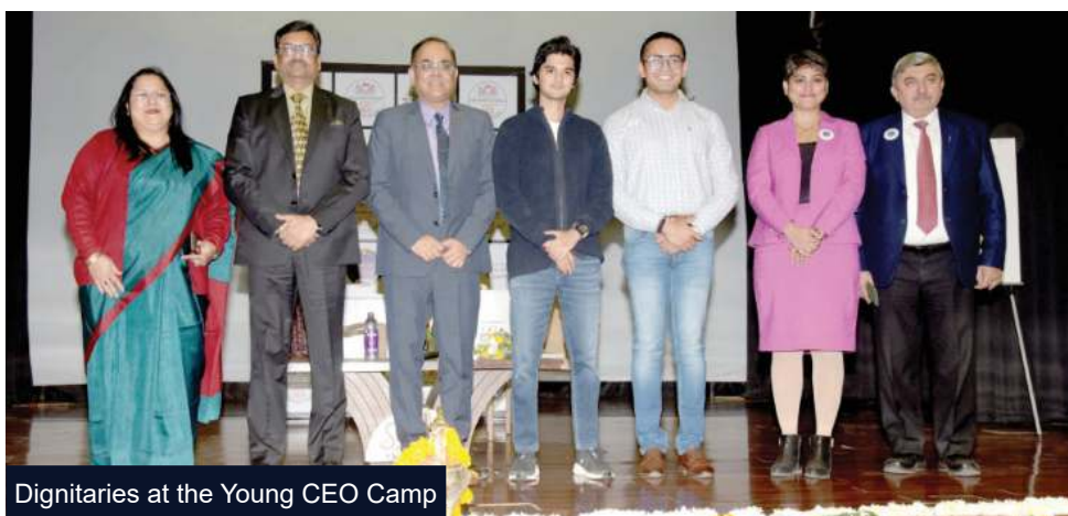
Dignitaries at the Young CEO Camp