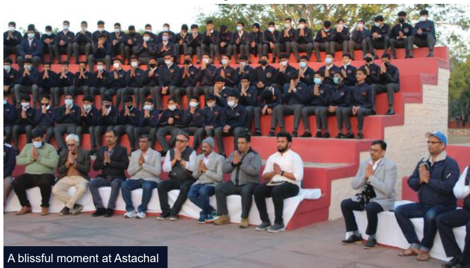
A blissful moment at Astachal