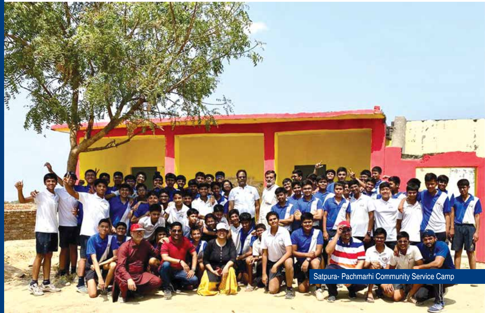
Satpura- Pachmarhi Community Service Camp