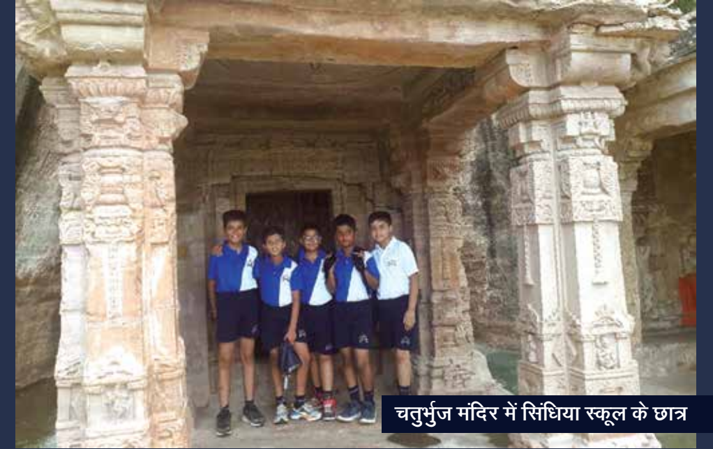
चतुर्भुज मंदिर में सिंधिया स्कूल के छात्र

शून्य 'बिंदु' है, जी हाँ! सही समझे, गणित में आने वाला बिंदु। बिंदु की परिभाषा है- "वह ज्यामितीय आकृति जिसकी कोई ऊँचाई, लंबाई, चौड़ाई न हो।" तो यह शून्य ही तो हुआ। जिस प्रकार परमाणु से समस्त चराचर का निर्माण