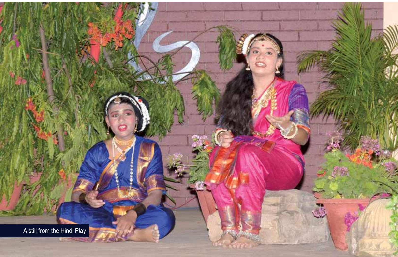
A still from the Hindi Play