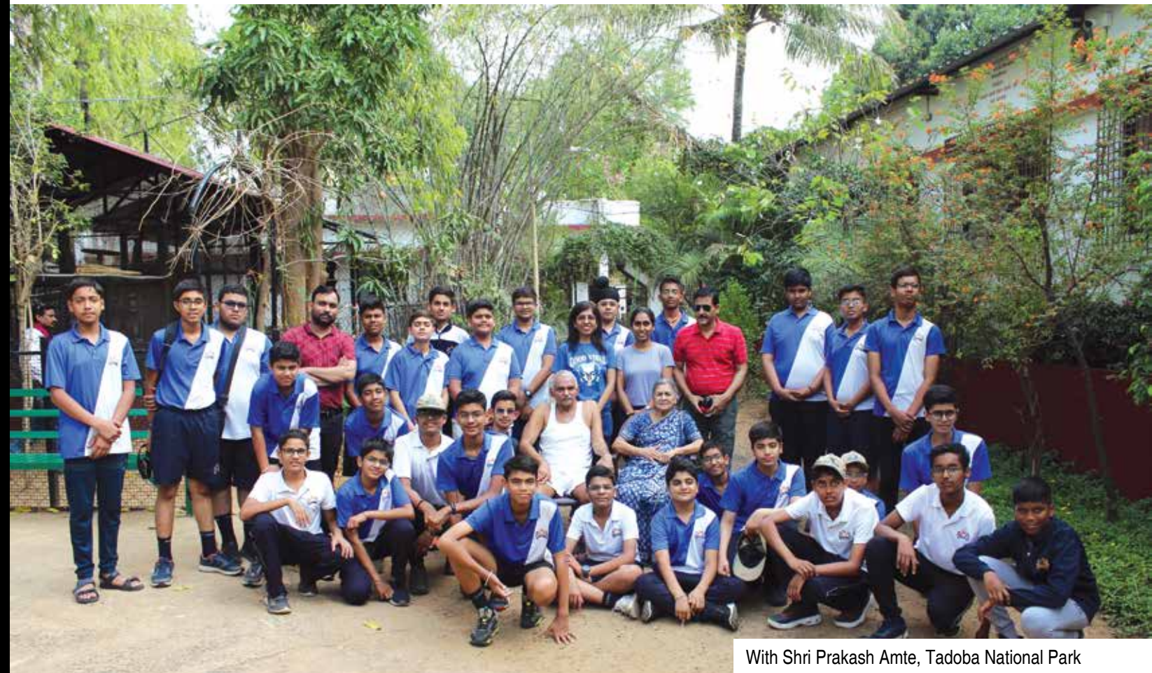
With Shri Prakash Amte, Tadoba National Park