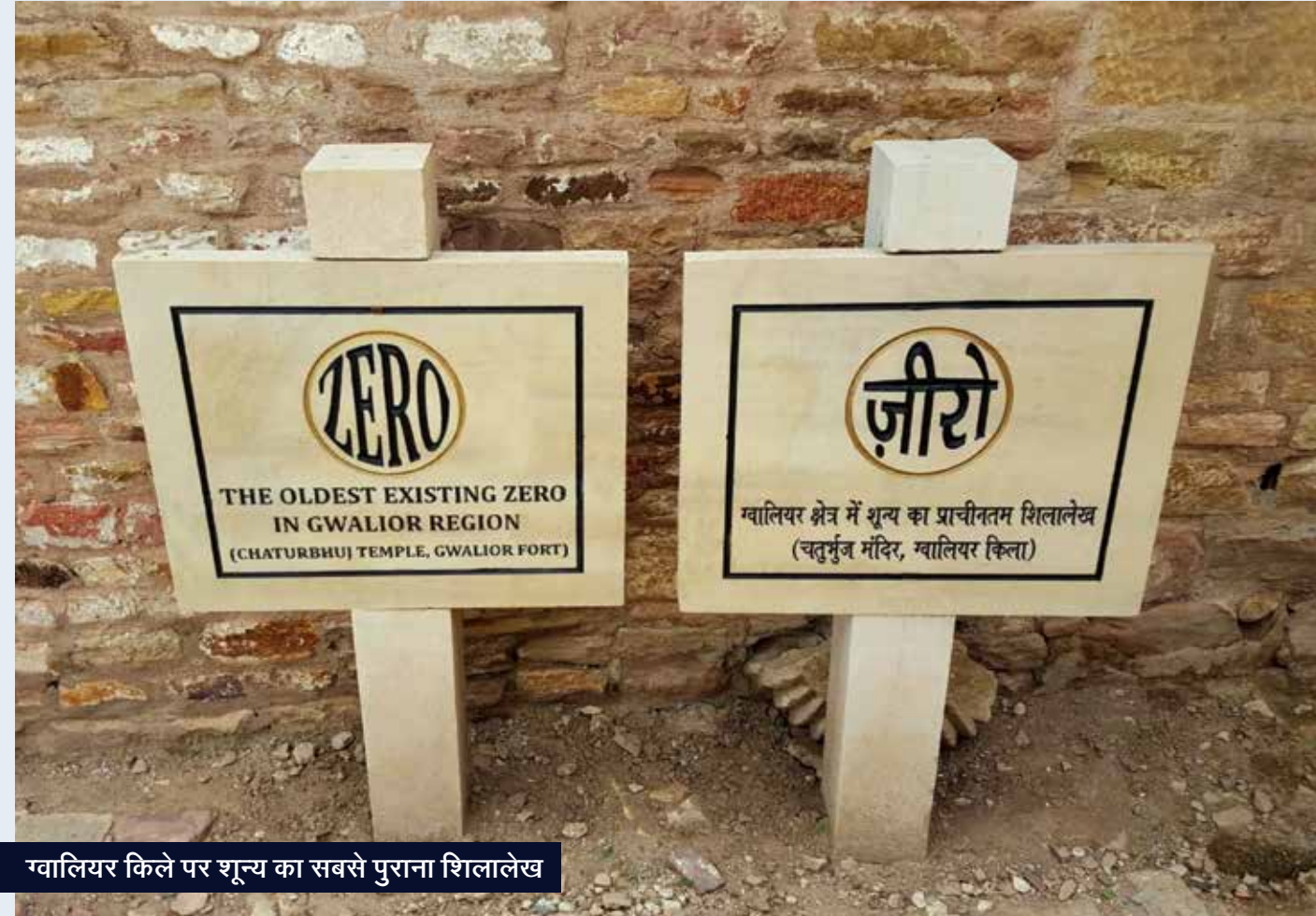
ग्वालियर किले पर शून्य का सबसे पुराना शिलालेख