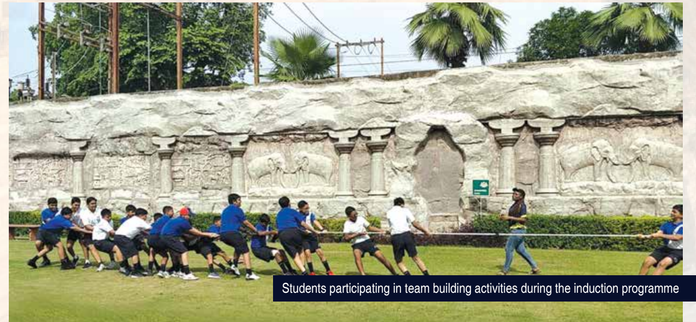
Students participating in team building activities during the induction programme