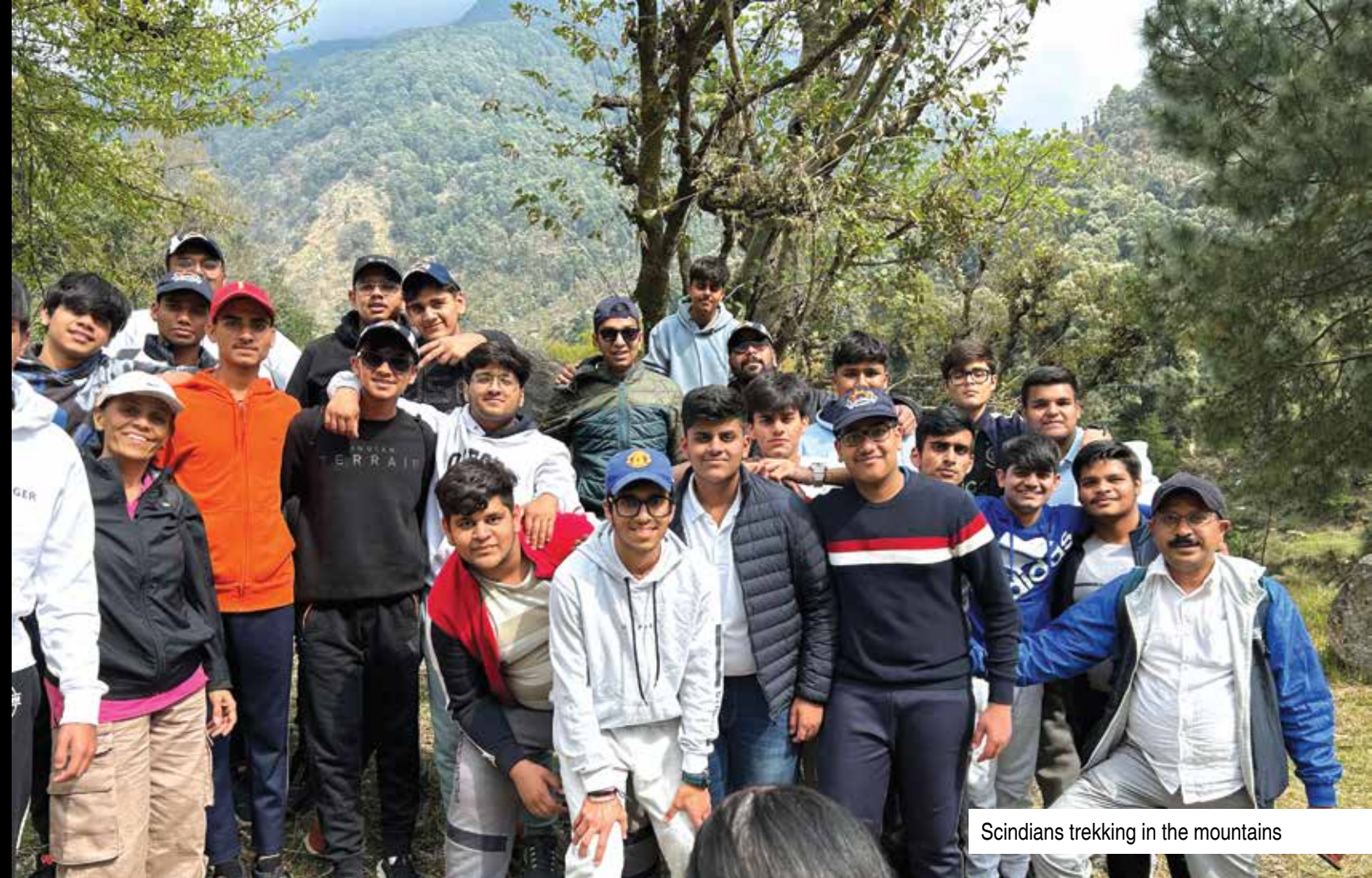
Scindians trekking in the mountains