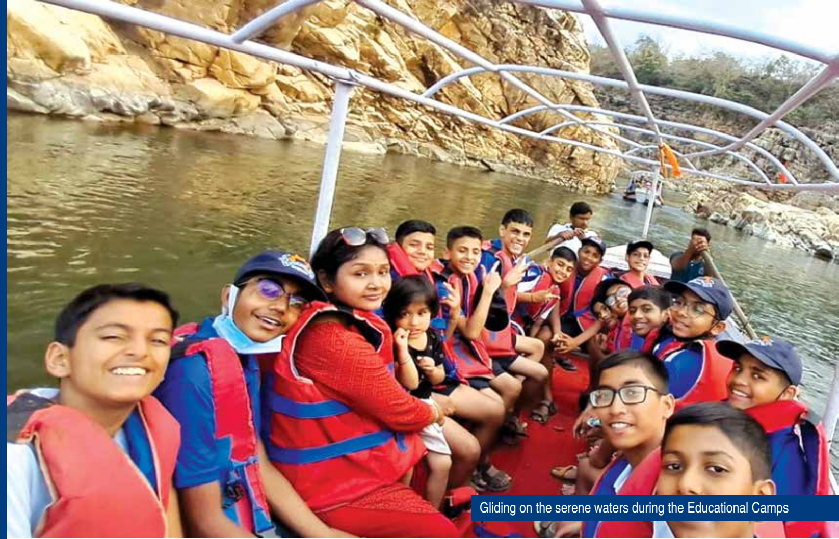
Gliding on the serene waters during the Educational Camps