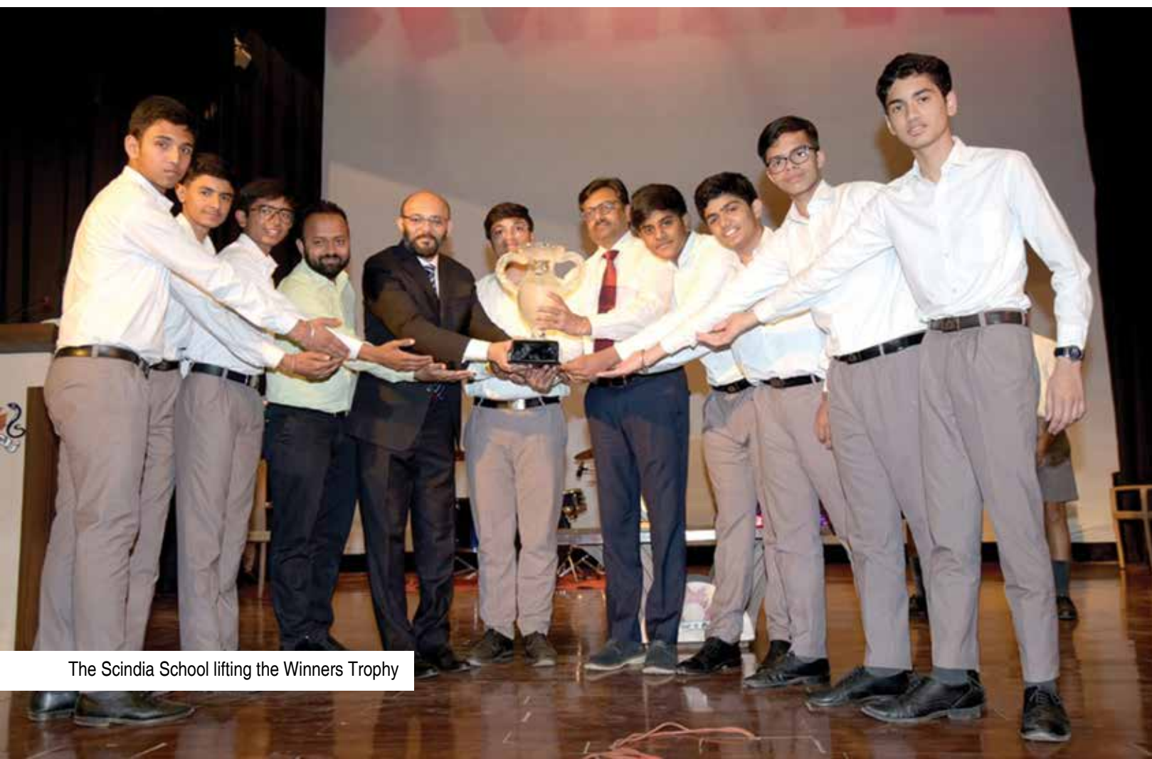
The Scindia School lifting the Winners Trophy