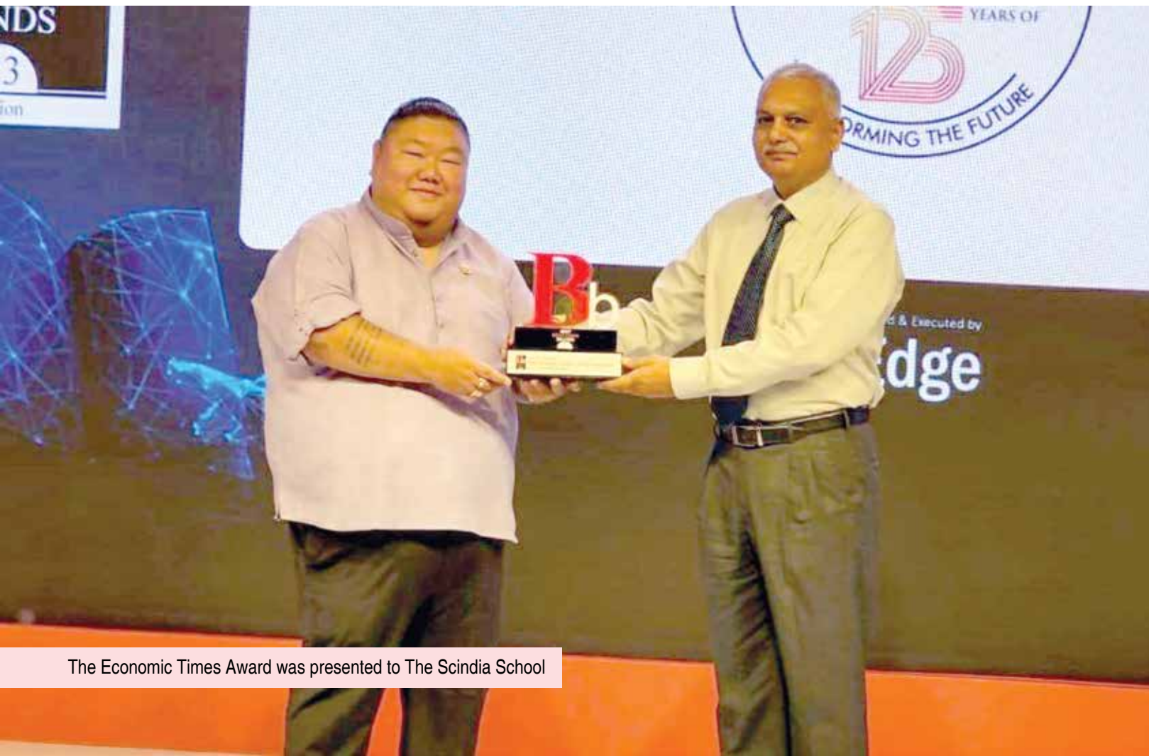
The Economic Times Award was presented to The Scindia School