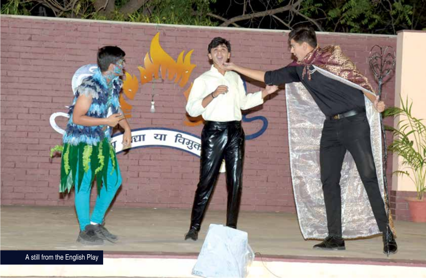
A still from the English Play

On 21 st April, the annual Hindi play- 'Bhagavadajjukam' was staged. It is a Sanskrit farce composed in the 7 th century CE attributed to Bodhayana. Featuring witty exchanges, and an episode about the transmigration of souls and a discussion on dharma the play engaged the audience. Students were profusely appreciated for their exquisite command on the Hindi language.