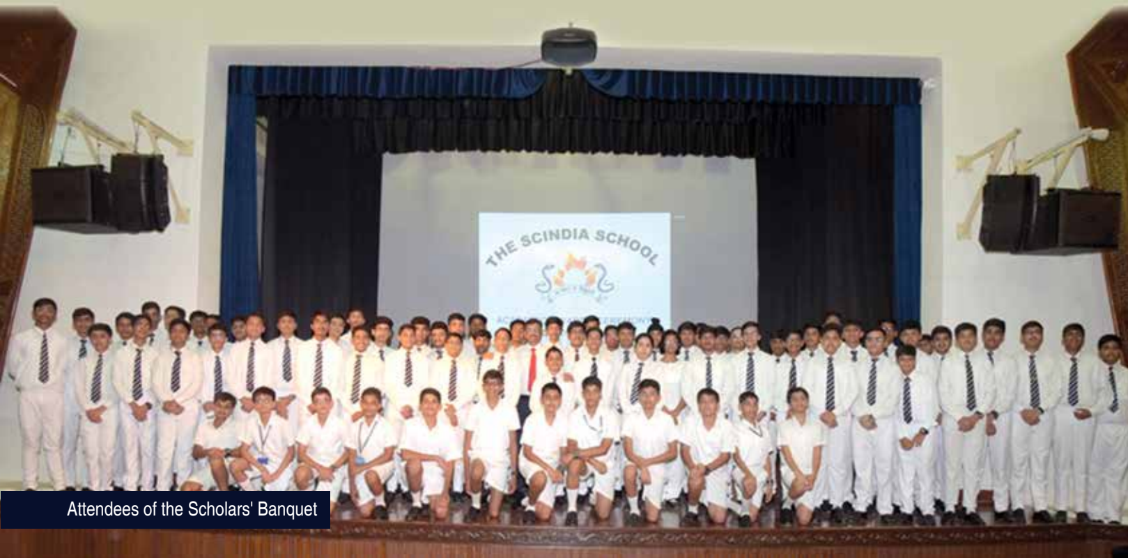
Attendees of the Scholars' Banquet