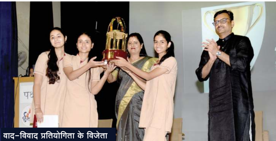
वाद-विवाद प्रतियोगिता के विजेता