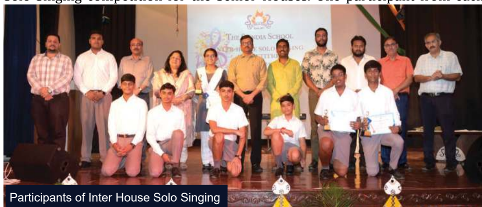
Participants of Inter House Solo Singing

On 31st August, the music department organized an exciting Inter-House Solo Singing competition for the Senior Houses. One participant from each