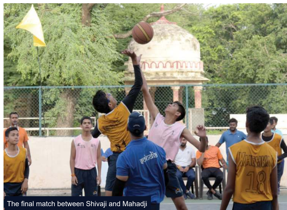
The final match between Shivaji and Mahadji