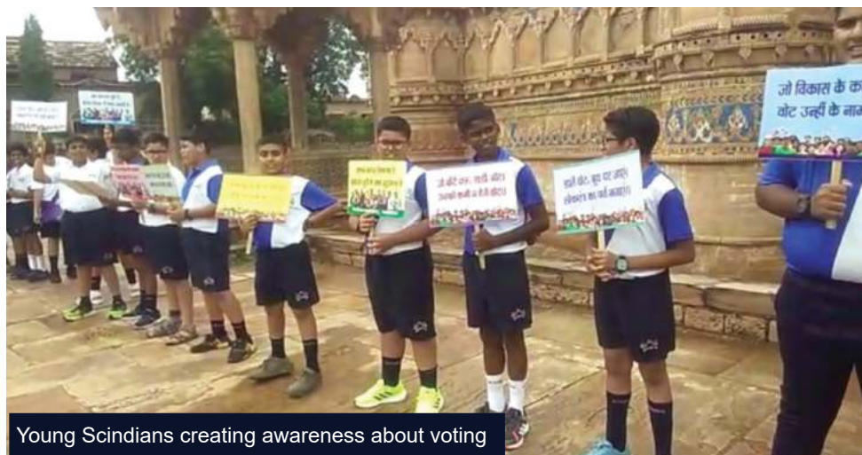
Young Scindians creating awareness about voting

On 14th August 2023, the students of the Junior Houses visited the Man Singh Palace for creating awareness about voting. The students worked with other schools to create voting-themed banners and boards. The activity emphasized the importance of voting in a democracy. The students spread awareness