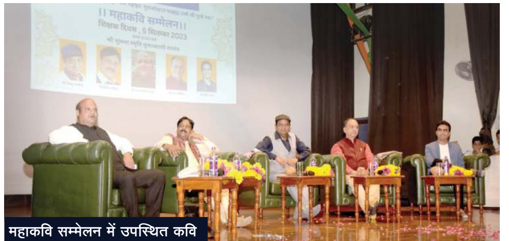
महाकवि सम्मेलन में उपस्थित कवि