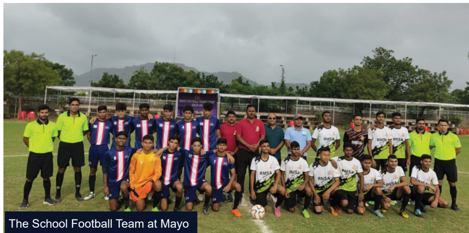
The School Football Team at Mayo