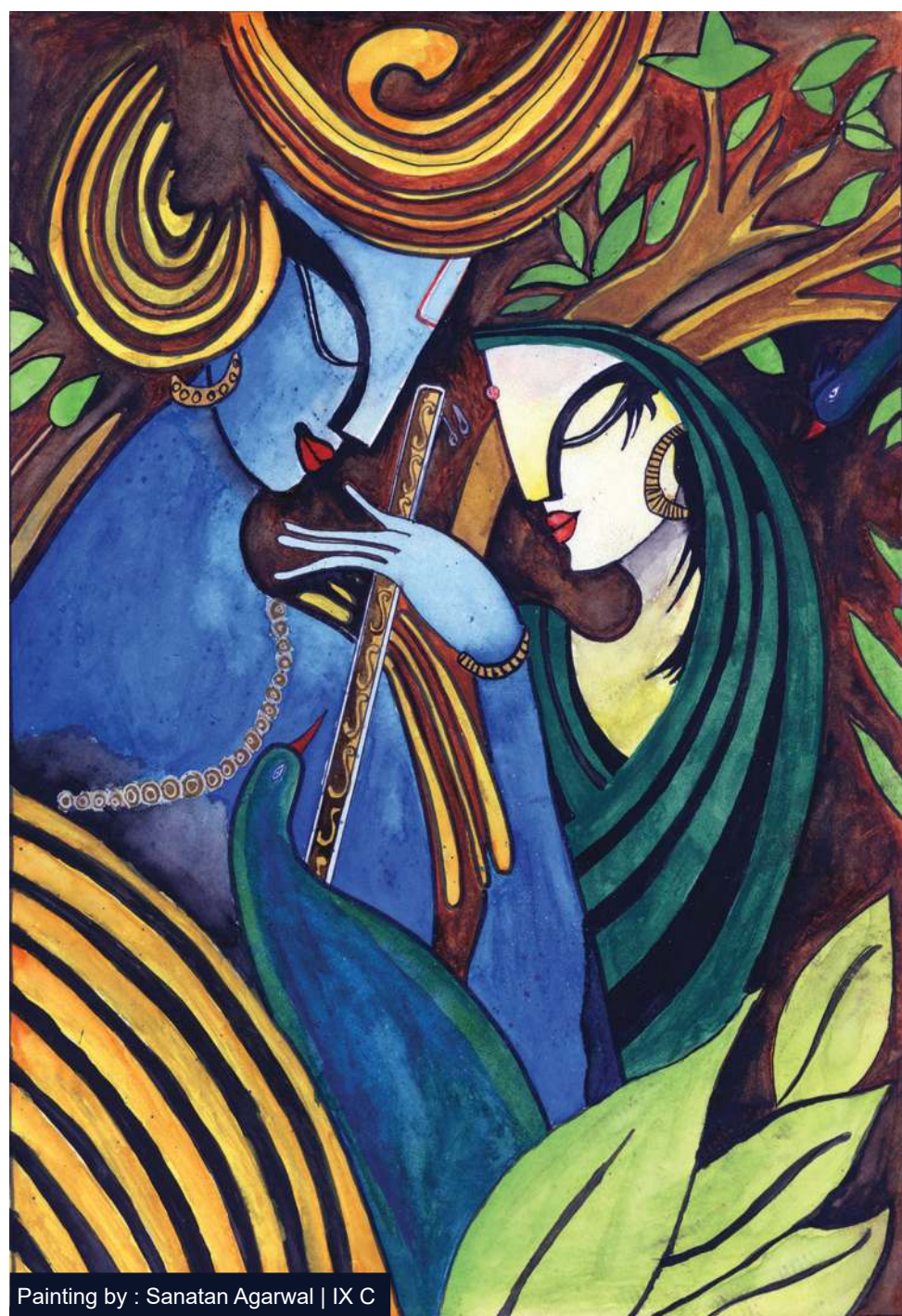
Painting by : Sanatan Agarwal | IX C