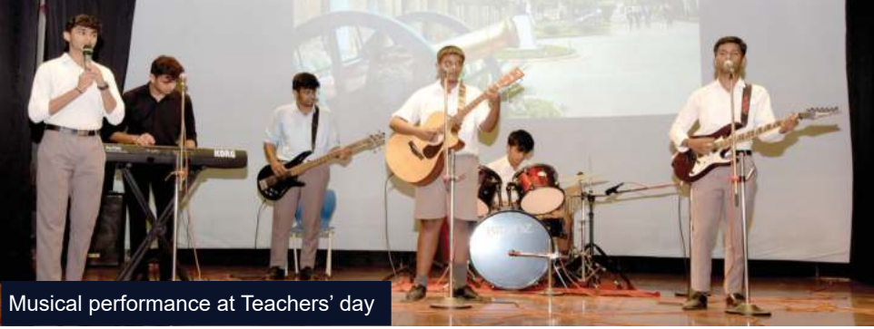
Musical performance at Teachers' day

decorated the Faculty Research Centre. The nights were spent drawing life-sized portraits of the teachers on the bed sheets and finally came the main day. Students of class XII took charge of the classes till Nihari giving teachers some rest and happiness in their own way. After Nihari, the students of class XII organized an interesting treasure hunt for the teachers. The teachers were seen running around (a rare sight) deciphering the riddles. Who won is still debatable. This was followed by a splendid event for the teachers. They sang, danced, and distributed various symbolic 'awards' to their batch mates in a hilarious manner. The students' video presentation, highlighting the teachers' lives from their perspective, was the standout moment of the show. Later in the evening, a "Kavi Sammelan" was organized by the school for some dignitaries, members of staff and the students.