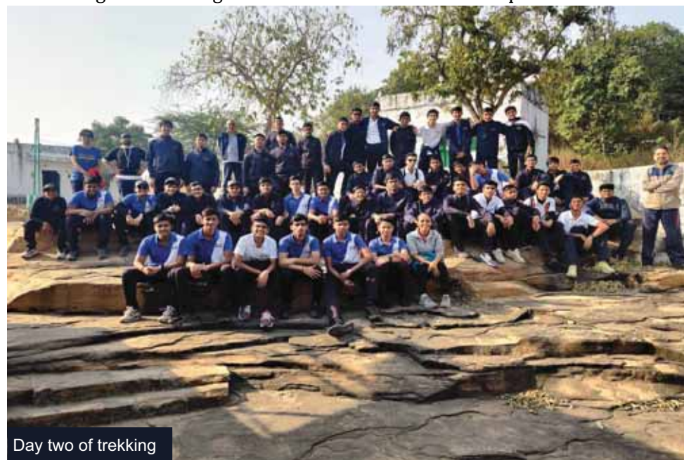
Day two of trekking

On Sunday the students went to experience the natural topography of Gwalior i.e. the plateau region. They covered a trek of 6 kms and enjoyed the sight of natural vegetation that grew on it. It was a memorable trip for the students.