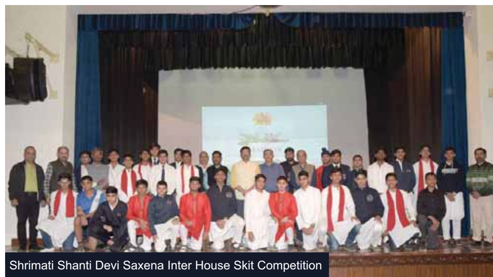
Shrimati Shanti Devi Saxena Inter House Skit Competition

Shrimati Shanti Devi Saxena Inter House Skit Competition was organized on two days with four senior Houses performing on each day. The topics were allotted to the Houses through a draw of lots so that the students could get