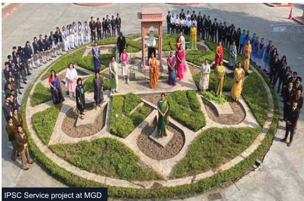
IPSC Service project at MGD

sold later to raise money for charity. The project raised an approximate sum of 84000 rupees for donation. It was a truly enriching experience for all the participants.