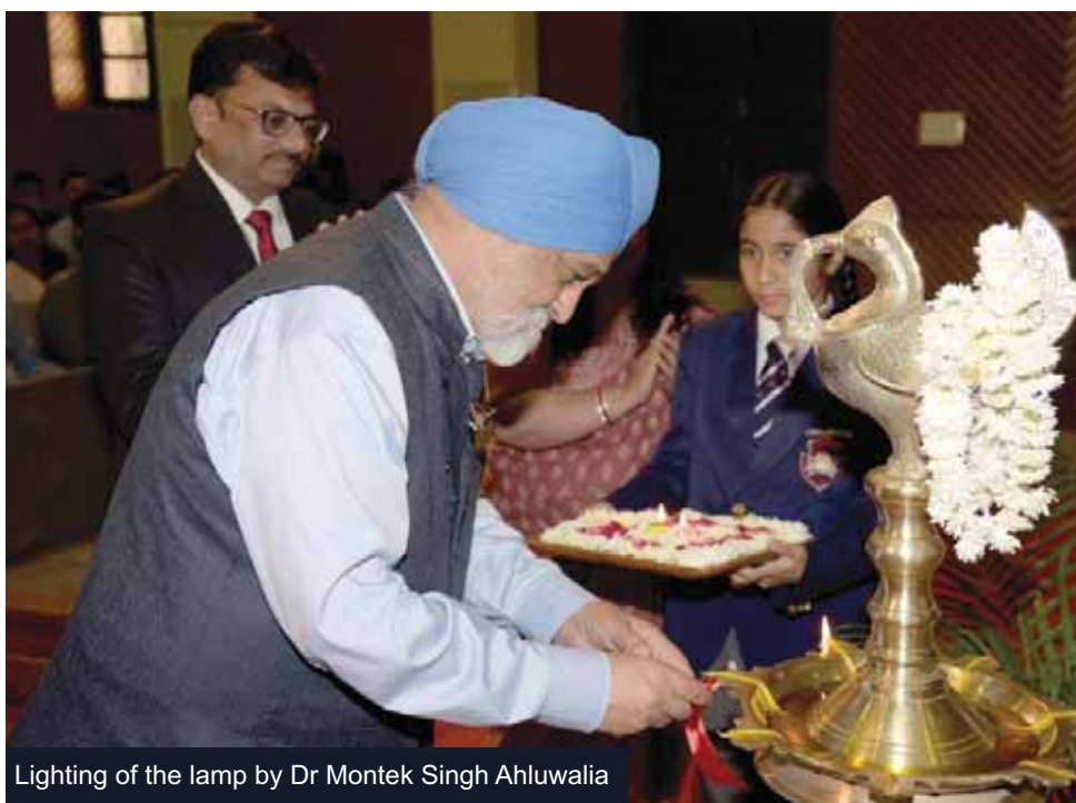
Lighting of the lamp by Dr Montek Singh Ahluwalia