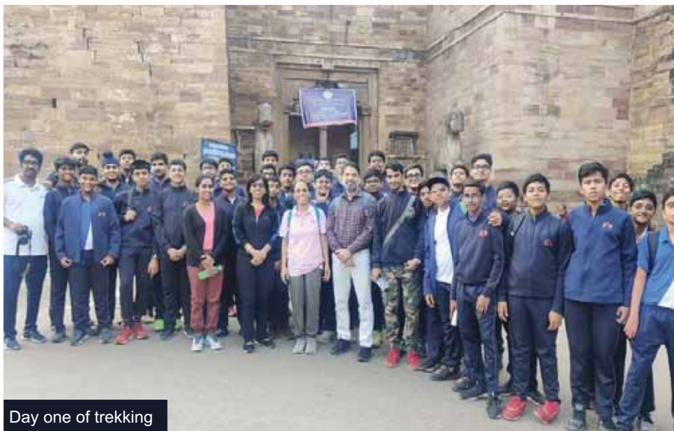
Day one of trekking