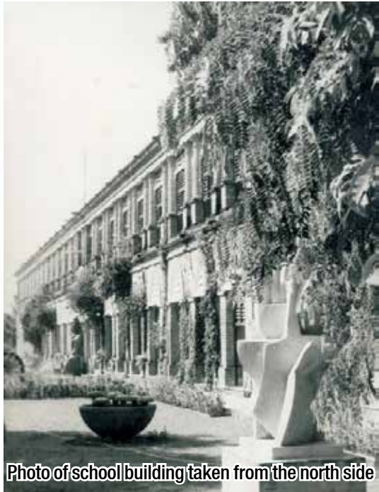
Photo of school building taken from the north side