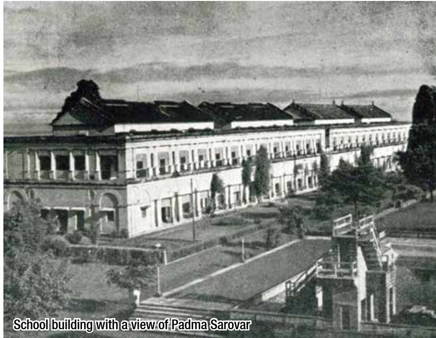
School building with a view of Padma Sarovar