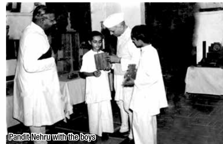
Pandit Nehru with the boys