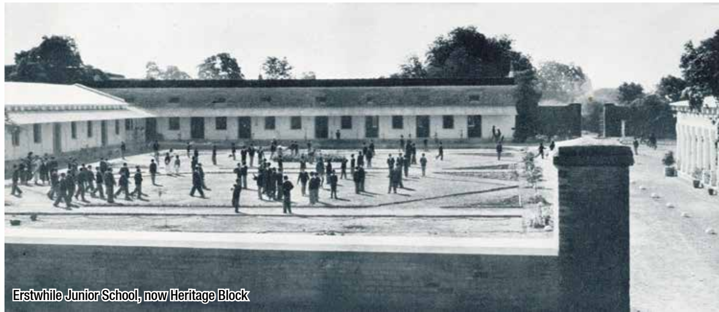
Erstwhile Junior School, now Heritage Block