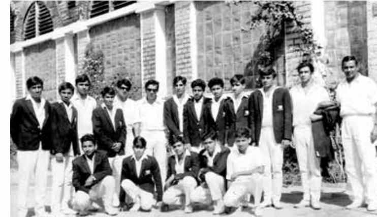
Late H H Maharaja with Nawab Pataudi and the Cricket Team