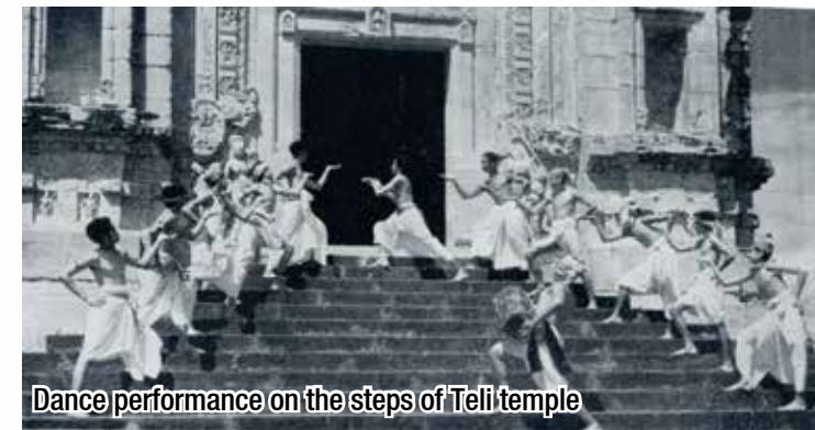
Dance performance on the steps of Teli temple