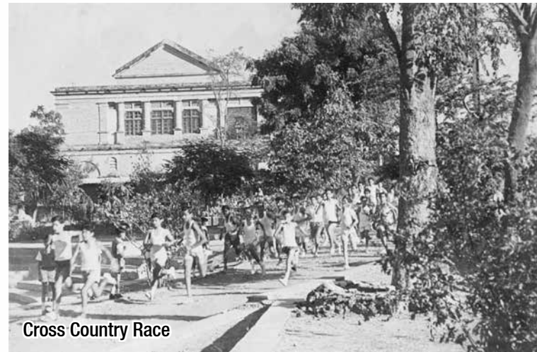
Cross Country Race