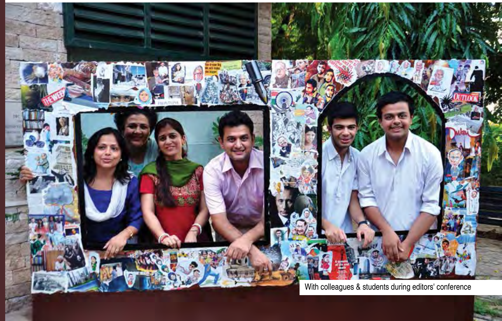
With colleagues & students during editors' conference