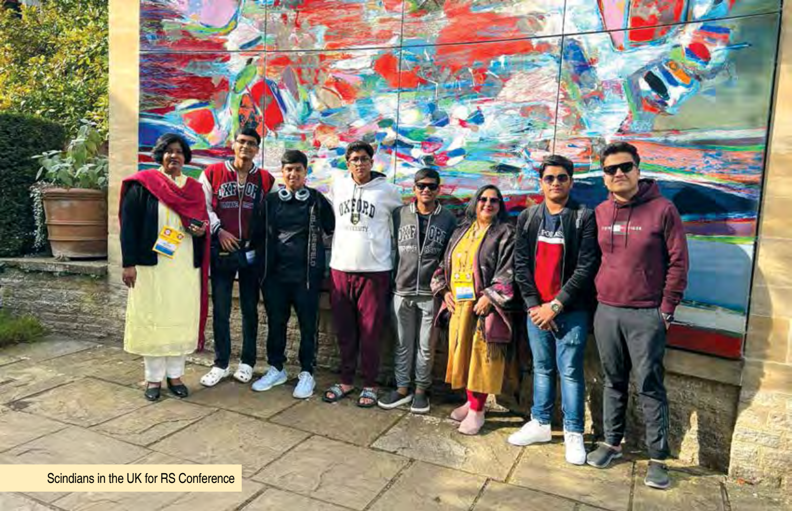
Scindians in the UK for RS Conference