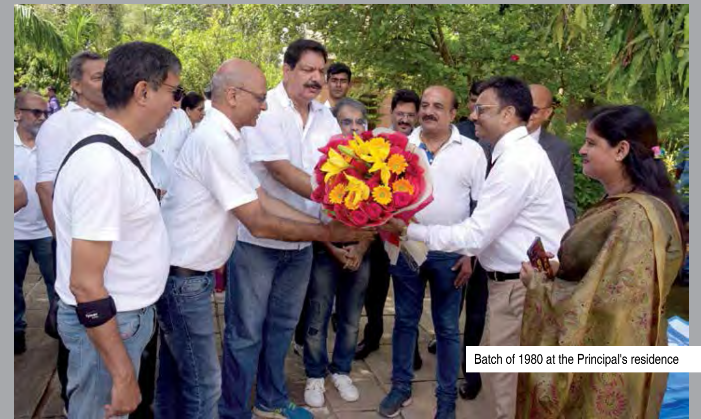
Batch of 1980 at the Principal's residence