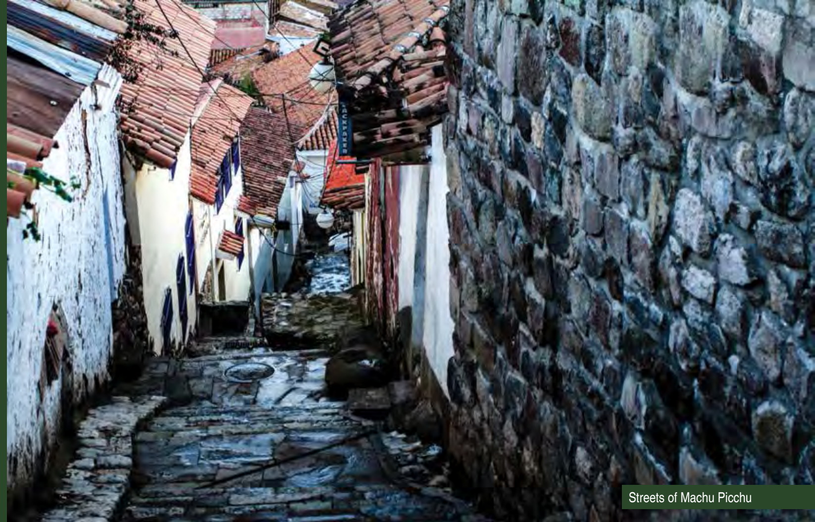
Streets of Machu Picchu