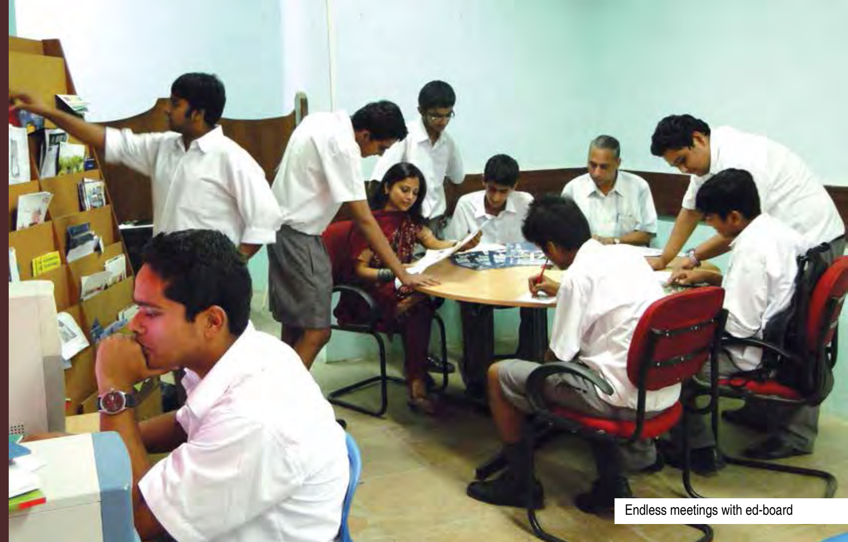
Endless meetings with ed-board

Vice Principal, Ecole Globale International Girls’ School (Founder Editor - QQ; Former Editor - Review; Former HOD- English Department, The Scindia School )