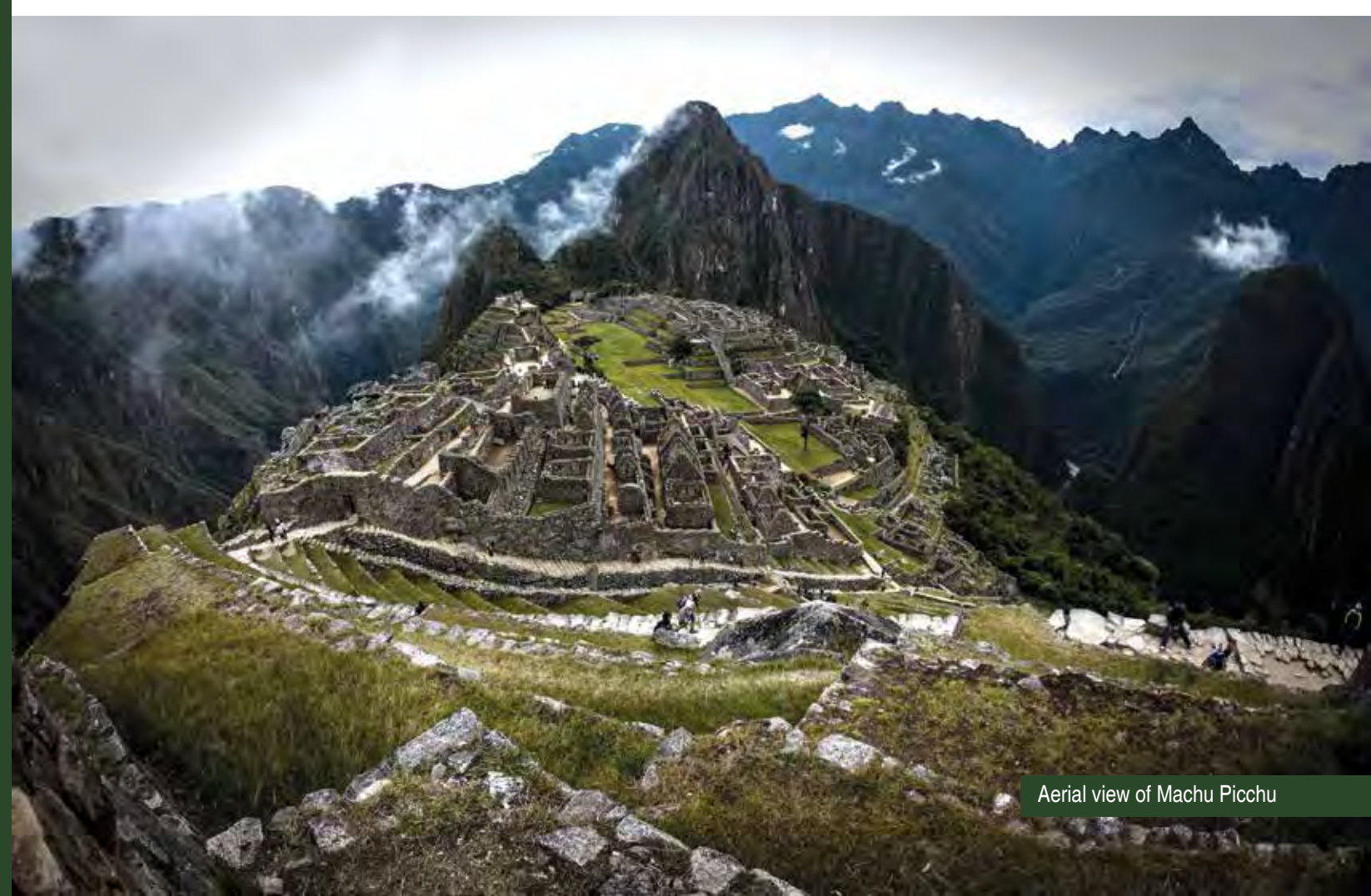
Aerial view of Machu Picchu