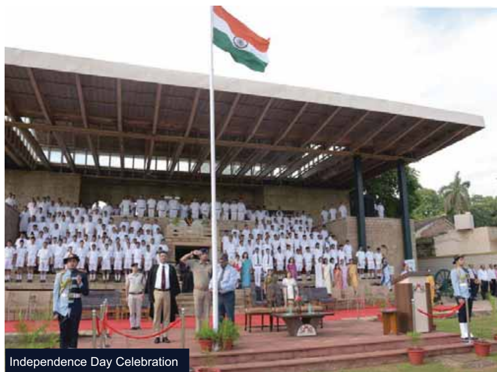
Independence Day Celebration

Independence Day was celebrated with fervour and gaiety at the Fort. It was yet again an exhibition of the unmatched spirit of Scindians and their indomitable spirit. The celebration started with the arrival of the Chief Guest,