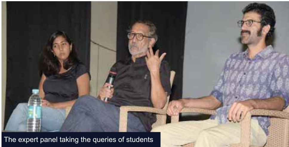
The expert panel taking the queries of students