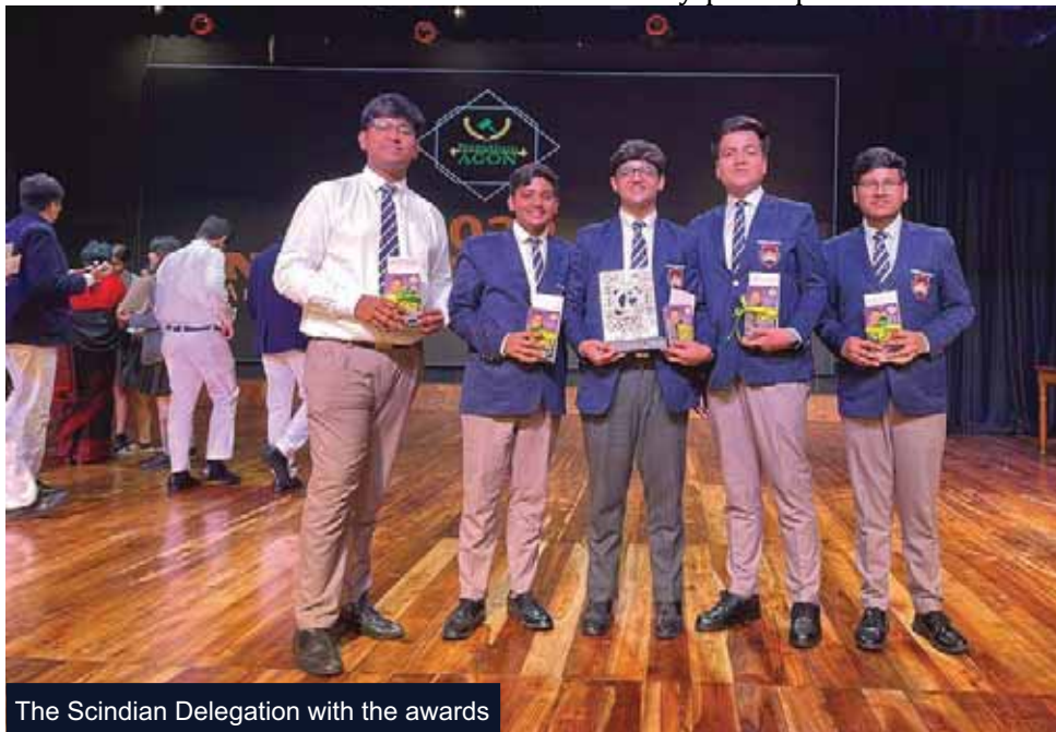
The Scindian Delegation with the awards

The Scindia School participated in the NEGOTIUM AGON 2022, an annual inter-school Business Fest held at Wynberg Allen School, Mussoorie on 30 July, 2022. About 34 schools from all over the country participated in this event.