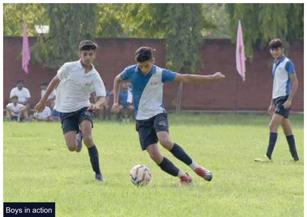
Boys in action

I Jayaji II Daulat III Mahadji IV Ranoji V Jayappa VI Shivaji VII Jeevaji