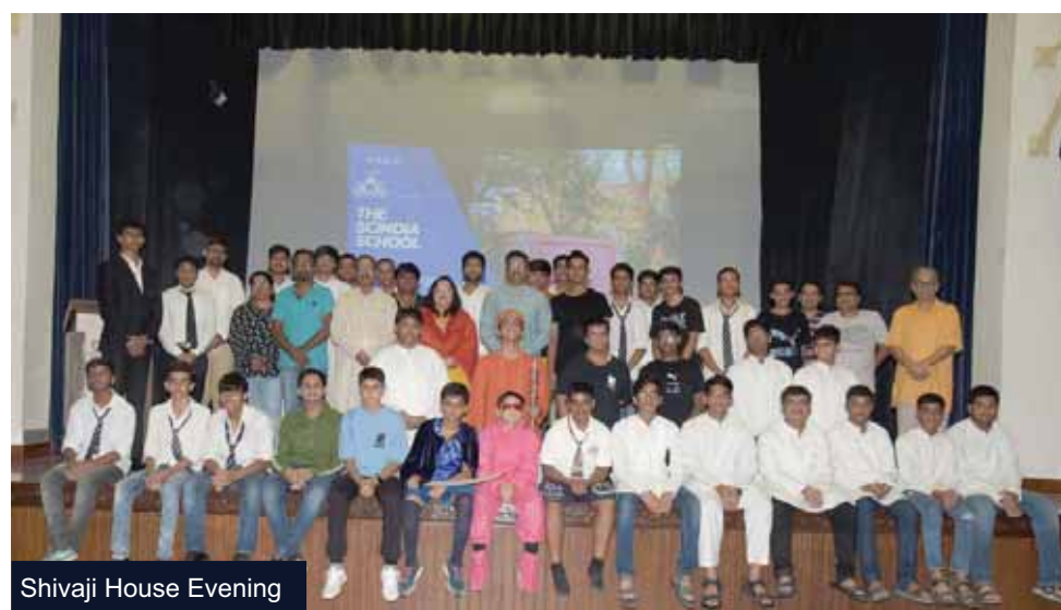
Shivaji House Evening