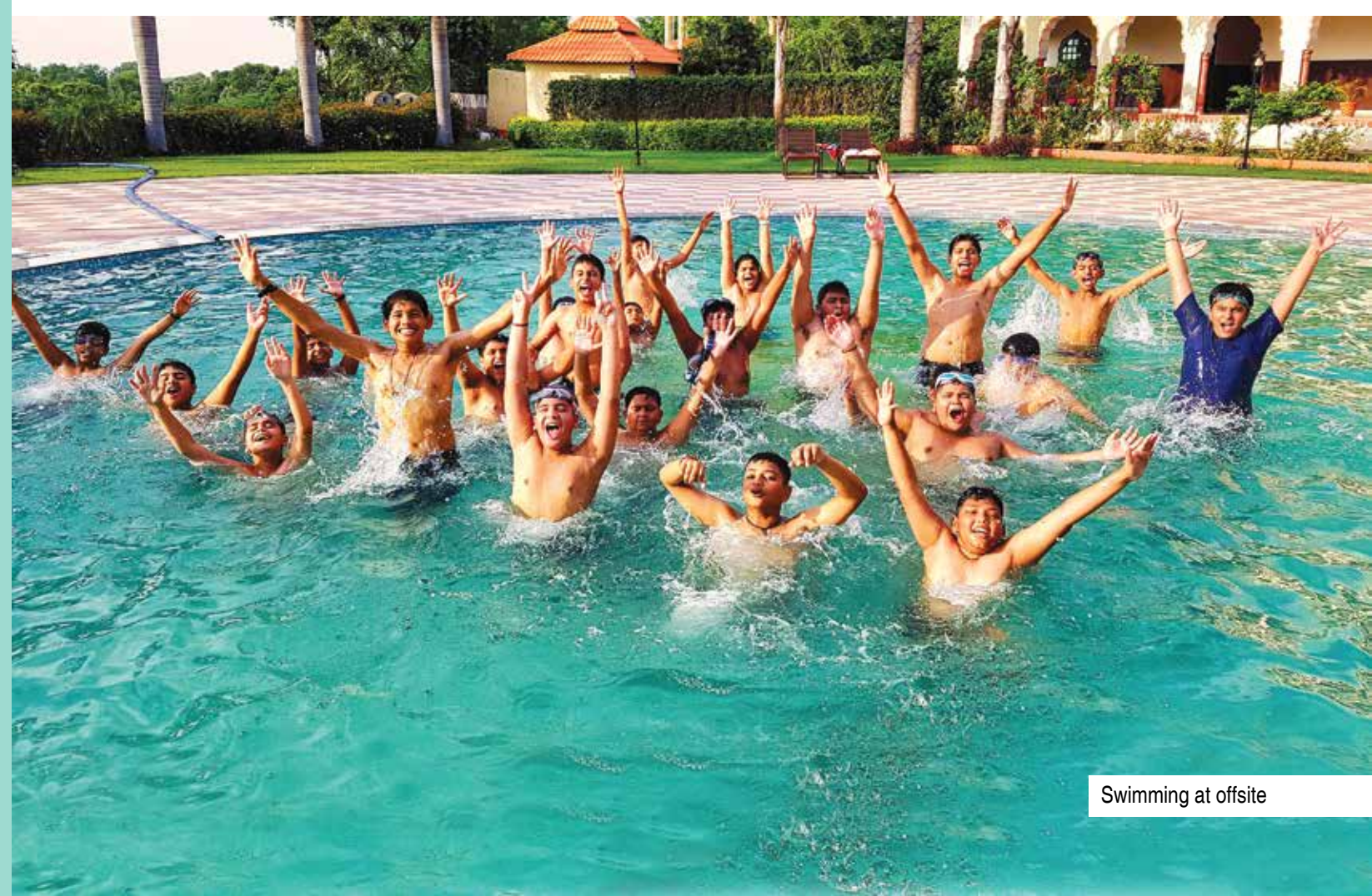
Swimming at offsite