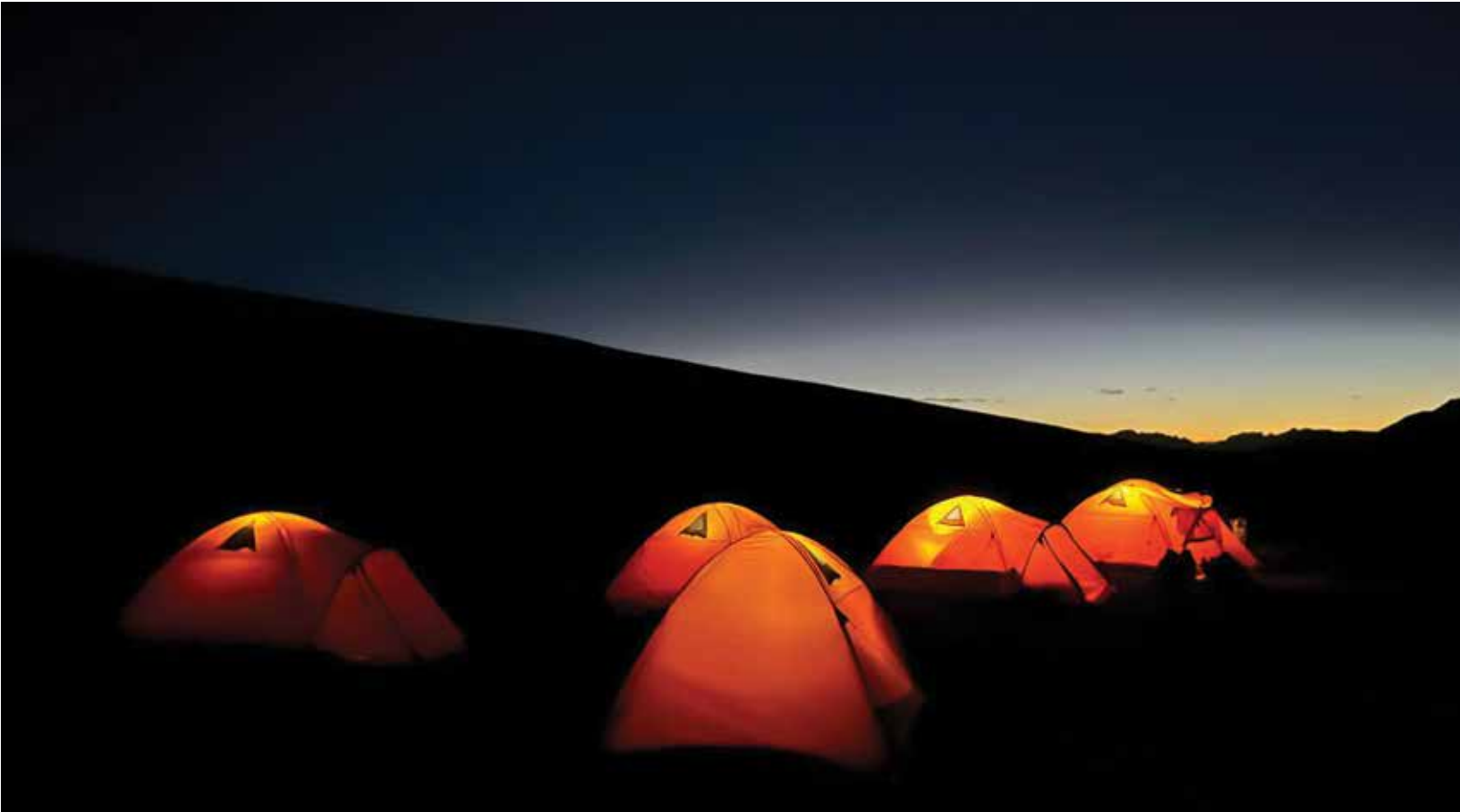
Scindian trekkers in their tents in Ladakh