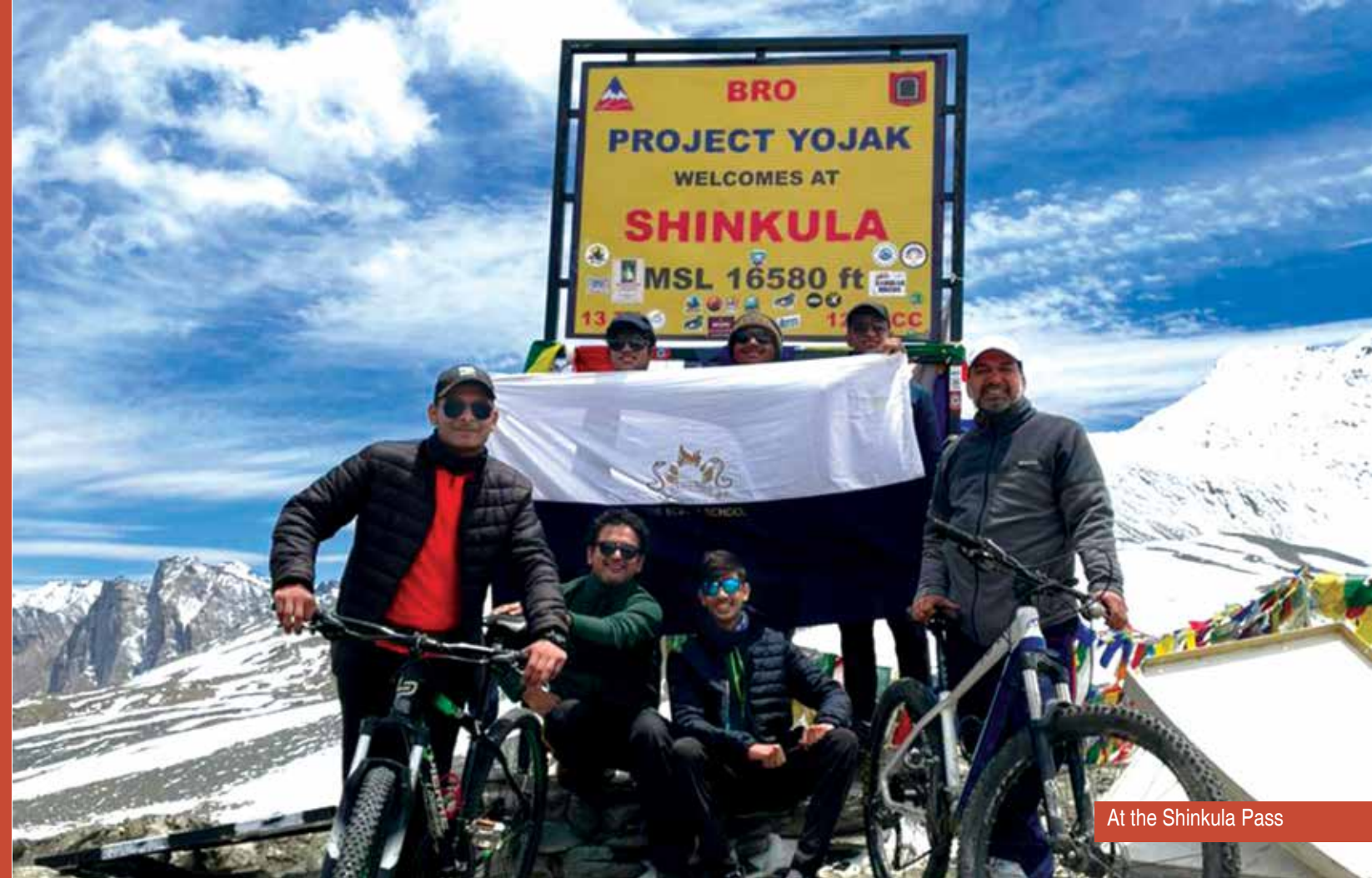
At the Shinkula Pass