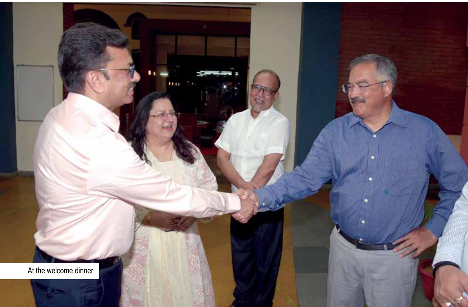
At the welcome dinner