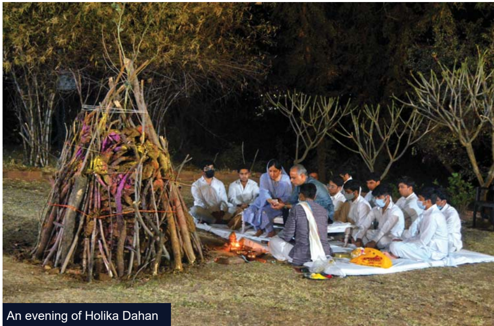
An evening of Holika Dahan