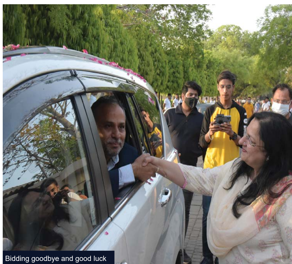
Bidding goodbye and good luck

work, honesty and accountability. If we are playing our role with integrity then, there is no reason that we won't prosper. We need to create safe spaces for everyone alike in a manner that all can share their stories without feeling weak and without the fear of judgement." The Scindia School wishes him all the very best for the future and hopes to remain under the awning of his guidance and mentoring, even though from a distance.