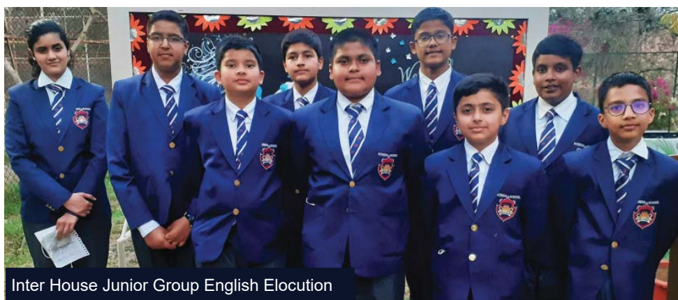
Inter House Junior Group English Elocution

The Junior Group Inter House English Elocution was held on the 8th of March 2022. The theme was the International Women's Day. We had some beautiful speeches and poems selected from world famous names such as Malala Yusufzai, Kamala Harris, Oprah Winfrey, Silvia Plath, Maya Angelou, and Muniba Mazari.