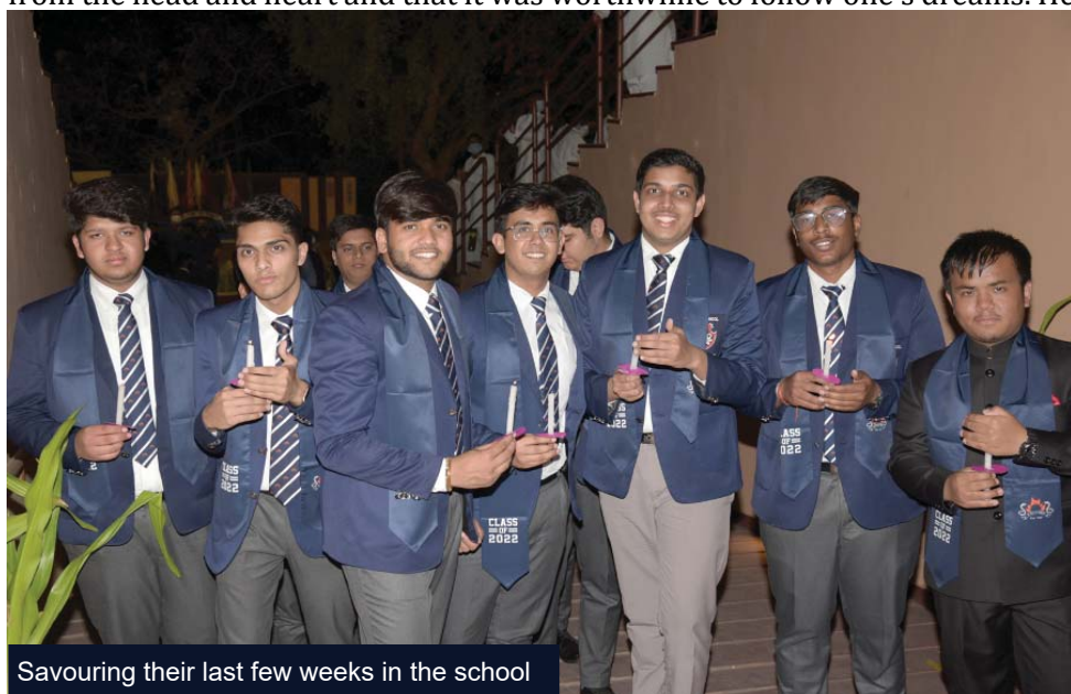
Savouring their last few weeks in the school