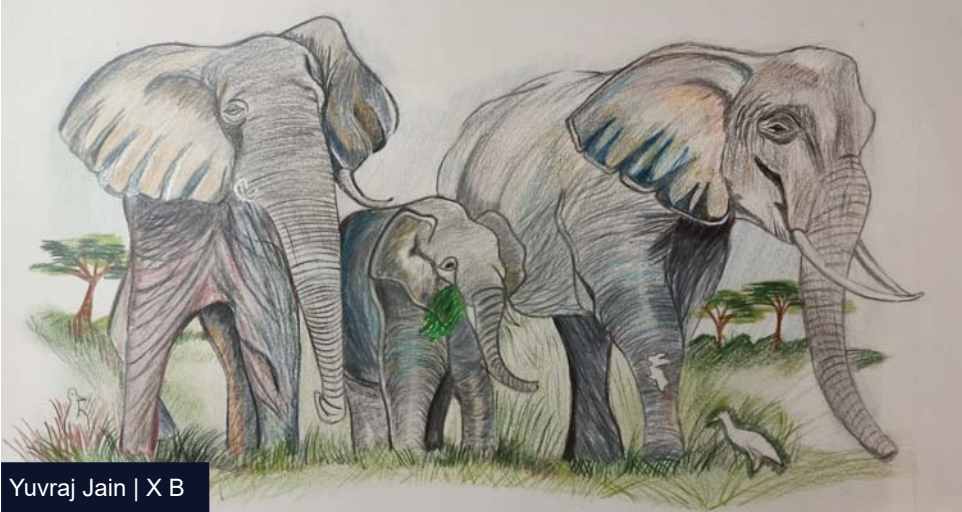
Yuvraj Jain | X B