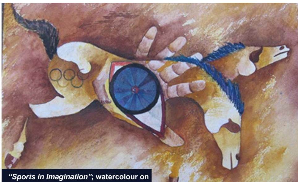
"Sports in Imagination", watercolour on paper; 18" x 12"; 2007