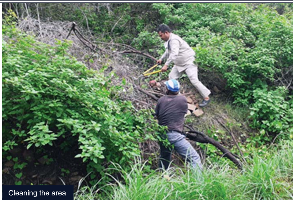
Cleaning the area