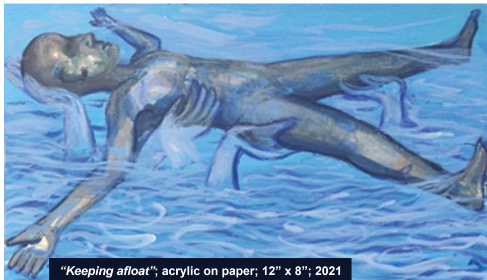
"Keeping afloat"; acrylic on paper; 12" x 8"; 2021