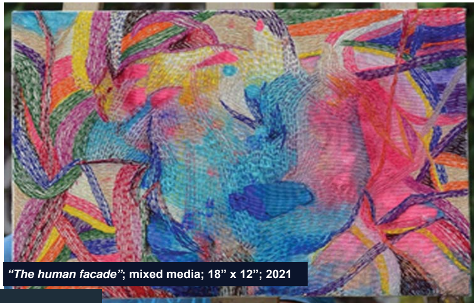
"The human facade"; mixed media; 18" x 12"; 2021