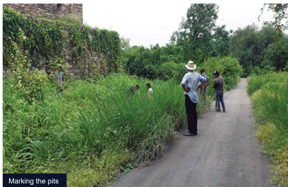
Marking the pits