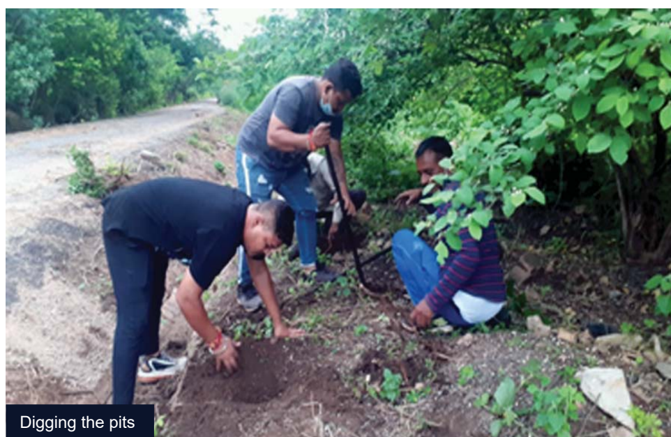
Digging the pits