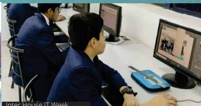
Inter House IT Week