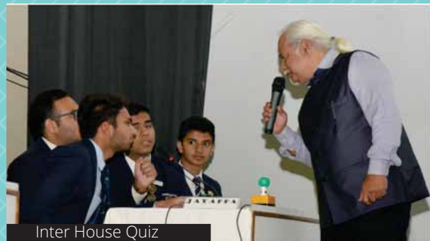
Inter House Quiz