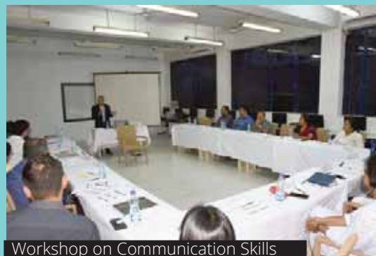
Workshop on Communication Skills