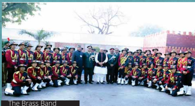
The Brass Band