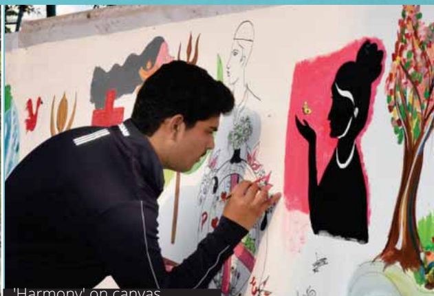
'Harmony' on canvas