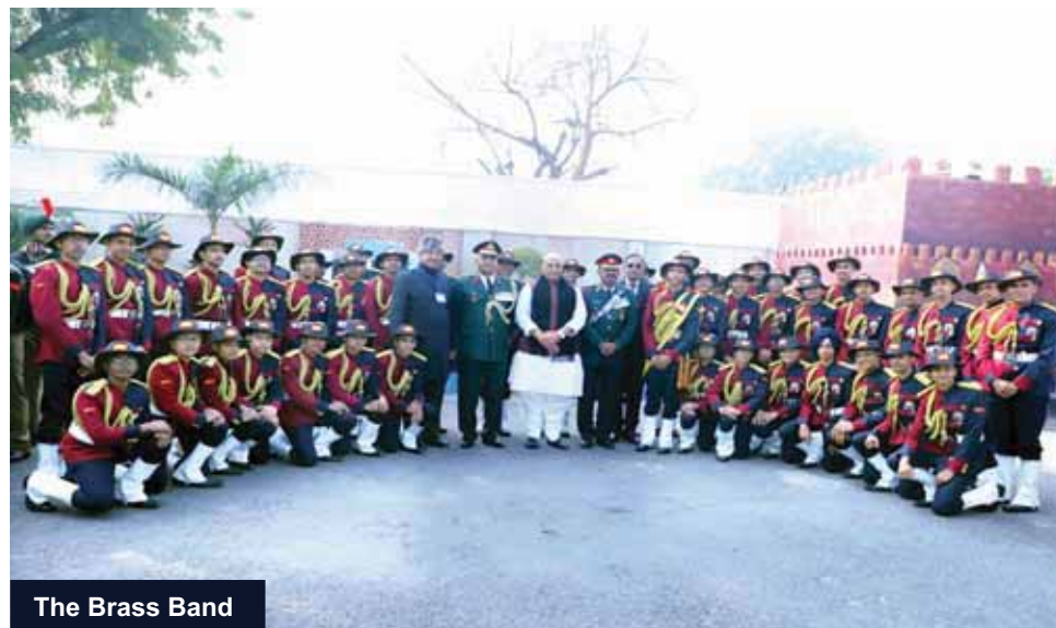
The Brass Band