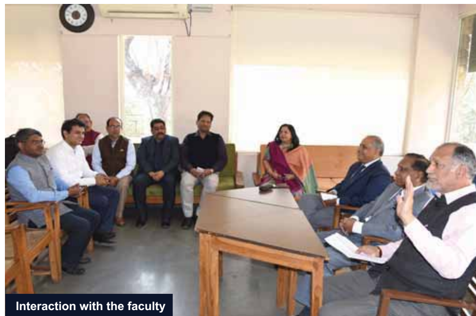
Interaction with the faculty