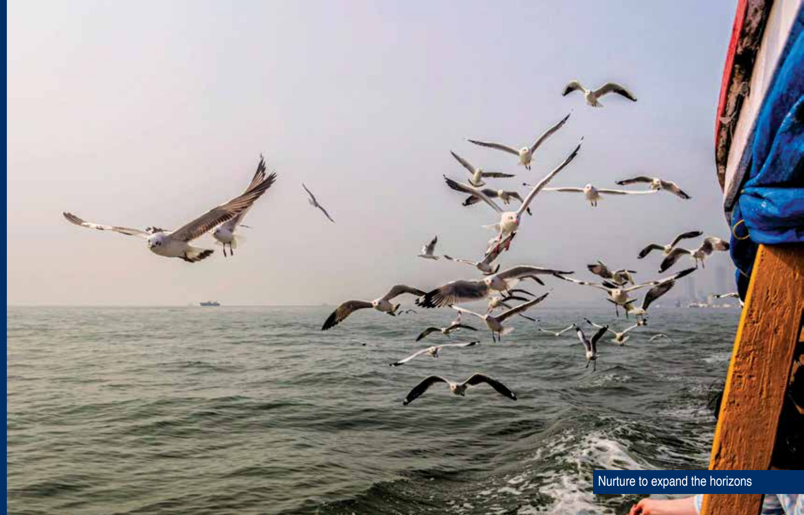
Nurture to expand the horizons