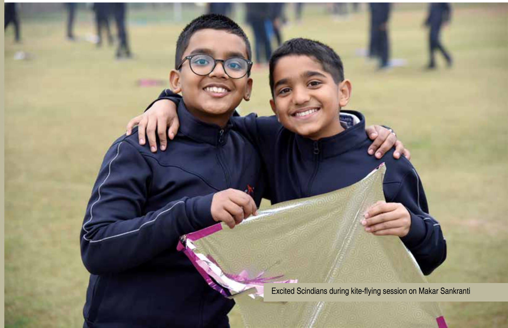
Excited Scindians during kite-flying session on Makar Sankranti