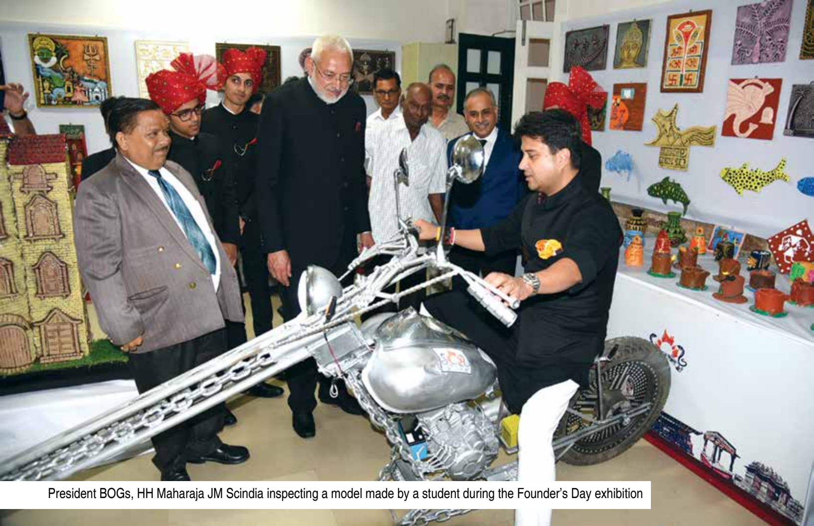
President BOGs, HH Maharaja JM Scindia inspecting a model made by a student during the Founder's Day exhibition