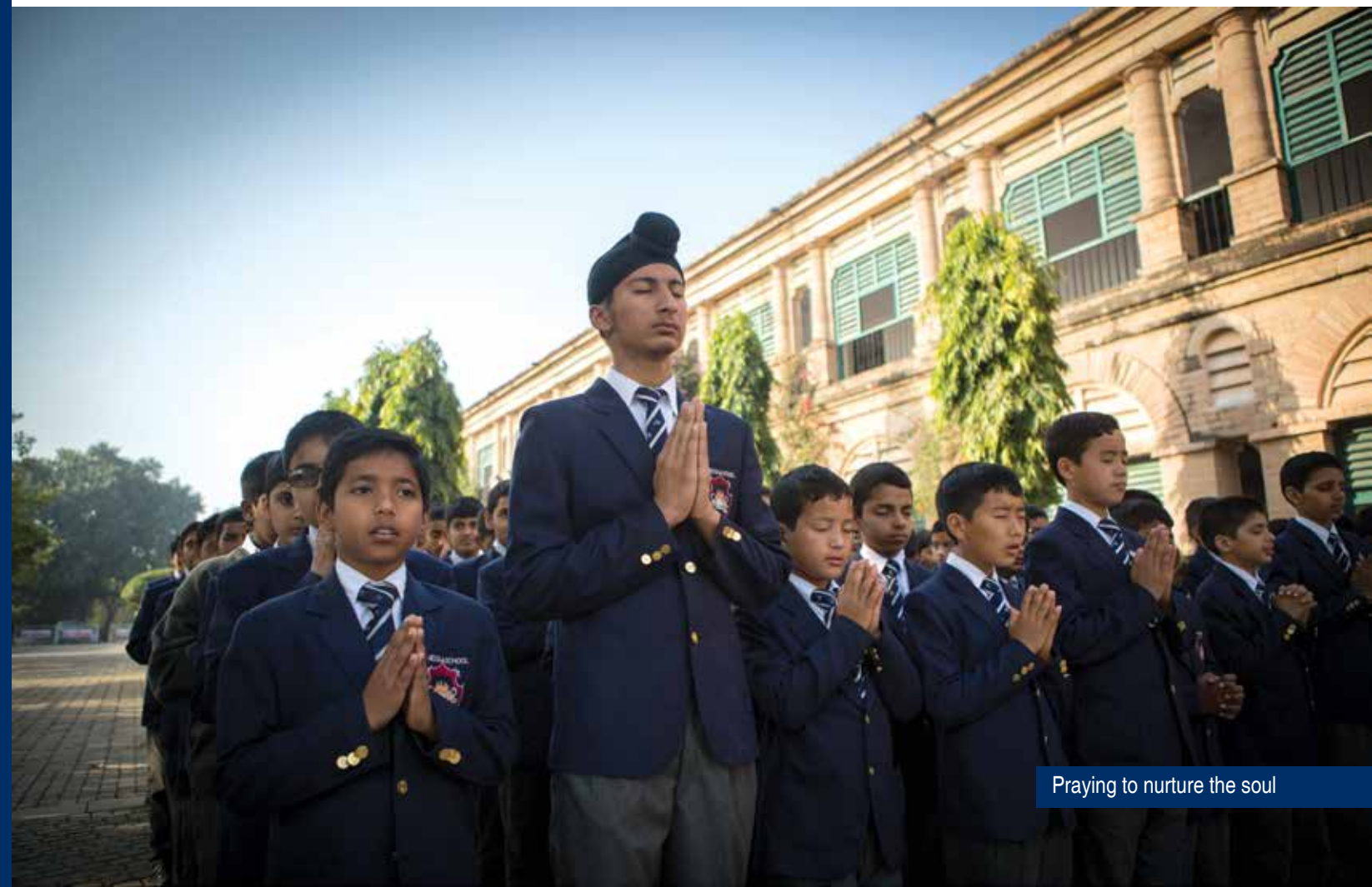
Praying to nurture the soul