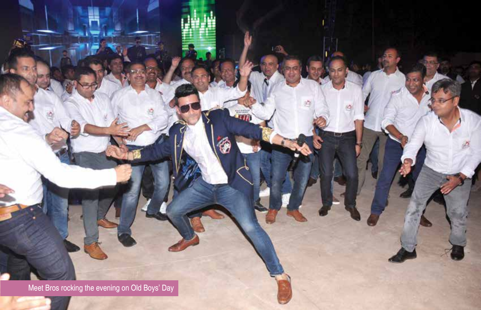
Meet Bros rocking the evening on Old Boys' Day