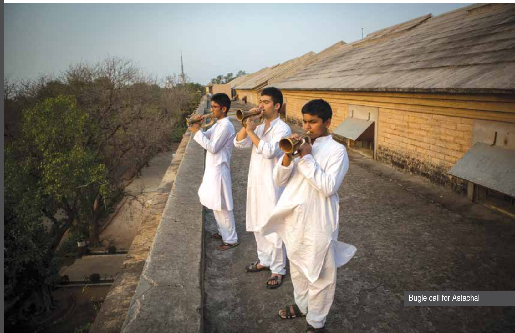
Bugle call for Astachal