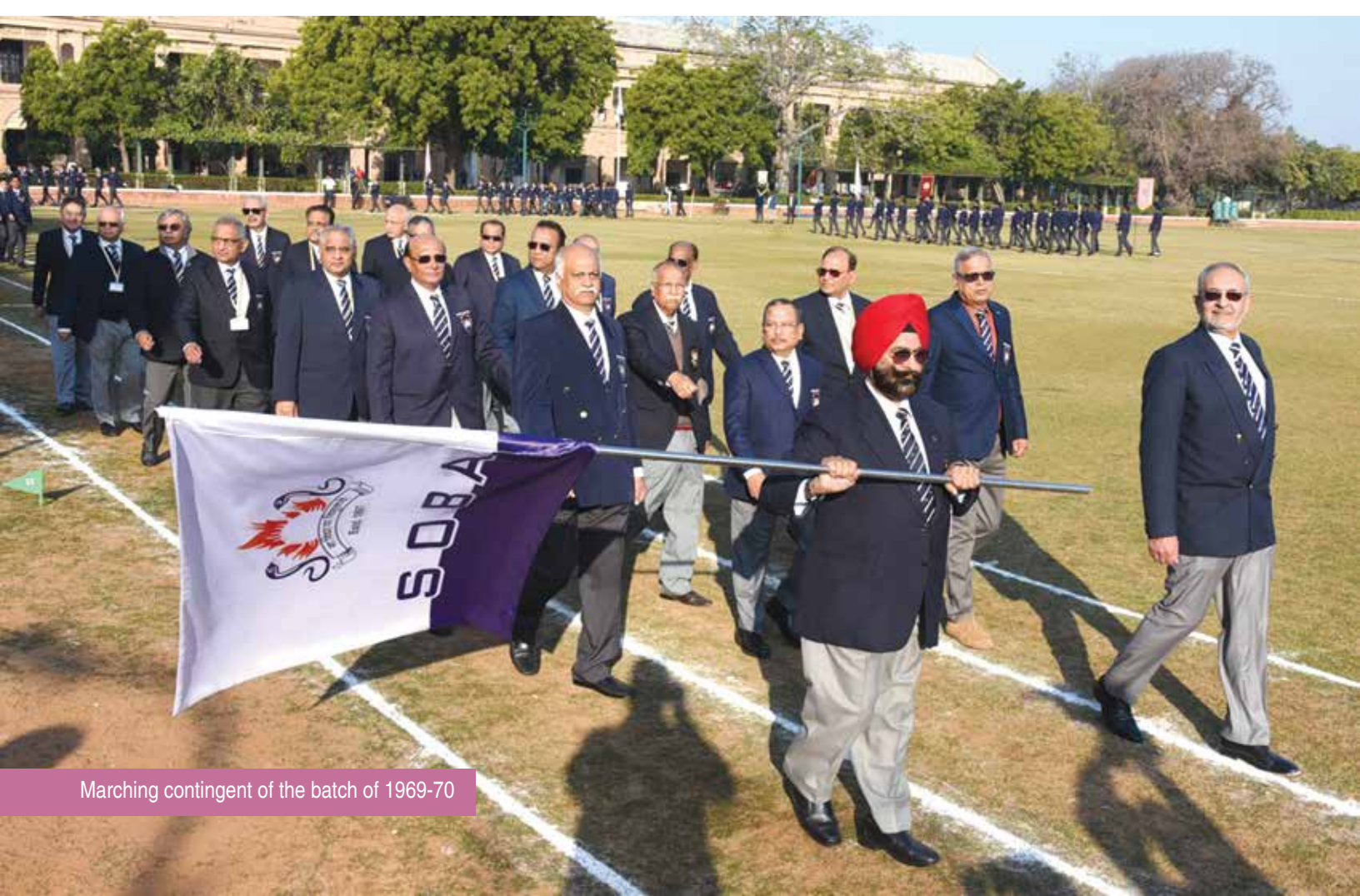
Marching contingent of the batch of 1969-70