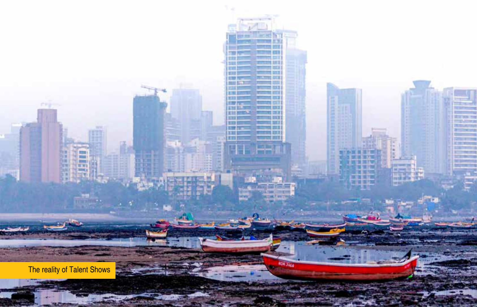
The reality of Talent Shows