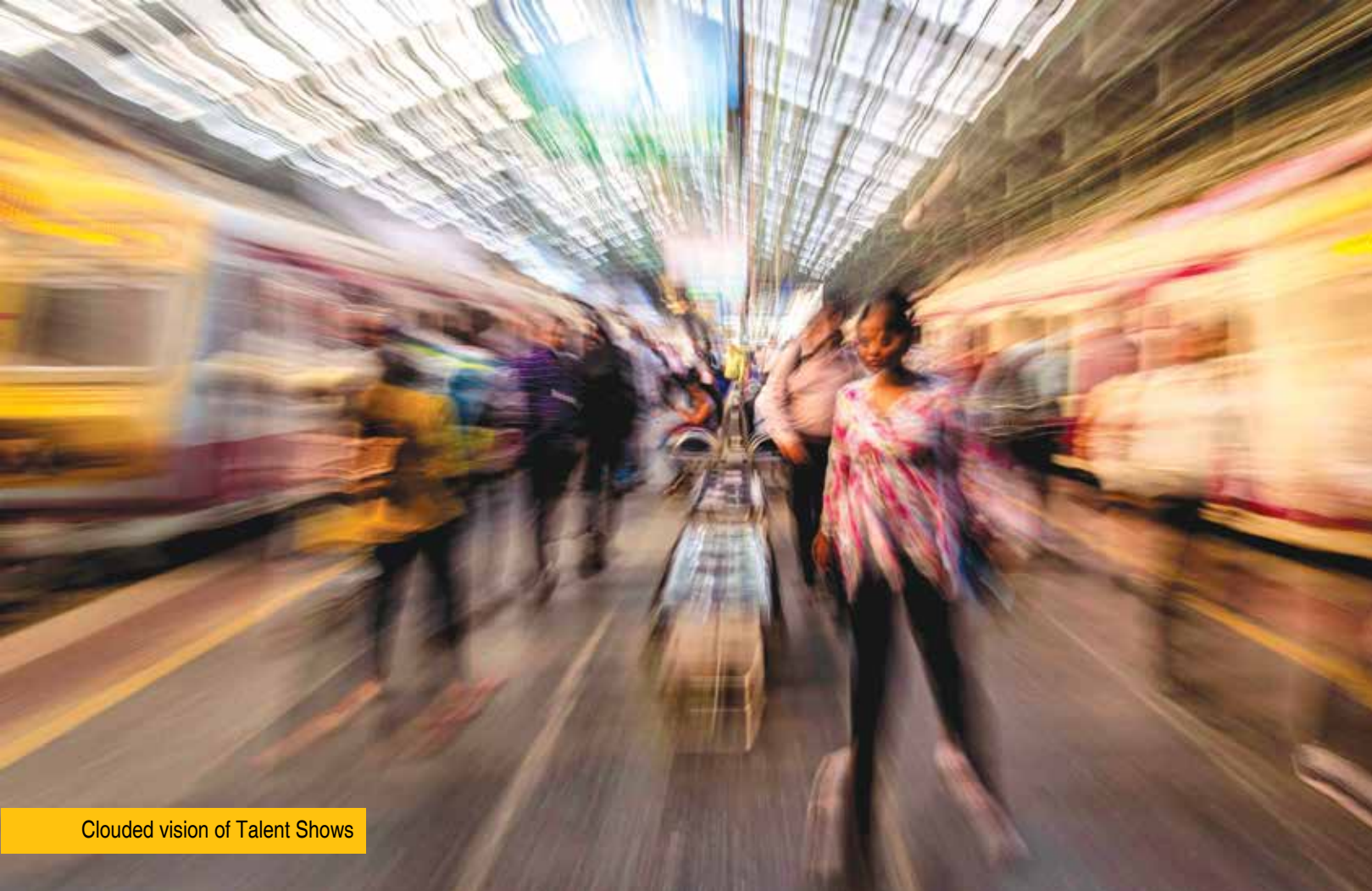
Clouded vision of Talent Shows