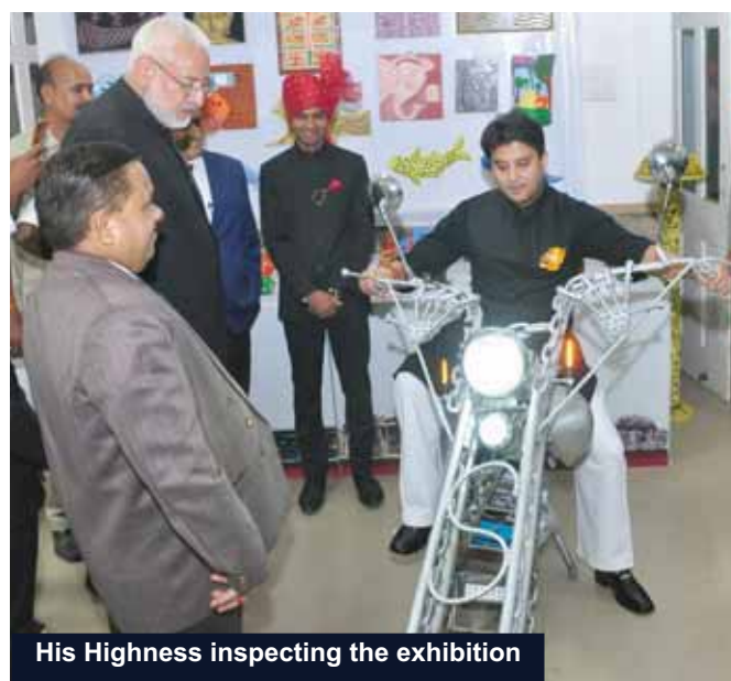
His Highness inspecting the exhibition

हर बच्चे के अपने-अपने ख्वाब होते हैं। कुछ का खेल, कुछ का संगीत, कुछ का चित्रकारी। ऐसे ही मेरा गाड़ी और मोटरसाइकिलों का शौक है। मैं अपने खाली समय में इन सबकी चित्रकारी करता था और बड़े होकर अपने बनाए गाड़ी और मोटरसाइकिलों के चित्र को वास्तव में चलते हुए रूप में देखना चाहता था।