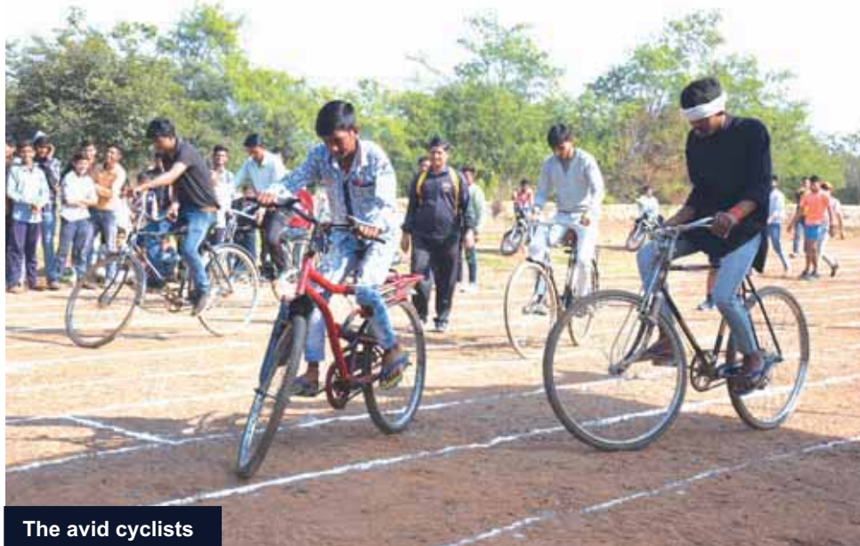
The avid cyclists

February 2020. The representatives of The Scindia School included 25 faculty members and 64 senior students. The day was celebrated as the 'Sports Day' in which the village boys and girls competed in various sports like kabaddi,