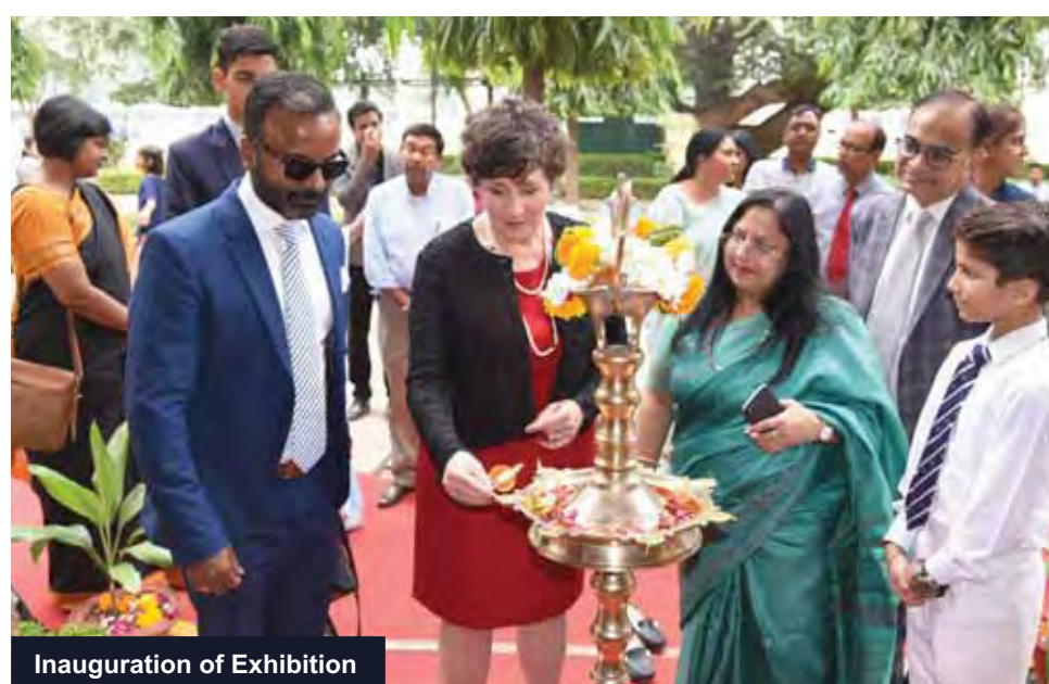
Inauguration of Exhibition