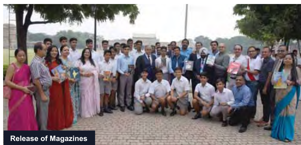
Release of Magazines