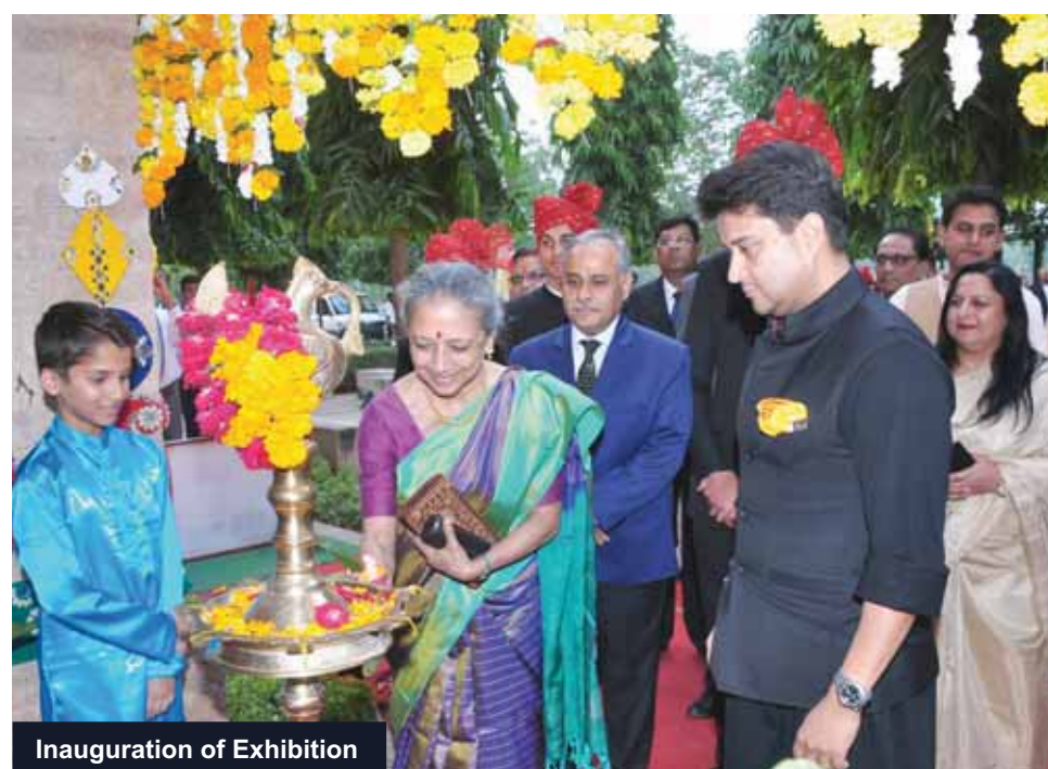
Inauguration of Exhibition

to the Scindians to celebrate the notions of innovation, risk taking ability, perseverance and hard work as keys to success.