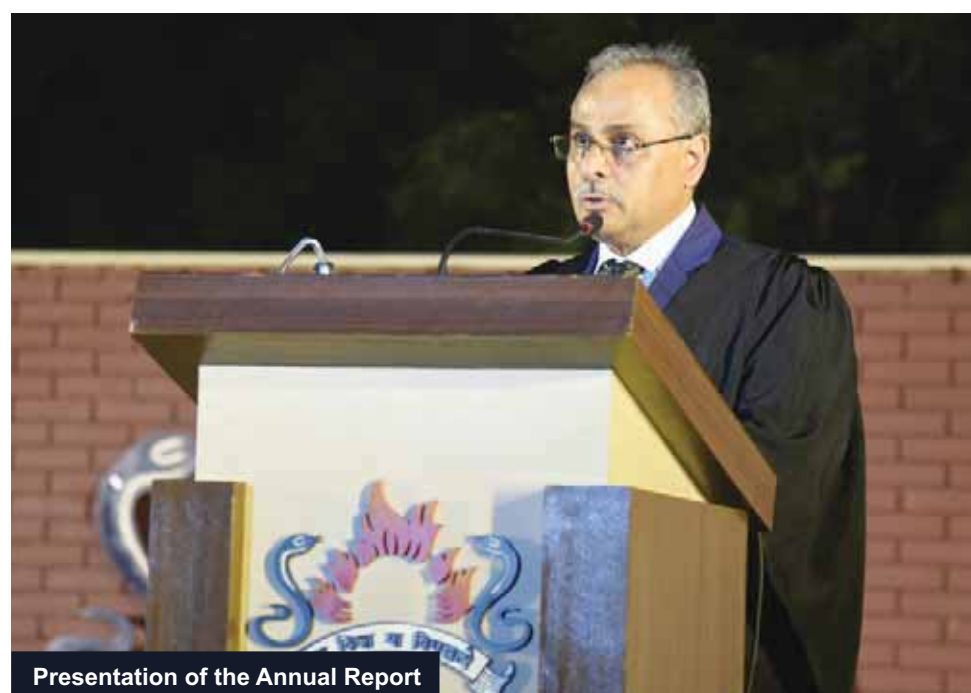
Presentation of the Annual Report

In a school like ours, education is not limited to the classroom and thus nurturing