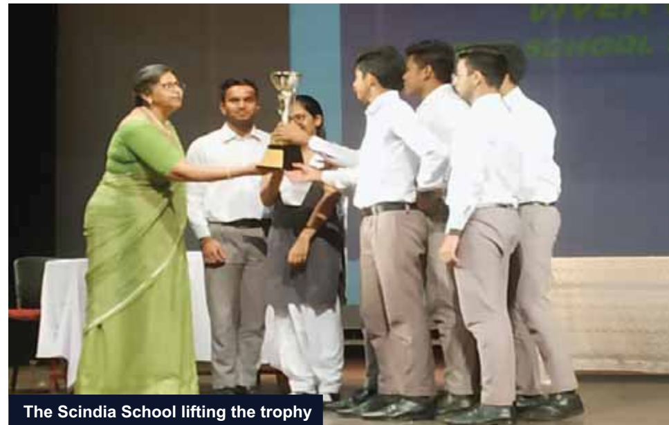
The Scindia School lifting the trophy