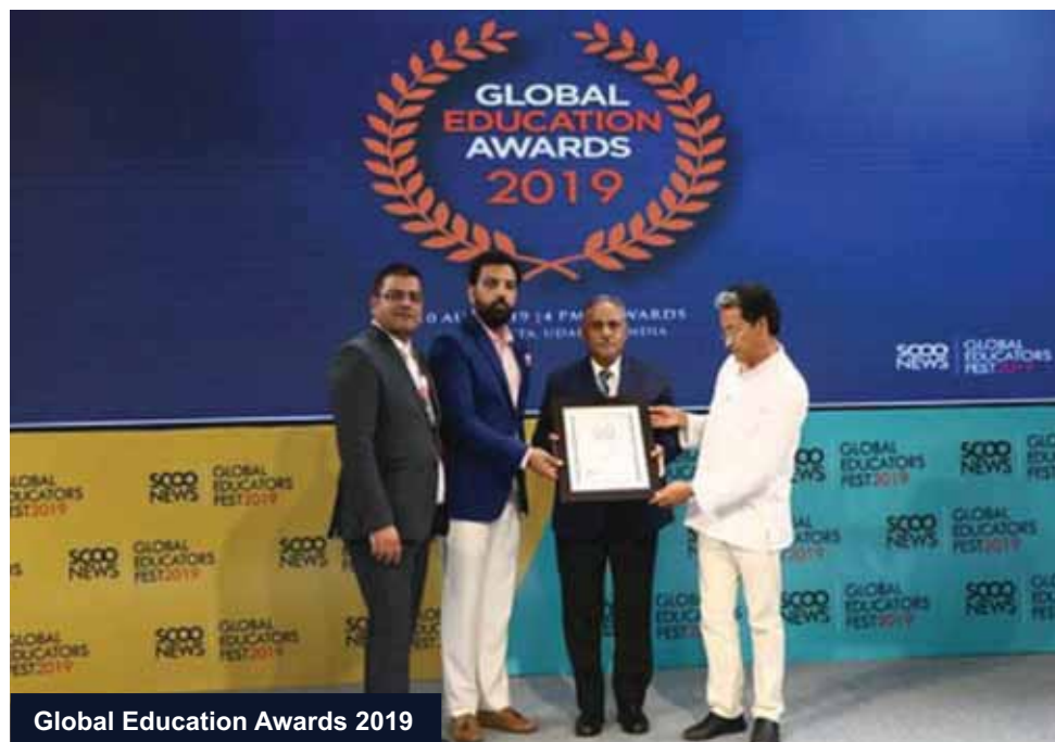
Global Education Awards 2019

The ScooNews Global Education Awards recognise outstanding contributions made by individuals and organisations involved directly or indirectly in