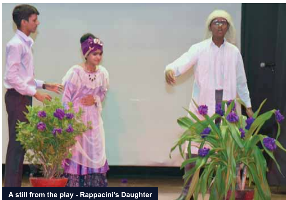
A still from the play - Rappacini's Daughter

The Shanti Devi Memorial English Skit Competition was held on 24th August and 25th August 2019. On 24th August, four Houses staged their plays- Rappacini's Daughter from Daulat House, The Tenth Clew by Jeevaji House, As Simple as A B C by Madhav House and After Twenty Years by Ranoji House. On 25th August, the next four Houses performed the plays- Silver Blaze by