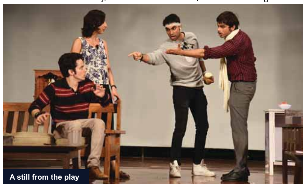
A still from the play