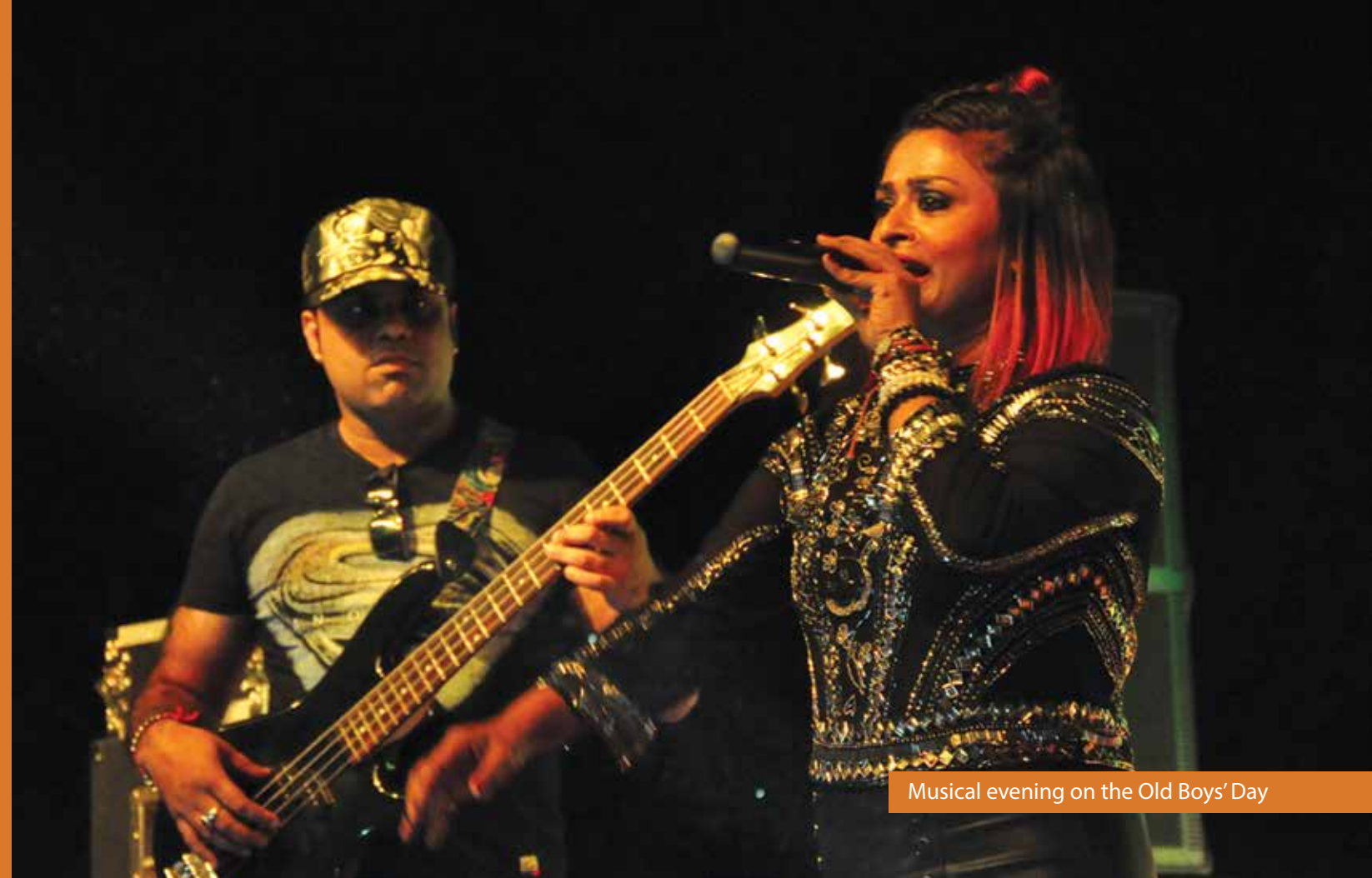
Musical evening on the Old Boys' Day