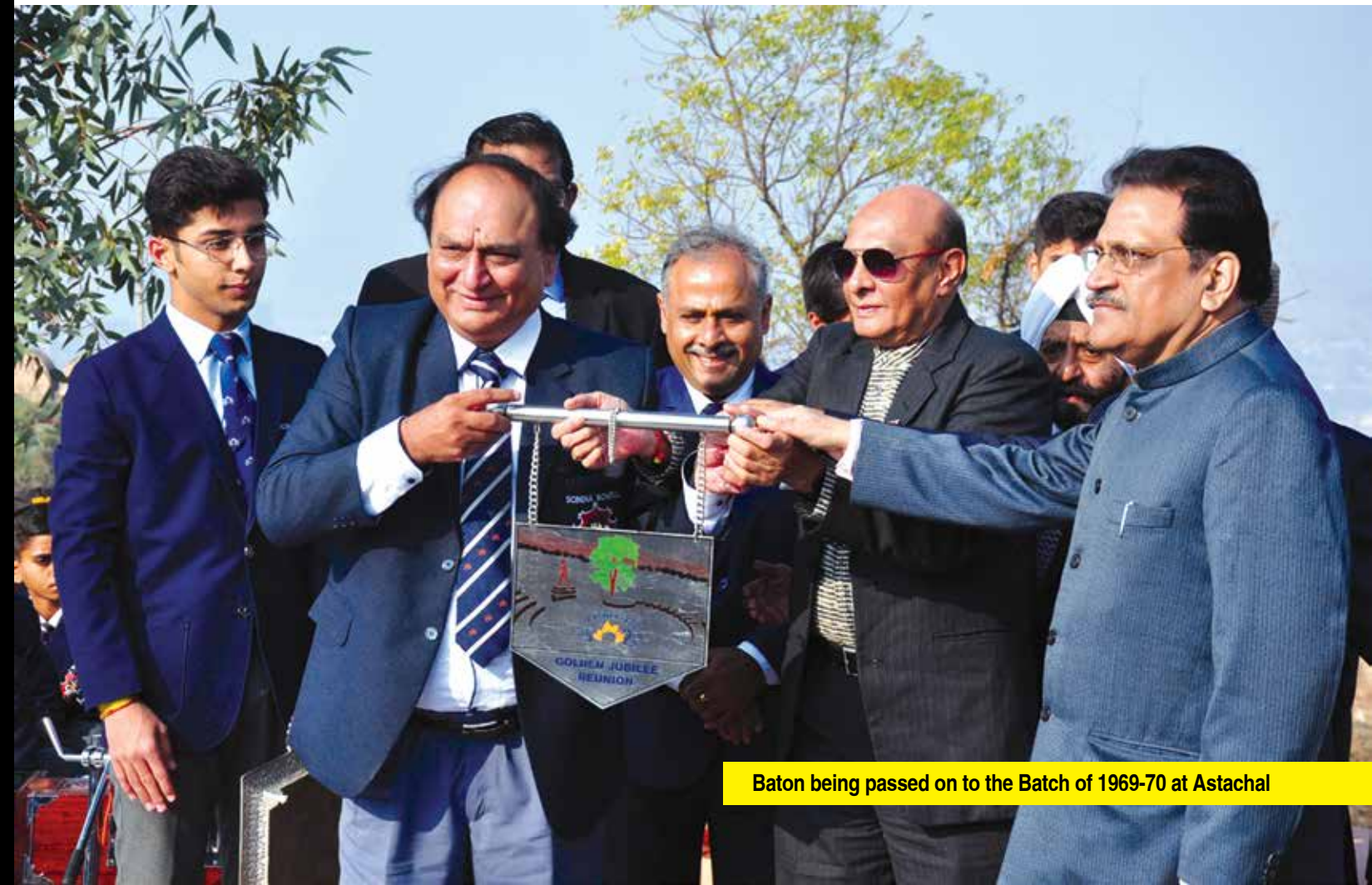
Baton being passed on to the Batch of 1969-70 at Astachal