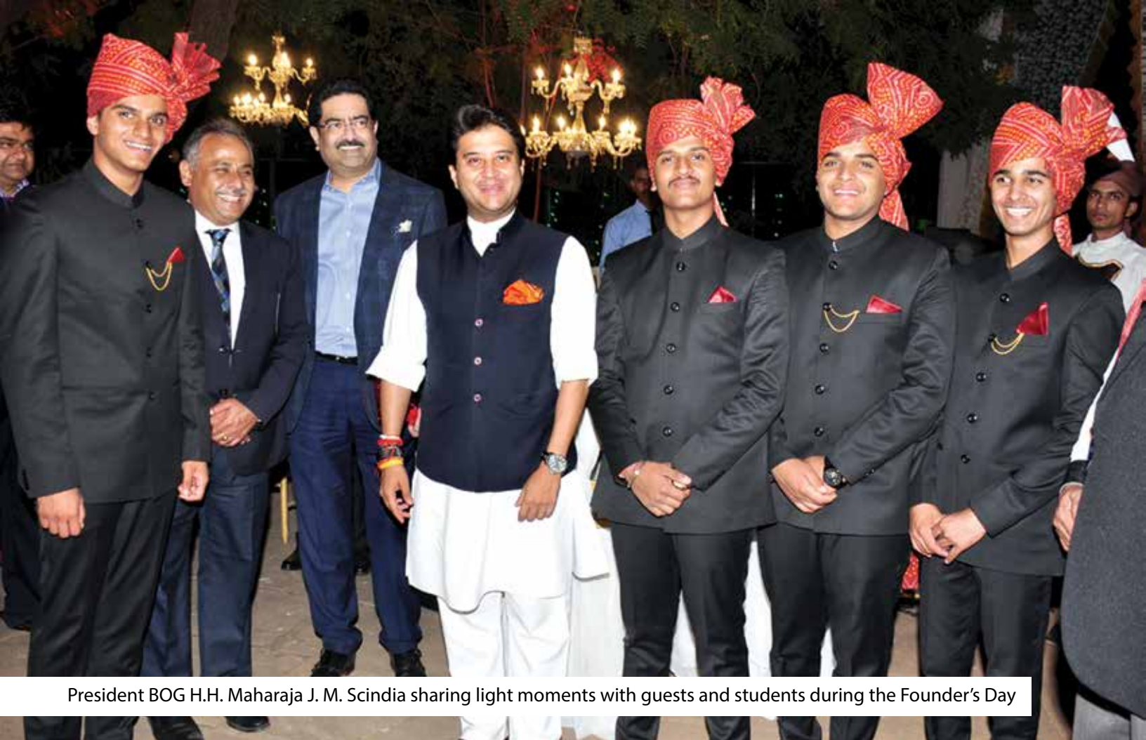
President BOG H.H. Maharaja J. M. Scindia sharing light moments with guests and students during the Founder's Day