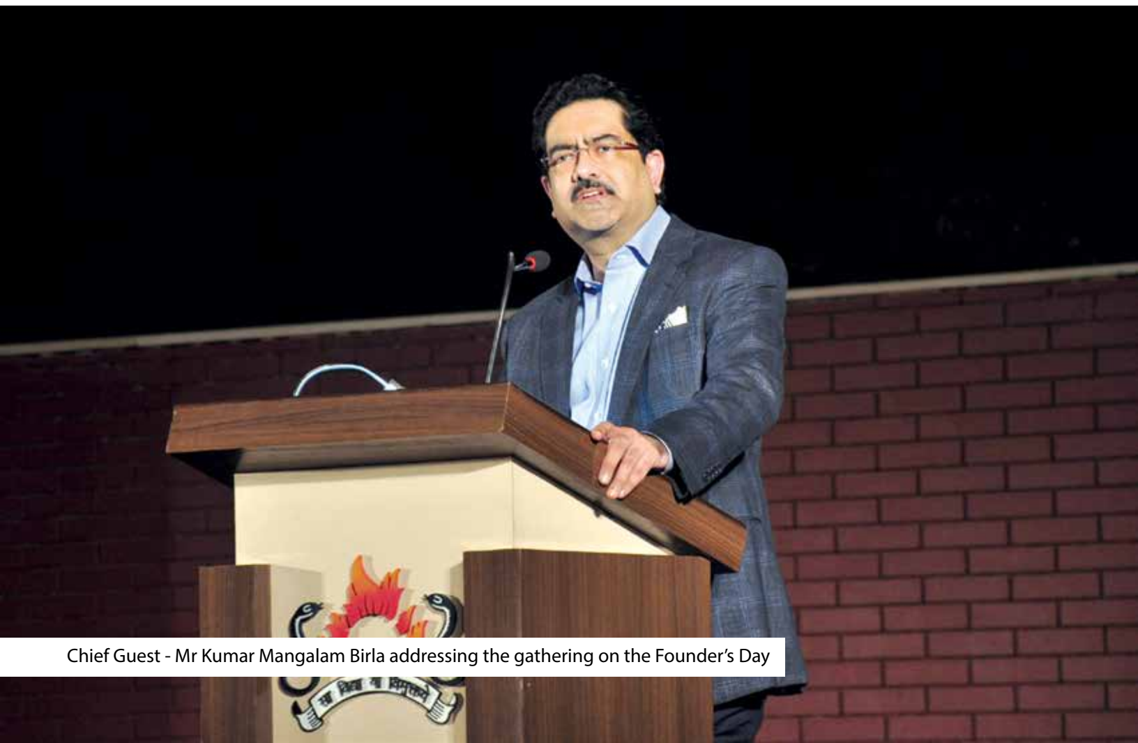
Chief Guest - Mr Kumar Mangalam Birla addressing the gathering on the Founder's Day