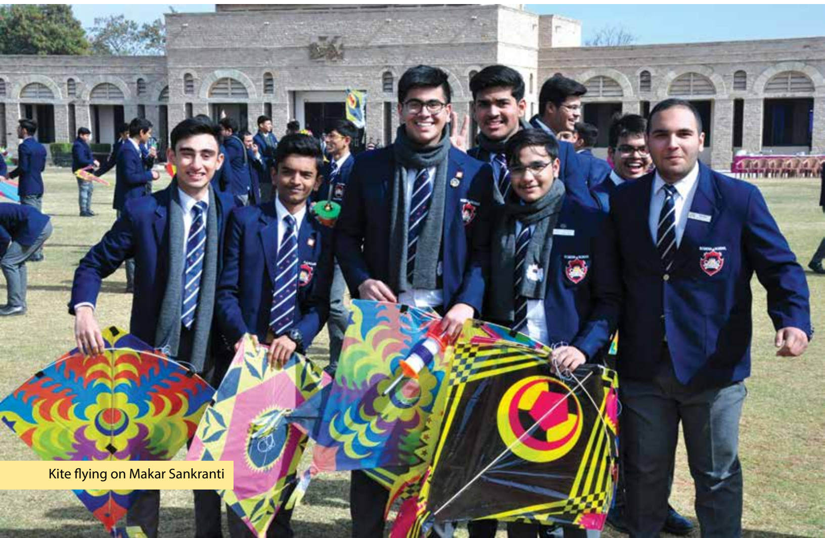
Kite flying on Makar Sankranti