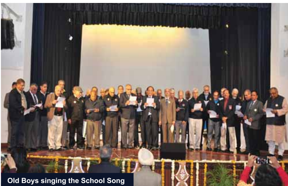
Old Boys singing the School Song

The Golden Jubilee Reunion of the Batch of 1968-69 was held on 25th January 2019. As the Old Boys passed the School gate, the faculty and the Principal, Vice Principal, and Deans received them with a lot of warmth. The Old Boys sang