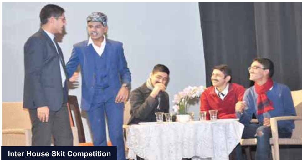
Inter House Skit Competition

The result of the Shrimati Shanti Devi Saxena Memorial Inter House Skit Competition held on 23rd January 2019 is as follows: