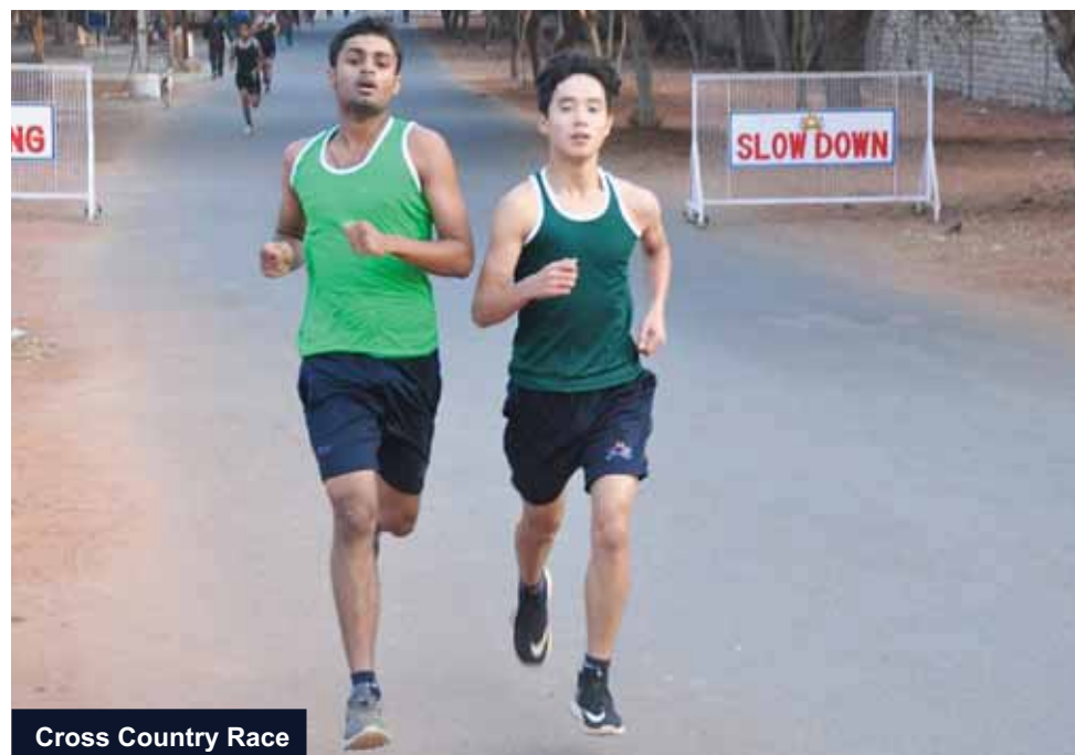
Cross Country Race