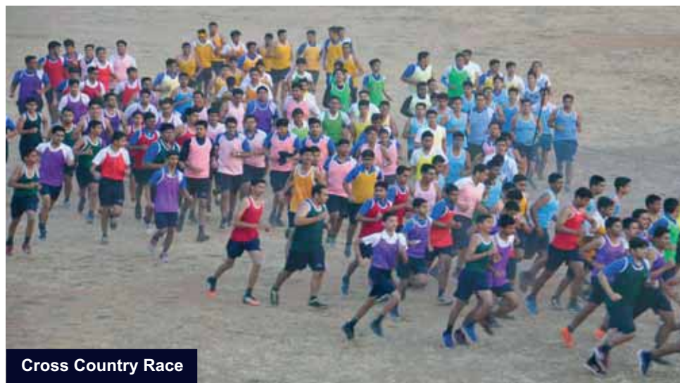
Cross Country Race

The Inter House Cross Country Race was held on 2nd December 2018.