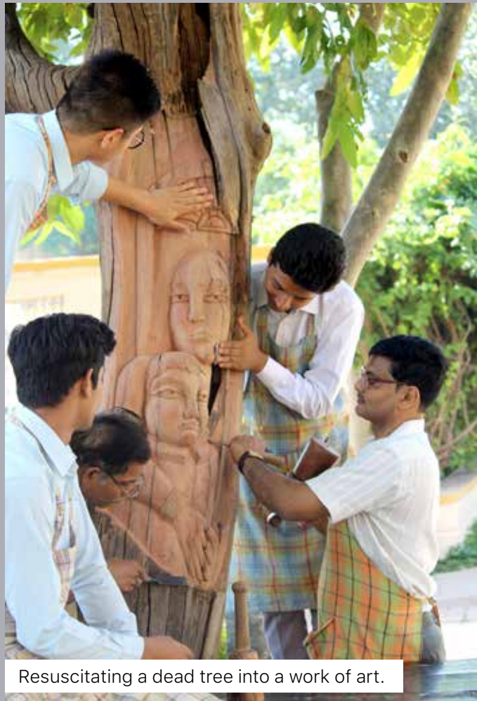
Resuscitating a dead tree into a work of art.

Lastly, it is important to mention about his absolute attachment to his teaching of wood carving and stone carving in the School and the genesis of it. He says that he had not been to school in the way that all other students go to a school and thus, concludes that The Scindia School- is his school. He walks around with the heart that swells with pride like an Old Boy which this ancient Fort has nurtured and reinvigorated for so many long years.