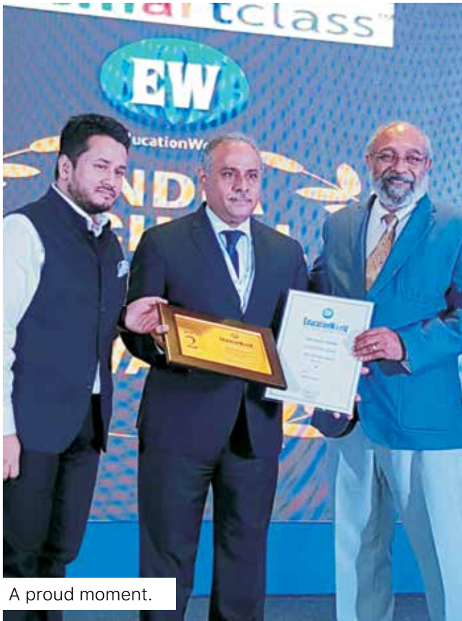
A proud moment.

The '12th Annual Education World India School Rankings 2018 - 19' has adjudged The Scindia School as the second best All Boys' Residential School in the country. The survey that rates and ranks the country's top 1,000 schools has adjudicated the School as one of the top boarding schools for two consecutive years in a row.