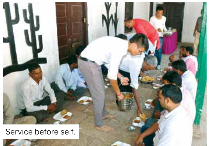
Service before self.