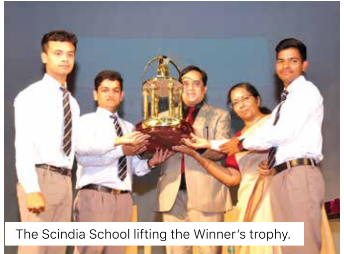
The Scindia School lifting the Winner's trophy.

His Highness Maharaja Madhav Rao Scindia Memorial Inter School Hindi Debate was held on 30th September 2018. Floral tributes were paid to Late His Highness Madhav Rao Scindia who was a leader of the masses.