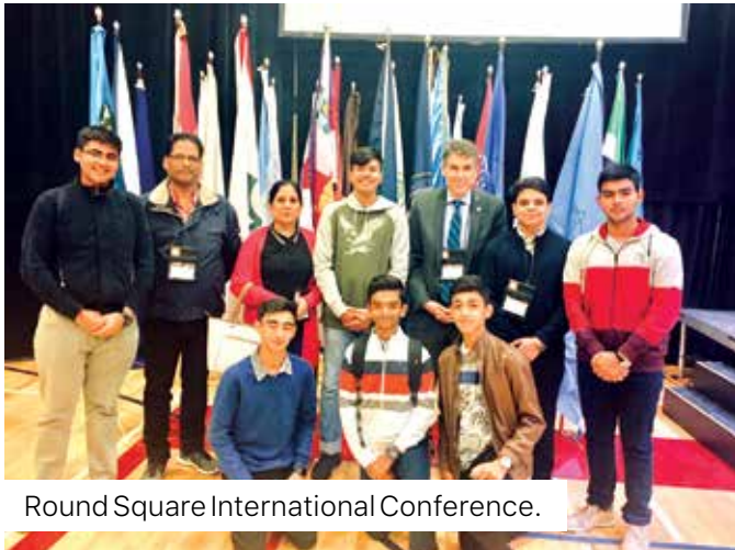
Round Square International Conference.

6 students participated in the Regional Round Square Conference held at Dhirubhai Ambani International School, Mumbai, from 12th September to 15th September 2018. The theme of the conference was 'Explore, Experience, Empower, Discover Yourself'. The students participated in coordination based activities like Hangman, Jigsaw bricks, A frame, Kabaddi, Lezium, Bollywood dance and Treasure hunt. They also actively participated in creativity based activities like Theatre Workshop, Tie and Dye, and Paper Bag Making with marble paper. This conference helped the students to try new things and identify their strengths and also helped them explore and experience the culture of Mumbai.