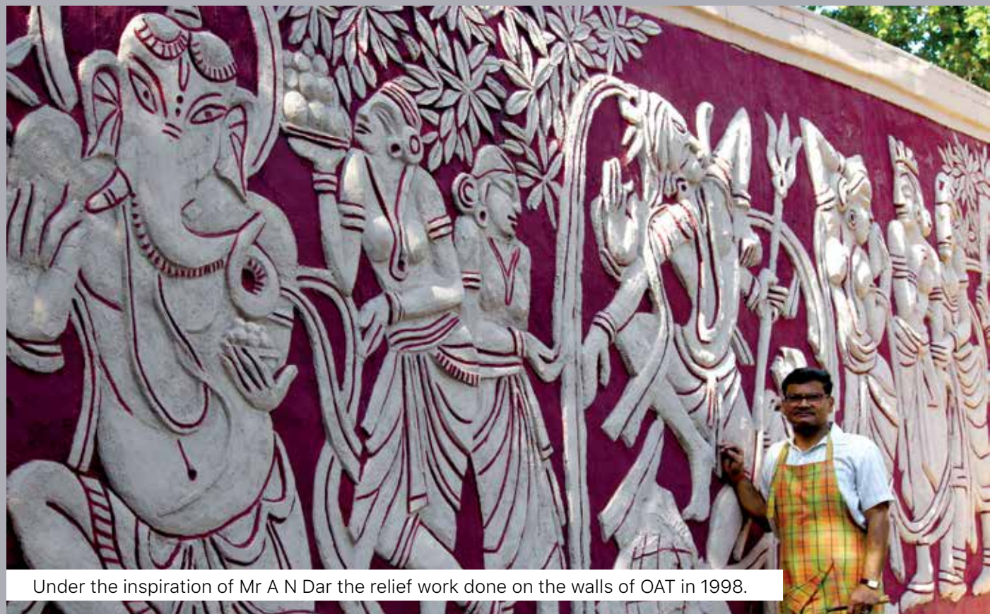
Under the inspiration of Mr A N Dar the relief work done on the walls of OAT in 1998.