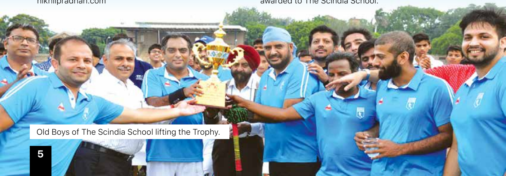
Old Boys of The Scindia School lifting the Trophy.

The Old Boys of four prestigious Schools-Welham Boys' School, Doon School, Mayo College and the host school, The Scindia School played the match entitled-'United for Hockey' on 22nd September 2018. The trophy was awarded to The Scindia School.