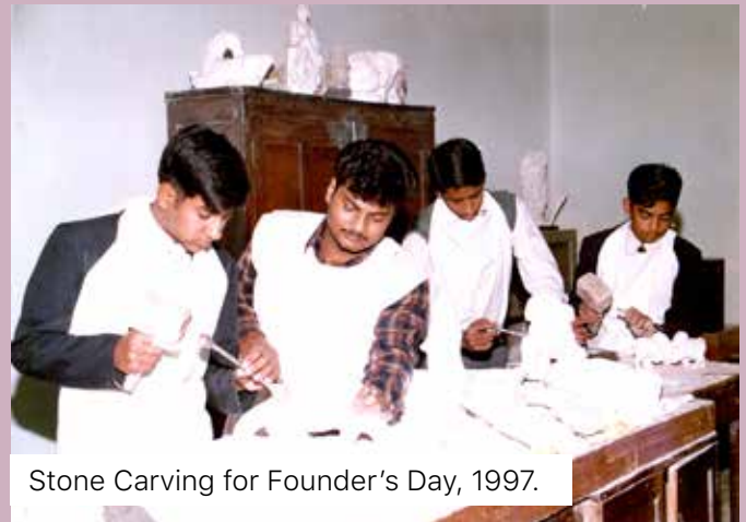
Stone Carving for Founder's Day, 1997.

replied in the affirmative and the headmaster of the nearby school agreed to admit him. He did not receive formal primary education but he cleared the tenth grade with Bengali, Math, History, English and Geography as his subjects.