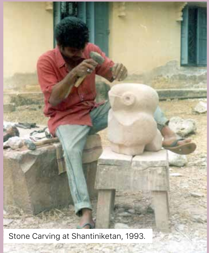
Stone Carving at Shantiniketan, 1993.

His elder sister was of the view that he should take up painting and pursue it. Someone suggested to the family that Shantiniketan would be the best place for him.