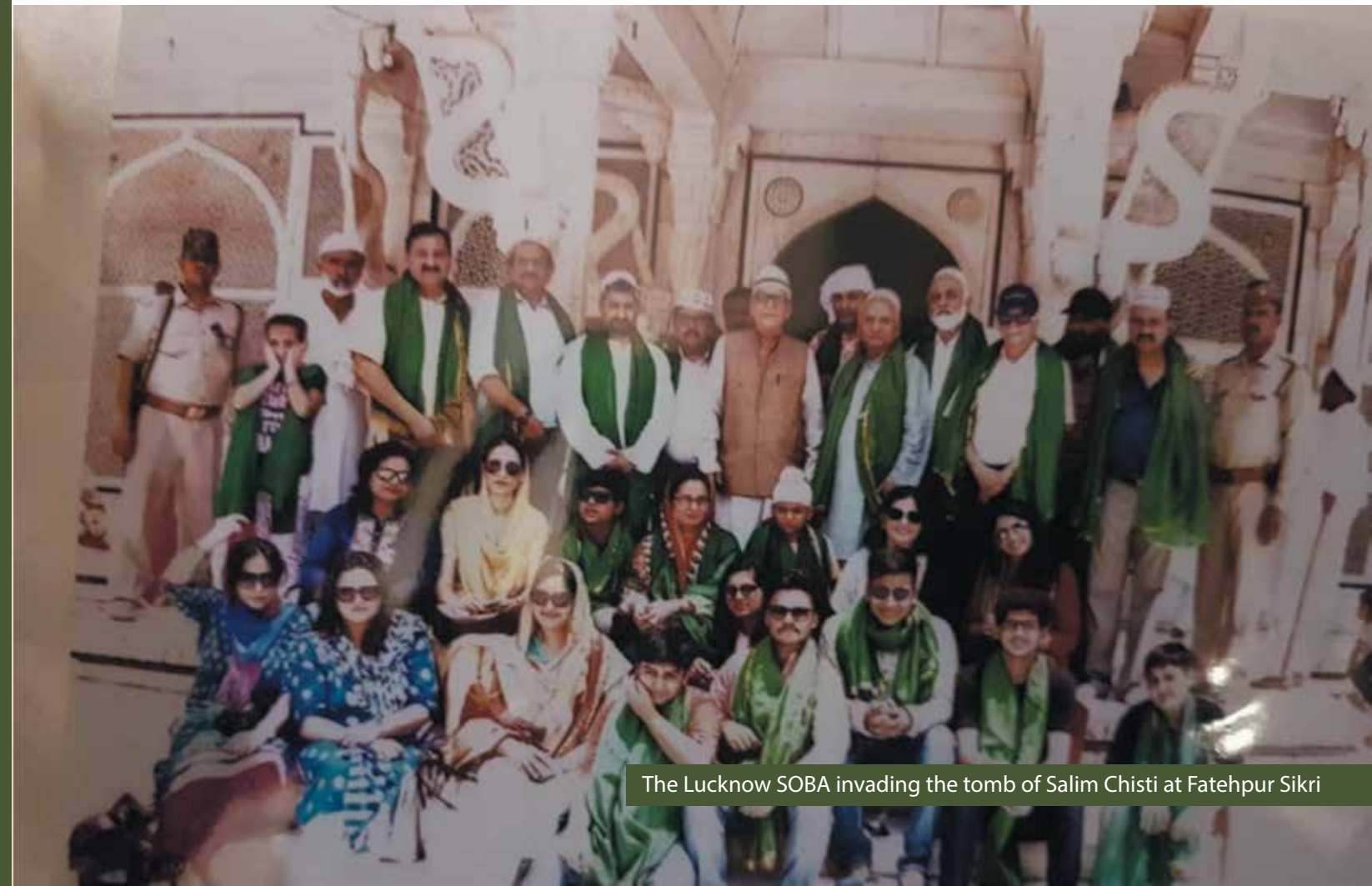
The Lucknow SOBA invading the tomb of Salim Chisti at Fatehpur Sikri