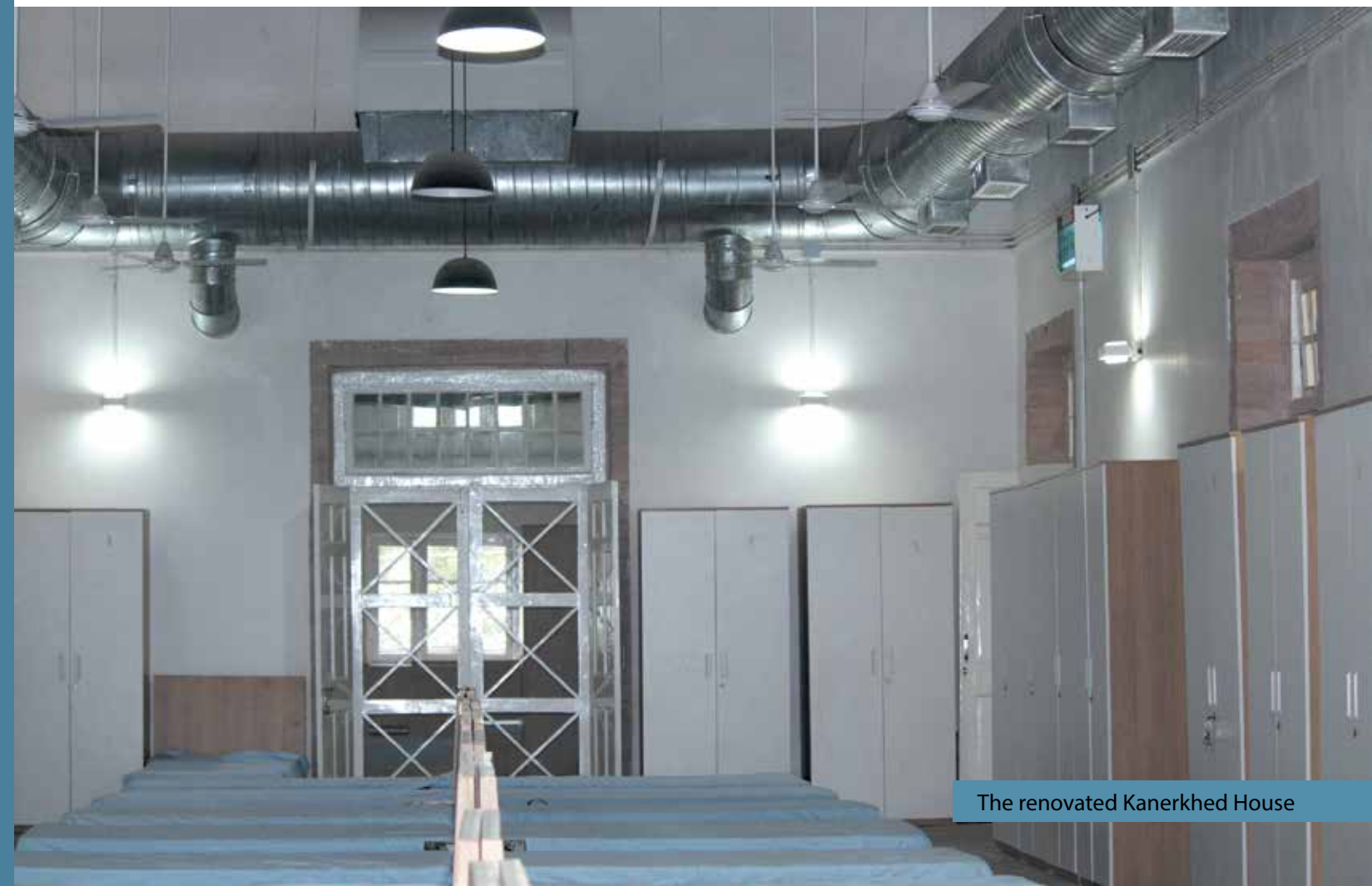
The renovated Kanerkhed House