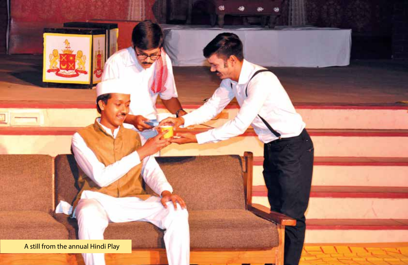
A still from the annual Hindi Play