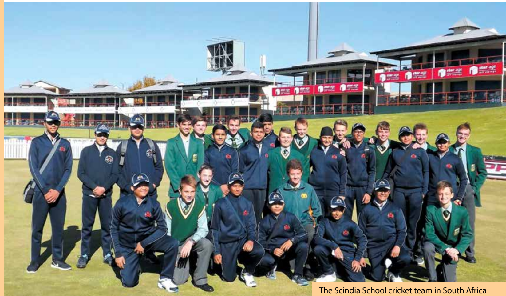
The Scindia School cricket team in South Africa