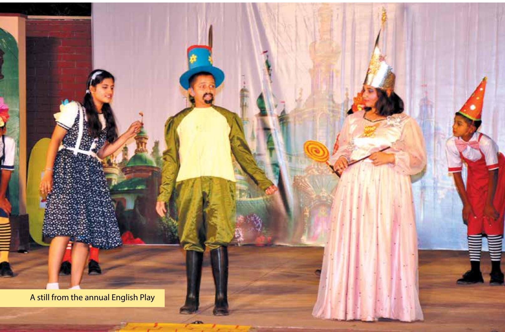
A still from the annual English Play