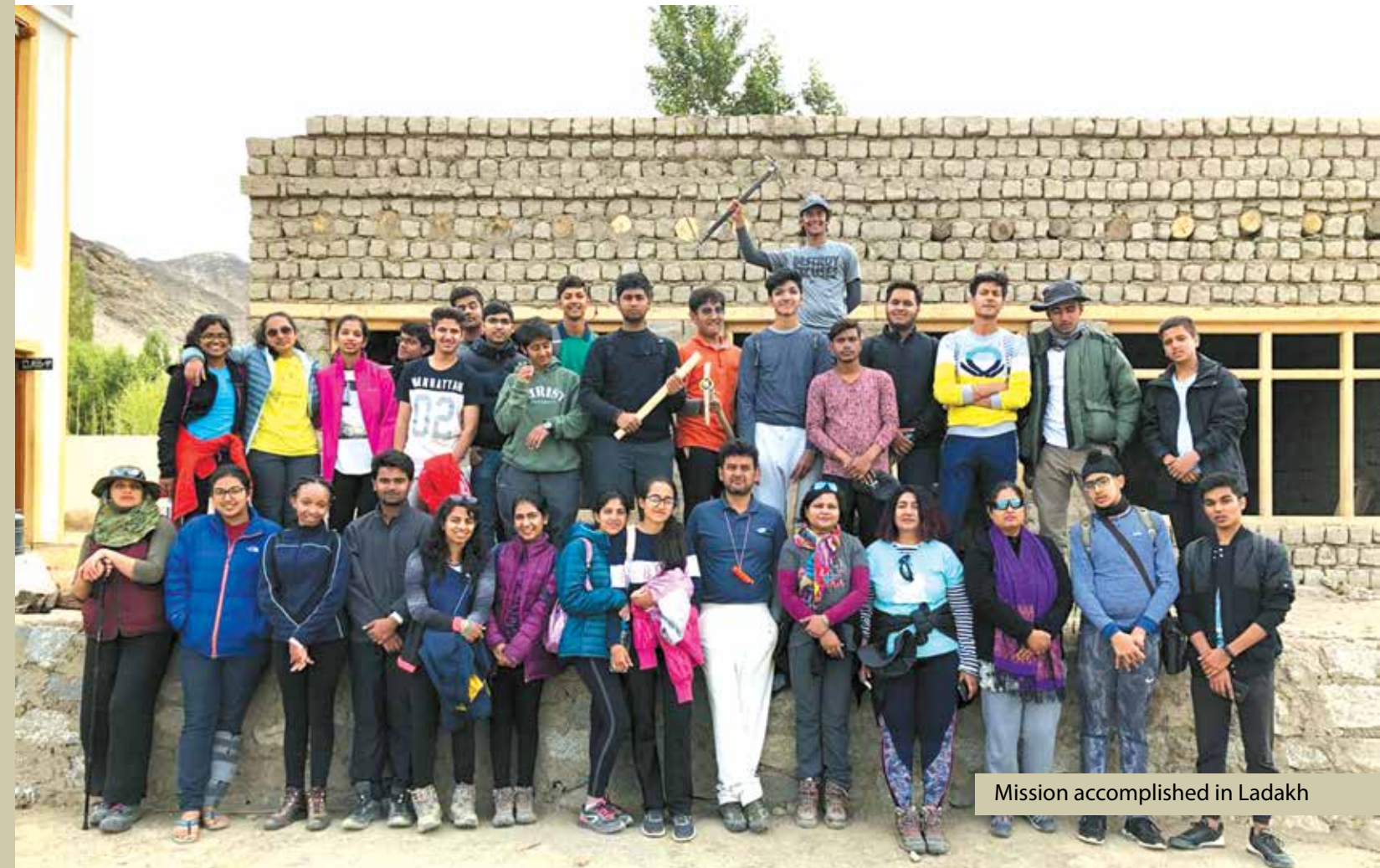
Mission accomplished in Ladakh

(Adult Participant in The Ladakh Venture 2018)