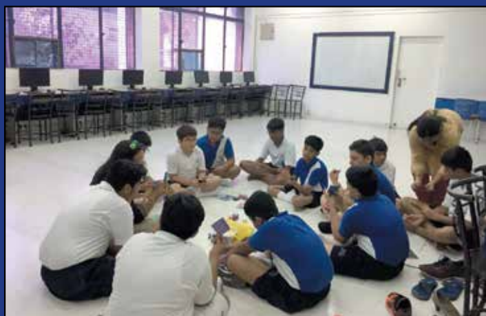
Glimpses of the first-ever off-site induction programme organized in Orchha especially for new entrants