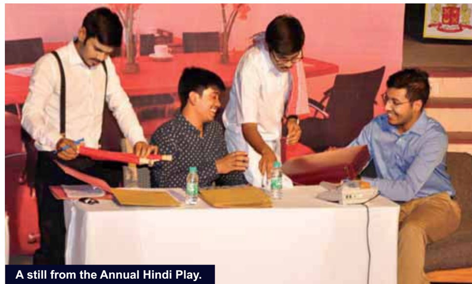
A still from the Annual Hindi Play.

The Annual Hindi Play was staged on the 18th April 2018. The play was based on the play written by the acclaimed Hindi dramatist, Ajay Shukla. It was a scathing satire on the red-tapism prevalent in the governmental machinery. The immediate problem was the building of the Taj Mahal. There is a contractor