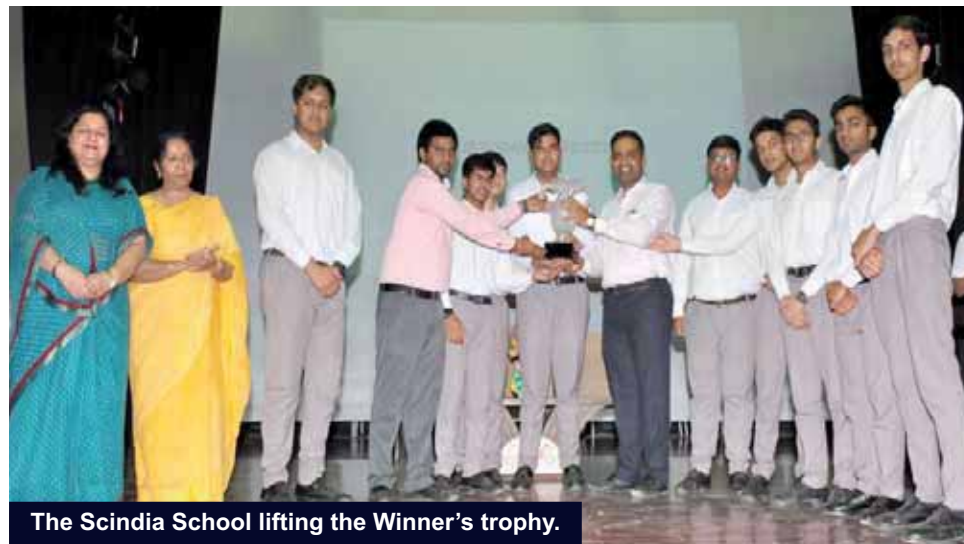
The Scindia School lifting the Winner's trophy.