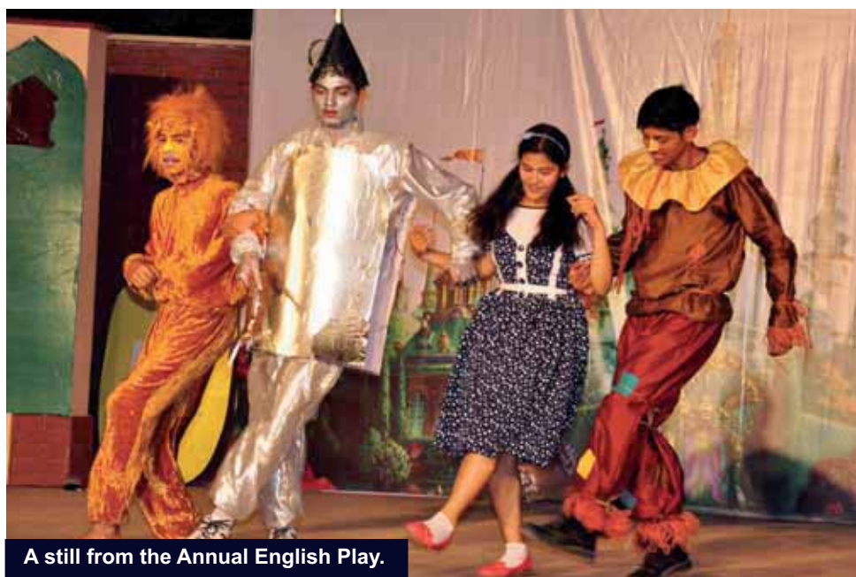
A still from the Annual English Play.

The Annual English Play was staged on the 17th April 2018. The play was based on Frank L. Baum's 'The Wonderful Wizard of Oz', a fantastical children's story about good and evil. It pits the sweet, innocent Dorothy Gale against the Wicked Witch of the West, who tries to harm her for the ruby slippers which