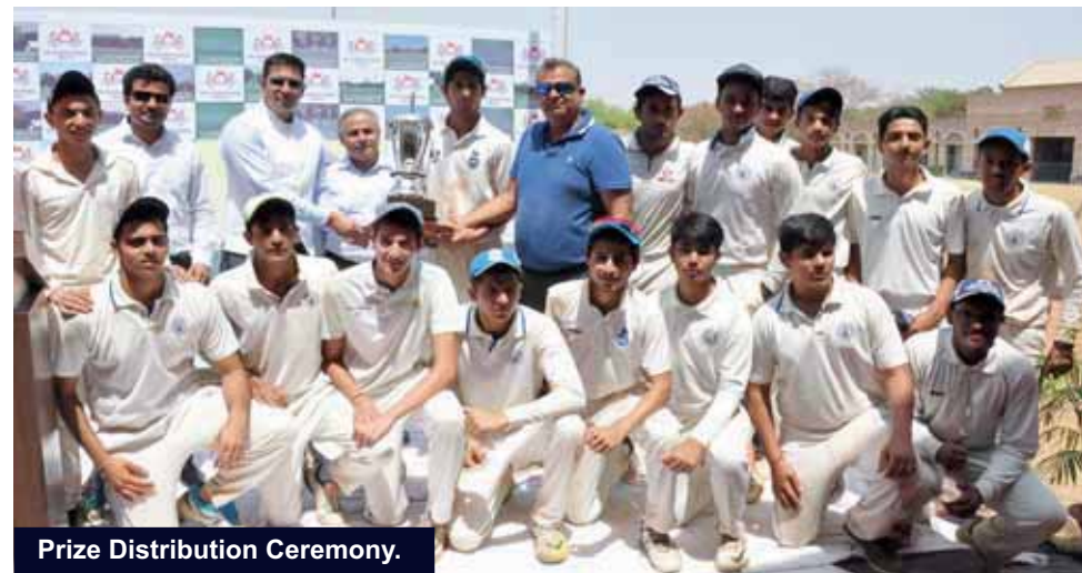
Prize Distribution Ceremony.