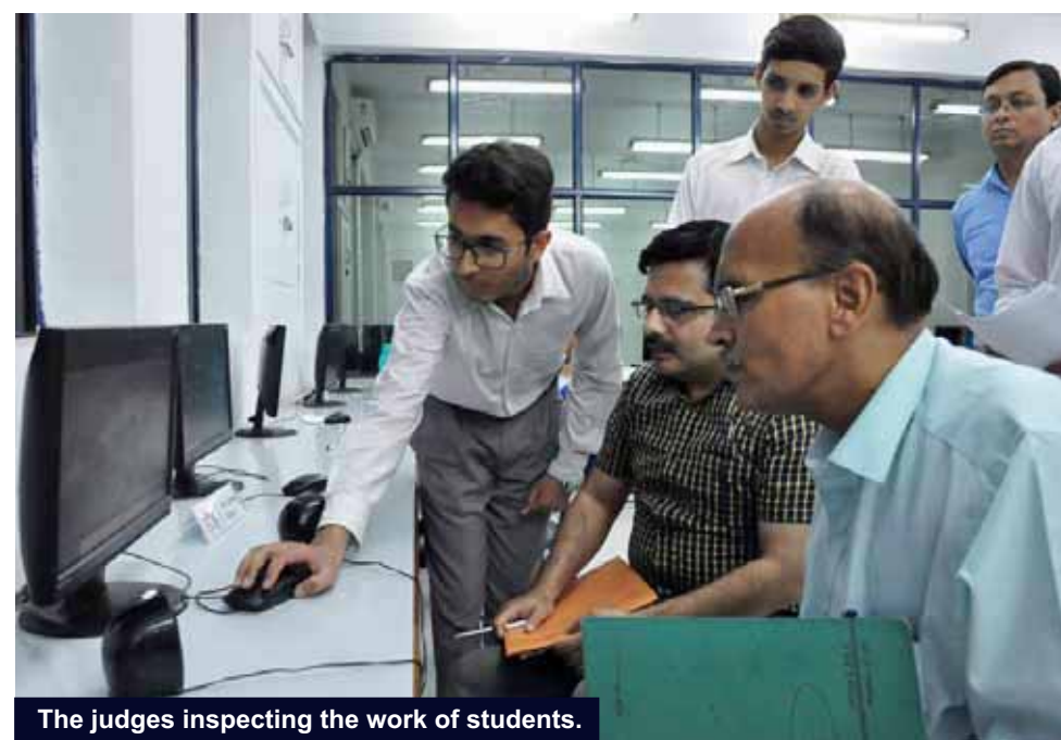
The judges inspecting the work of students.