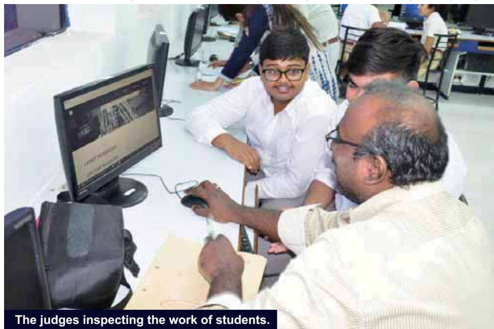
The judges inspecting the work of students.

The Scindia School hosted the Inter Public School Suryodaya IT Fest from Friday, 6th April to Sunday, 8th April 2018. The School has been organising this fest successfully since 2006. Eight leading schools participated in the fest this year. They were - Mayo College Girls' School- Ajmer, Mayo College- Ajmer, Maharani Gayatri Devi Girls' School- Jaipur, Scindia Kanya Vidyalaya-