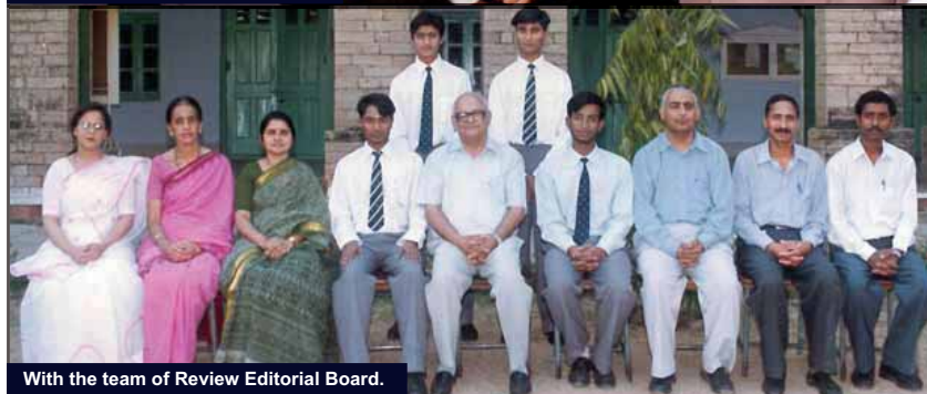
With the team of Review Editorial Board.