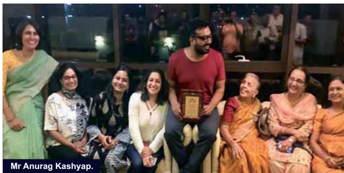
Mr Anurag Kashyap.