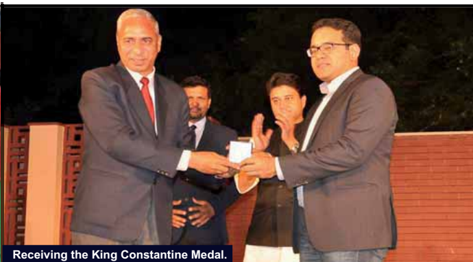
Receiving the King Constantine Medal.