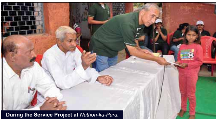
During the Service Project at Nathon-ka-Pura.