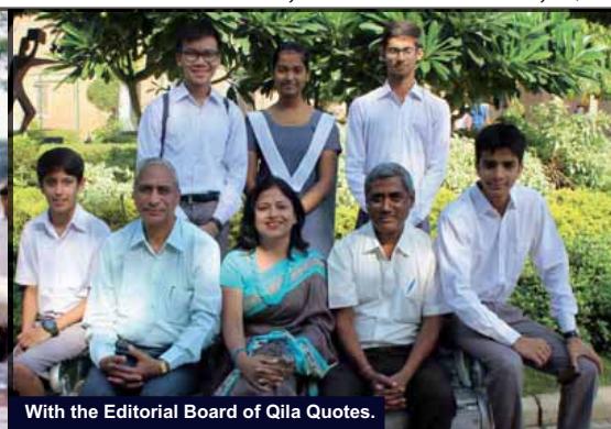
With the Editorial Board of Qila Quotes.