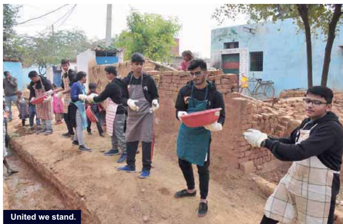
United we stand.

As part of the project, activities were planned to teach the women of the village, some economically productive skills, e.g. stitching and tie and dye work etc. at the Centre for Skill Development which was set up in the village two years ago. The aim of this particular activity was to make women self-reliant, so that they are able to actively contribute towards the financial health of their families. Several women learnt these skills rather quickly.