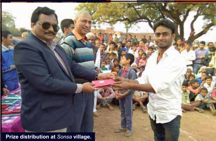
Prize distribution at Sonsa village.