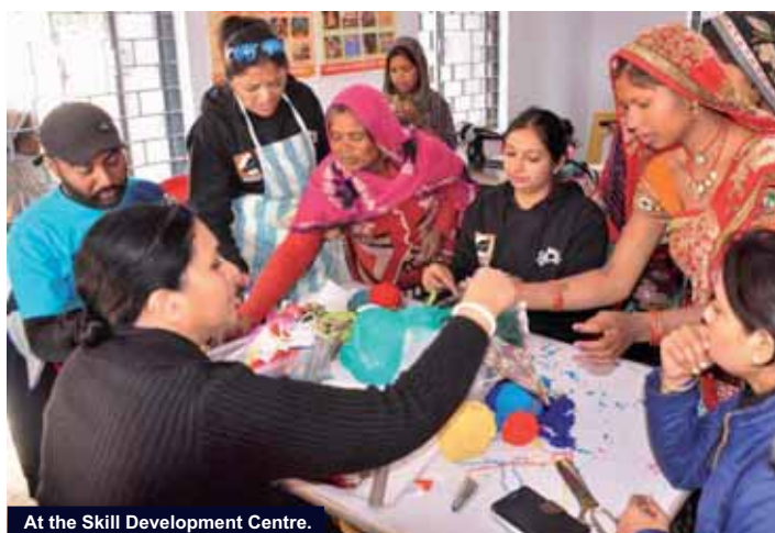
At the Skill Development Centre.