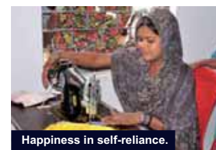
Happiness in self-reliance.

Towards the end of the project there was a sense of gratification in all those who were involved in one area or the other as a few Round Square IDEALS had been truly imbibed by them.