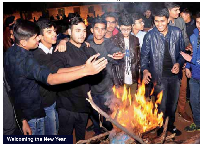
Welcoming the New Year.

On 31st December, the students and the Faculty along with the Admin staff welcomed the New Year. There was a D.J. Night and Bonfire in the Oval Field