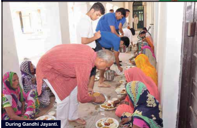
During Gandhi Jayanti.