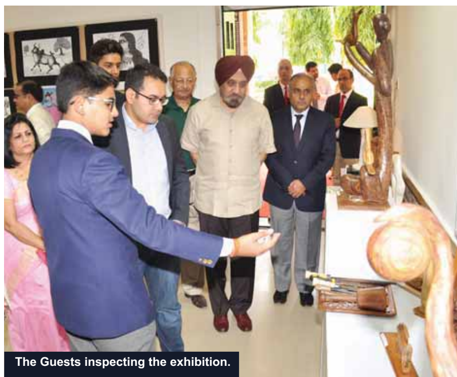
The Guests inspecting the exhibition.