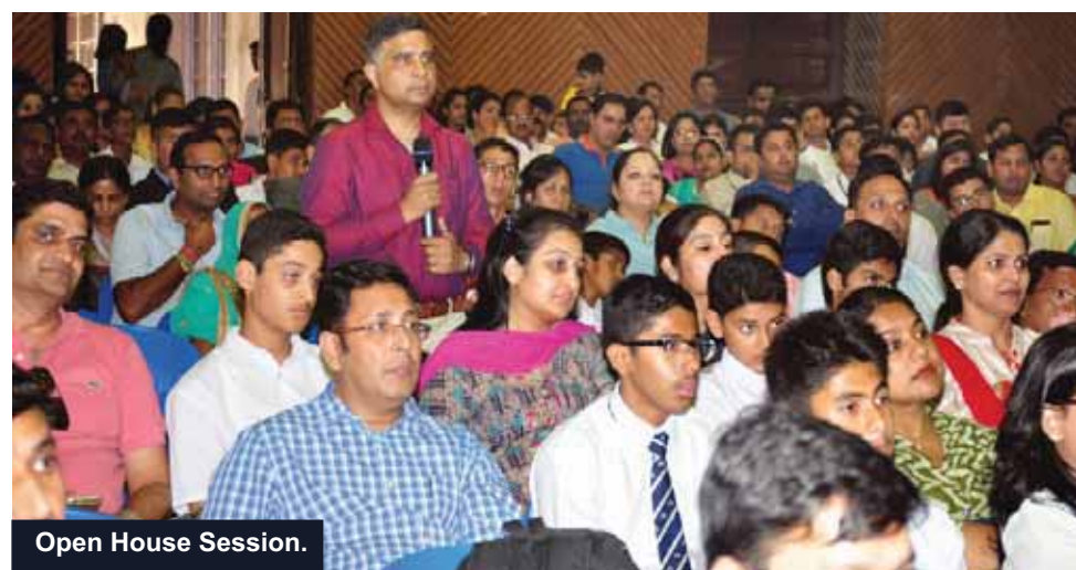
Open House Session.

अन्त में मैं एक अभिभावक के रूप में यही कहूँगा कि बच्चों को खुश रखिए, बच्चों को सिखाइए कि वे भय-मुक्त रहें, उन्हें अपना निर्णय स्वयं लेने दें और अंततः उन्हें अपने से बाहर आकर सोचने के लिए प्रेरित करें। साथ ही आप भी अपने आप से ऊपर उठकर सोचें और इस देश को अपना कर्तव्य समर्पित करें।