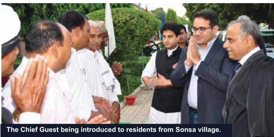
The Chief Guest being introduced to residents from Sonsa village.