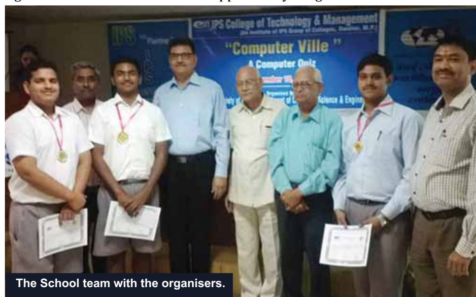
The School team with the organisers.