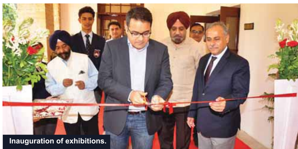
Inauguration of exhibitions.