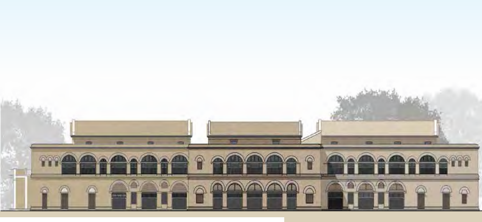
Artist's impression of the post renovation look of the Junior House.