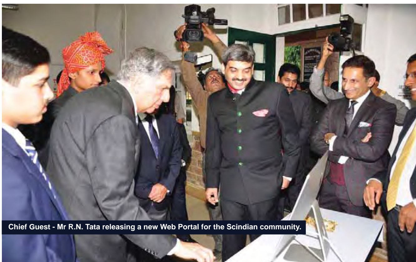
Chief Guest - Mr R.N. Tata releasing a new Web Portal for the Scindian community.