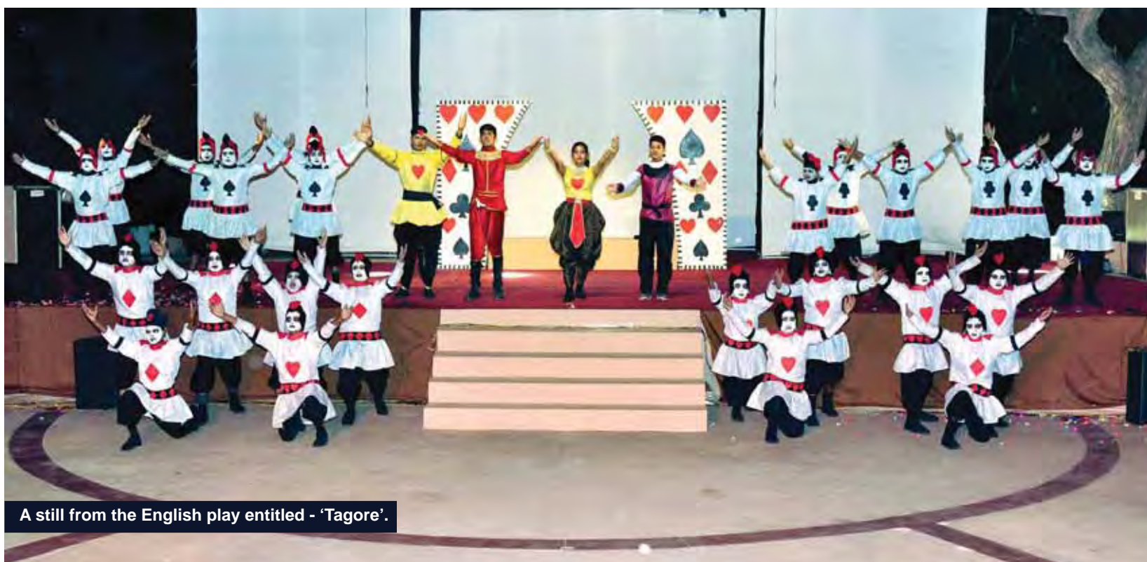
A still from the English play entitled - 'Tagore'.