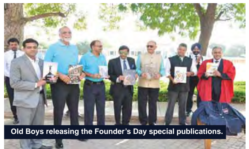
Old Boys releasing the Founder's Day special publications.