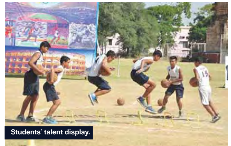
Students' talent display.