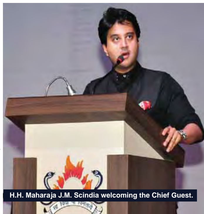
H.H. Maharaja J.M. Scindia welcoming the Chief Guest.

It gives us great pleasure to have between us, a visionary, a leader and most importantly a good human being. Now let's take a step back and try to understand what the word Tata group means for us. We season our food with their condiments, family conversations happen over a cup of Tata Tea, we drive their cars, we ride in their buses, we stay in their hotels, we use their network to communicate, we fly in their airlines, we keep their watches to keep track of time and do not forget to record the latest episode of our favorite serial on Tata Sky. I think all of us get the hint; and Mr Tata, we also have to thank you for Starbucks. And therefore it is the single minded focus, focus on high quality - the culture of probity that propagates the best human practices and business practices which ensures that this group stays at the cusp of change both through time and space.