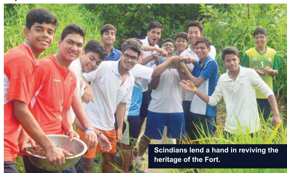
Scindians lend a hand in reviving the heritage of the Fort.

We are the people of the Earth, We owe to it a certain duty, Let us work collectively to maintain its beauty.