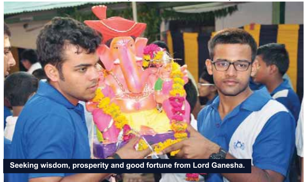
Seeking wisdom, prosperity and good fortune from Lord Ganesha.

On 5th and 6th of September, the Scindian community on the Fort celebrated the festival of Ganesh Chaturthi. On 5th, Ganpati sthapana started off with the Shloka , Vakratunda Mahakaya which was followed by a few devotional