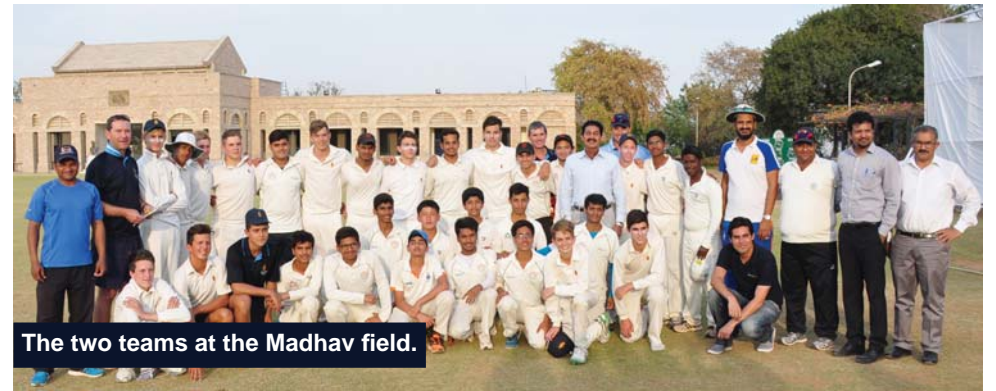
The two teams at the Madhav field.