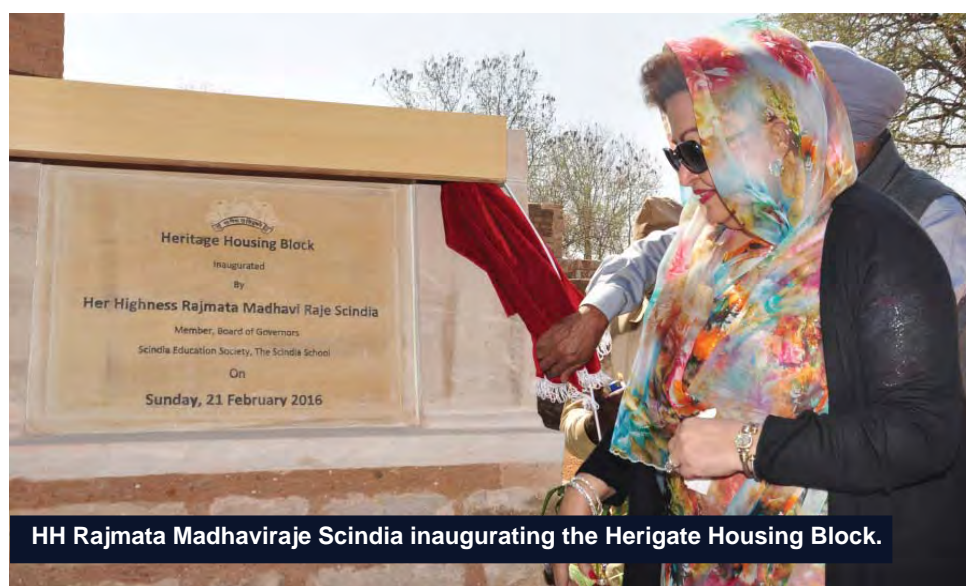
HH Rajmata Madhaviraje Scindia inaugurating the Heritage Housing Block.