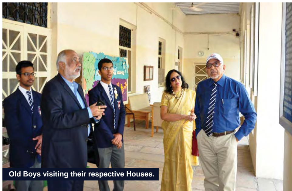
Old Boys visiting their respective Houses.

Q. In today's world of cut throat competition, conflicts and clash of ideas, etc., what do you think is the most important role / challenge for a student and more specifically for a Scindian?