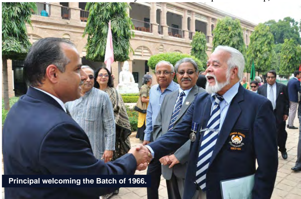
Principal welcoming the Batch of 1966.

February 20 and 21 were very memorable dates, indeed. What a wonderful reunion! Thirty two Old Boys, eighteen of whom arrived with their wives returned to Scindia for two days of renewed acquaintanceship, shared