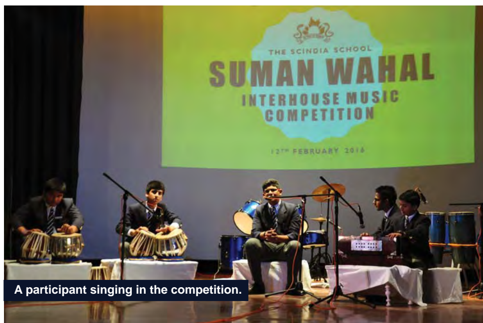
A participant singing in the competition.