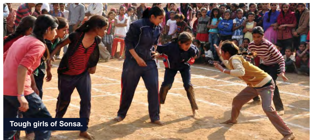
Tough girls of Sonsa.