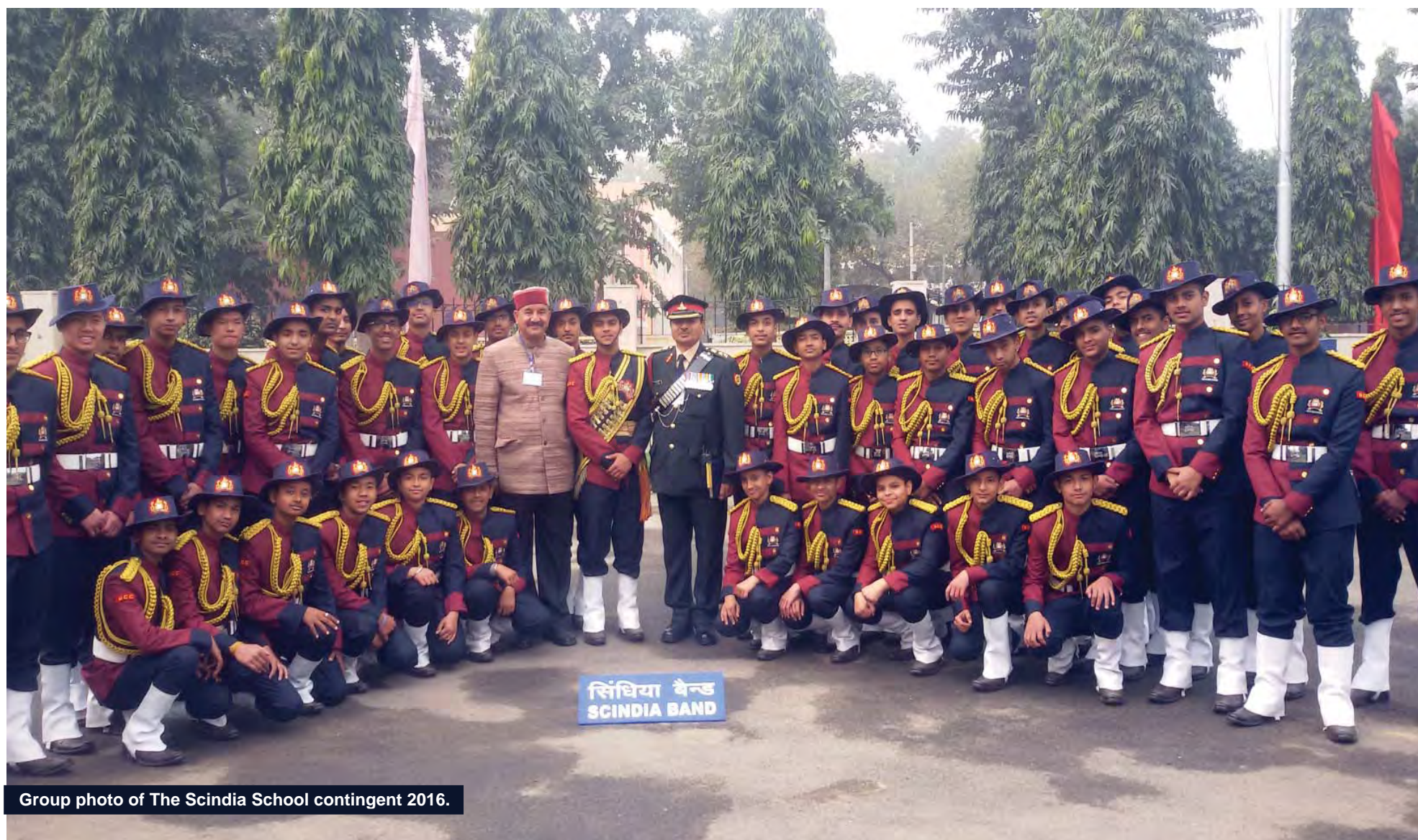
Group photo of The Scindia School contingent 2016.

I would like to urge my fellow Scindians to join the band, if they have a flair for music and the mental determination to work hard. You don't always get such an opportunity, but when you do, take on the challenge and see your personality change in a matter of months. According to me, the students who join the Band and are selected to go for the RDC camp are the "SUPERHUMANS" of Scindia School.