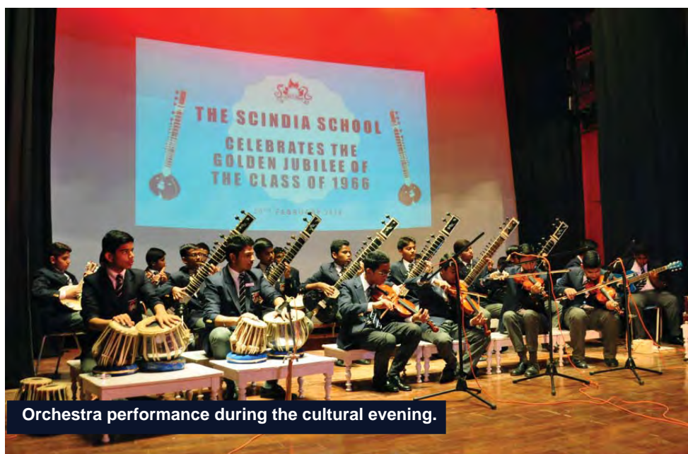
Orchestra performance during the cultural evening.