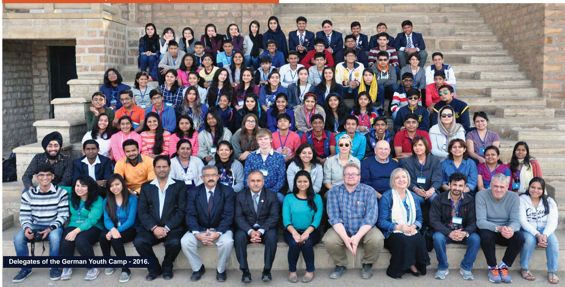
Delegates of the German Youth Camp - 2016.

Vacations can be long and of course boring too, but what made my vacation a memorable one was the International German youth camp in which the participants from India, Pakistan, Bangladesh, Sri Lanka, Nepal and Iran took part. On 3rd January around 5.30 in the evening, 71 participants arrived on the Fort. They were then escorted to the mess where they had some snacks followed by an ice breaking session. The ice breaking session had several interesting games to make us interact and know more about each other. The next day we woke up at 7 o'clock as we had a morning fitness program. In the morning fitness program we enlightened ourselves with some knowledge of football and played a friendly match against each other which polished our football skills. The whistle blew for full time and it was a draw. While returning from the field we were discussing the possible moves which we could have used to win the match but never mind it's all a part of the game. We then had breakfast and headed towards our classes. In the youth camp we had three different classes which were MINT, Comic and schülerzeitung.