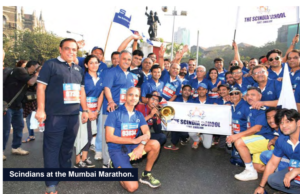
Scindians at the Mumbai Marathon.

The Marathon was a lesson in self-motivation, competitiveness, sportsmanship and a test of endurance. The aim was to create awareness about the school and display the talents of our boys in a media-rich forum. The preparation began well in advance at Gwalior, and the boys got into the spirit of the marathon on reaching Mumbai. It was fantastic to meet the other participants and feel their vibrant energy. The Scindia School aspires to participate in the marathon next year too, and keep the spirit and gusto alive; and most importantly, to keep The Scindia School flag flying high!