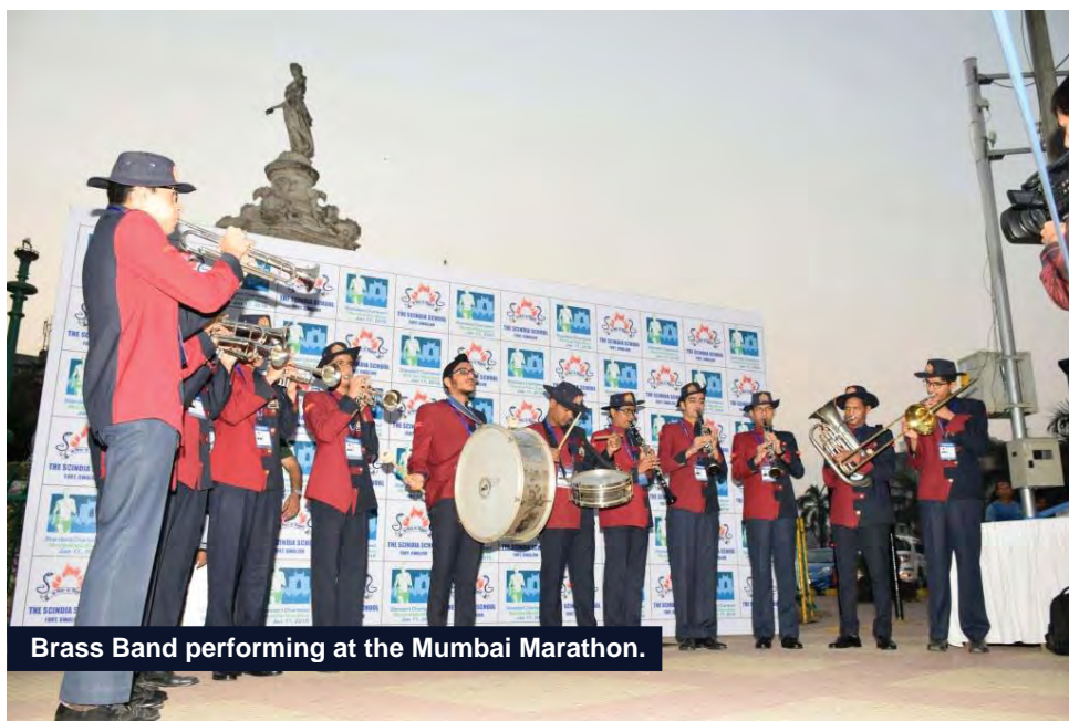
Brass Band performing at the Mumbai Marathon.