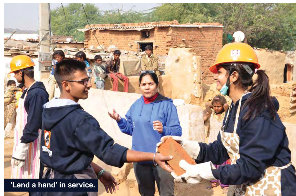
'Lend a hand' in service.

The tasks decided for this year's project included mainly the construction of a room for the women of the village so that they have a separate space for their handicraft production. The survey group had to collect information on a survey sheet with about 30 questions and submit a report with their observations as well as suggestions. Another group had to paint the existing school building