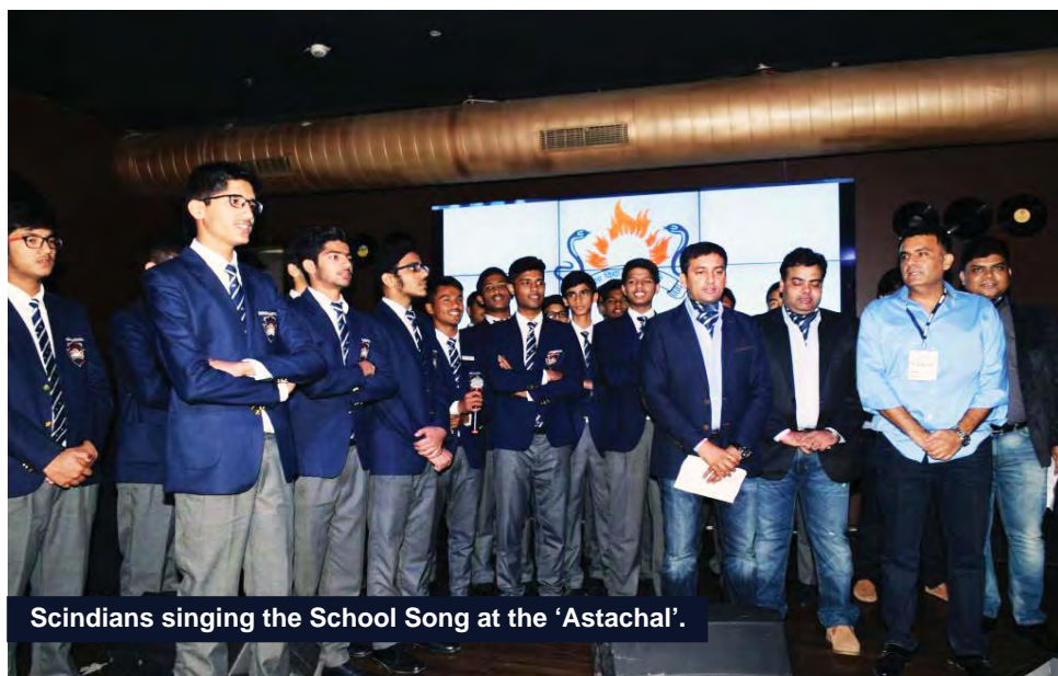
Scindians singing the School Song at the 'Astachal'.