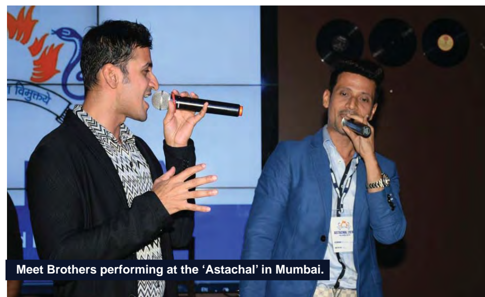
Meet Brothers performing at the 'Astachal' in Mumbai.

The school contingent was hosted by Mumbai SOBA. They took it as another way to celebrate their success keeping in mind the cause that brought them together - The Scindia School. They left no stone unturned in extending warmth and hospitality to the school delegation. They were accommodated at The Emerald Hotel, a stone's throw away from the famous Juhu beach in the city. This gave the boys an opportunity to enjoy an evening stroll by the beach