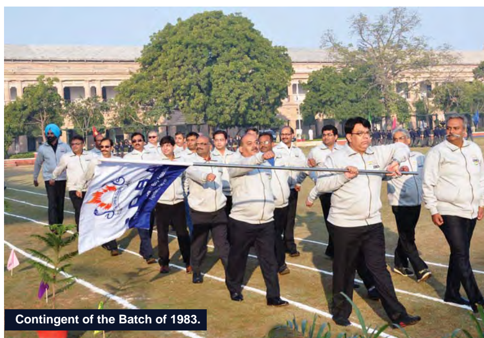
Contingent of the Batch of 1983.

A meeting of the Central SOBA Executive Committee was held at Mumbai on Saturday, 16th Jan 2016. Among other office bearers from various chapters, it was attended by the following members of the executive committee.