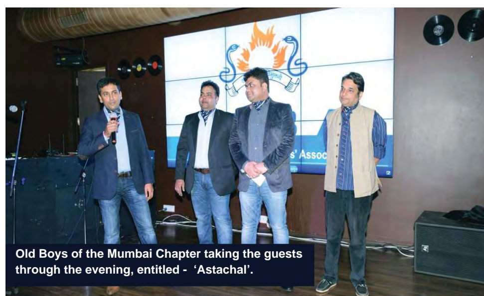
Old Boys of the Mumbai Chapter taking the guests through the evening, entitled - 'Astachal'.