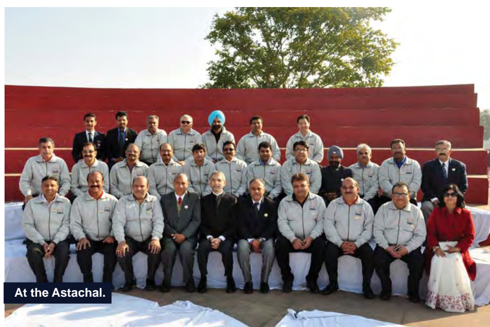
At the Astachal.

entire undiscovered world lay ahead beckoning them to explore the unknown. He said that while today the internet has all the information, the teacher's role of character formation of the younger generation will never become obsolete. It is the character development in the formative years that will always be a motivating factor in life, impacting destiny. In the end, he recited, 'The Road Not Taken' by Robert Frost and used the poem as a metaphor to convey to the boys, that they should follow their hearts. After this ceremony, the students, faculty and guests gathered at the Astachal where rich floral tributes were paid at Gandhiji's statue by the honourable guests and a patriotic song was presented by the students as a tribute to the freedom fighters.