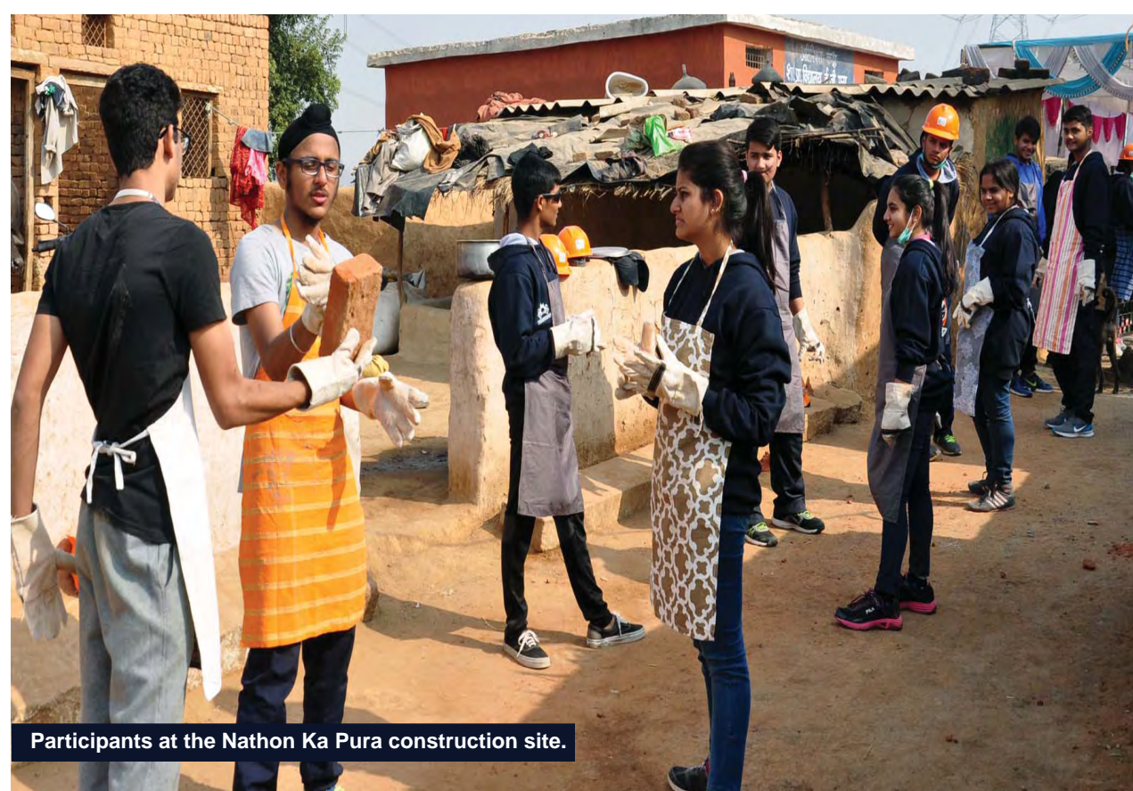
Participants at the Nathon Ka Pura construction site.

Later during the project, students designed and prepared newsletters and presented reports of the achievements of the tasks that they were allotted at the beginning of the project. Four newsletters were prepared by each group respectively with specific names, which were: 'The Observer, Round Square Times, Women Daily and The Service Times. Each newsletter brought out the different aspects of the service project in wonderful ways with interesting slogans.