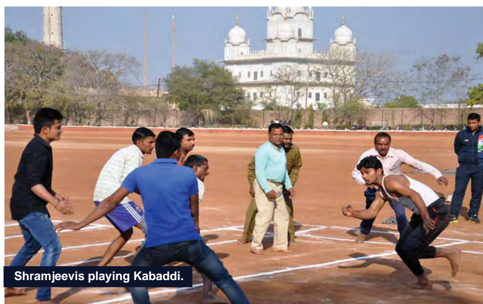
Shramjeevis playing Kabaddi.

The results of Junior Group Inter House Hindi Elocution are as follows :