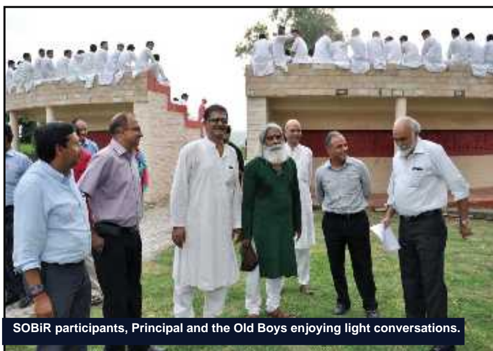
SOBiR participants, Principal and the Old Boys enjoying light conversations.