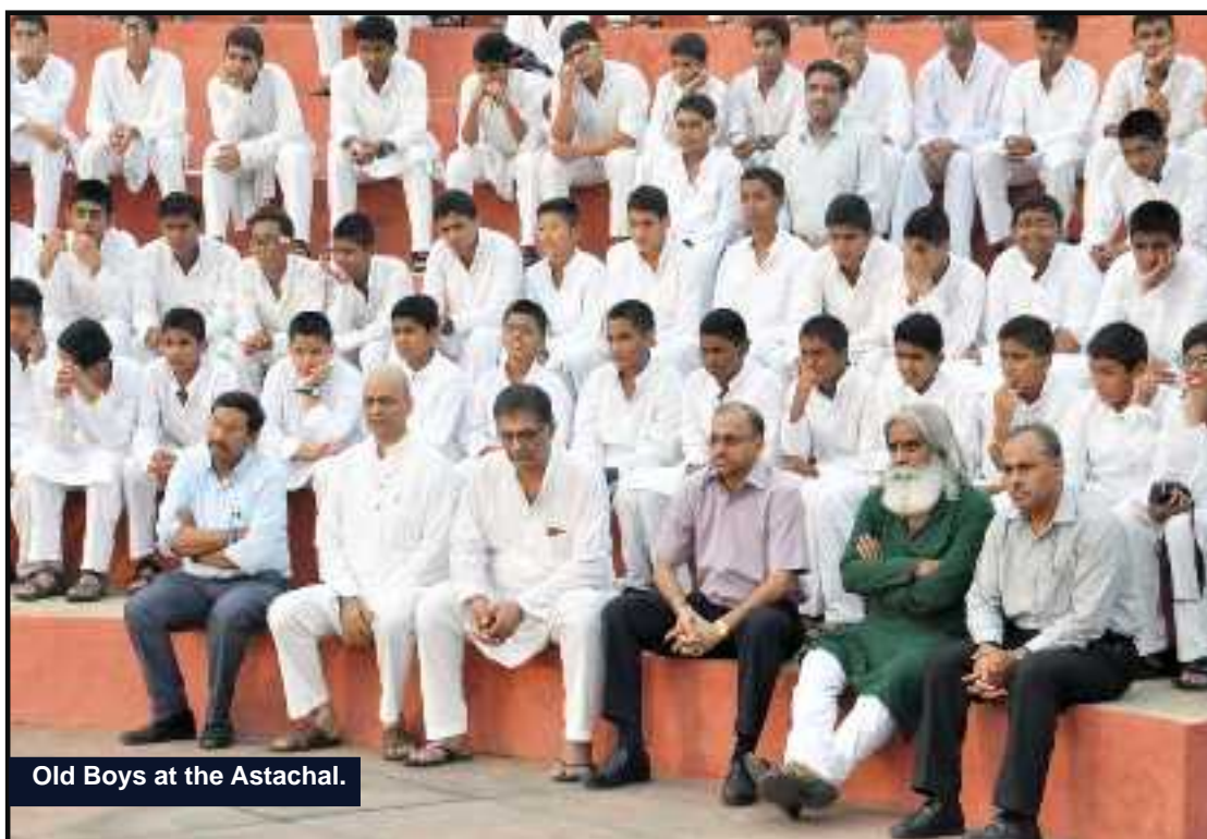
Old Boys at the Astachal.