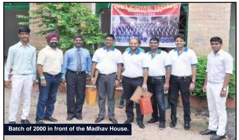
Batch of 2000 in front of the Madhav House.