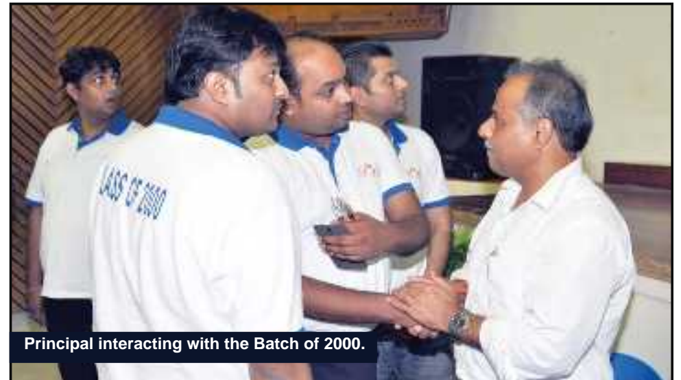
Principal interacting with the Batch of 2000.

On the 14th of August, the Class of 2000 had organized a get together at the Usha Kiran Palace Hotel, Gwalior, where they had invited the teachers of their time, senior management team and SOBA office bearers. Several members of the fraternity were felicitated and overall it was a wonderful evening, full of warmth and camaraderie.