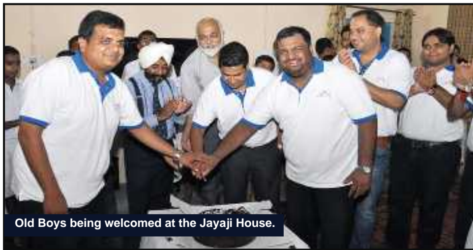
Old Boys being welcomed at the Jayaji House.