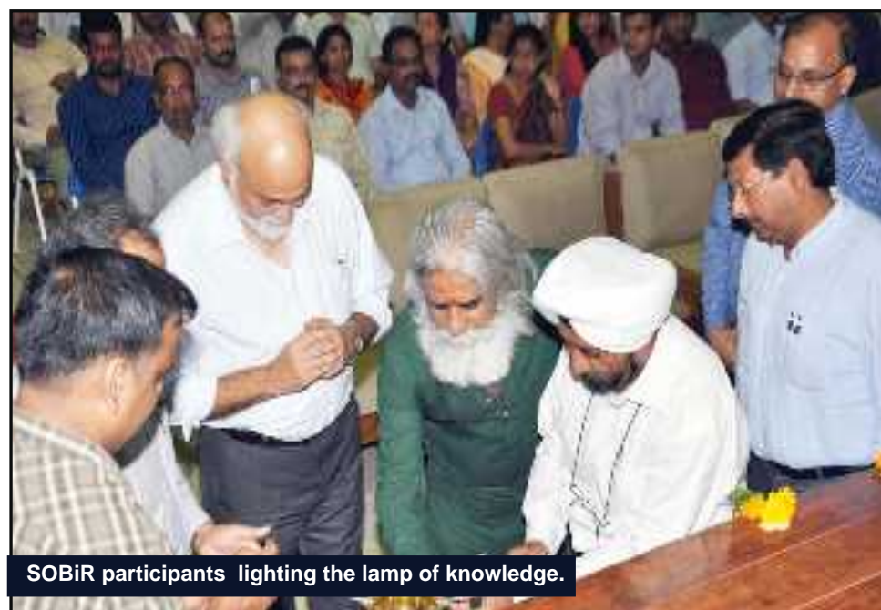
SOBiR participants lighting the lamp of knowledge.

India. He is also a prolific writer in Hindi, Marathi and Urdu. He has composed over five hundred compositions in Hindi and Urdu, portraying the various shades of human emotions. He has also written on a spectrum of subjects such as philosophy, religion and current affairs. Recognizing his contribution in the field of literature and philosophy, the Gulbarga University honoured him by awarding an Honorary Doctorate degree."