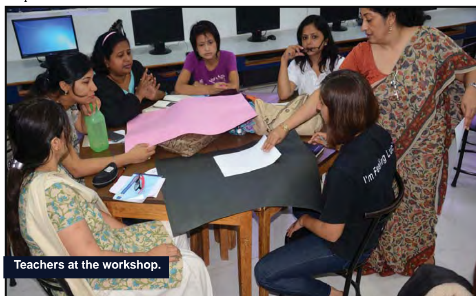
Teachers at the workshop.