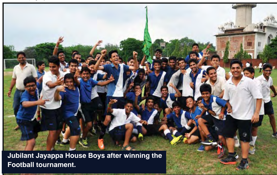
Jubilant Jayappa House Boys after winning the Football tournament.