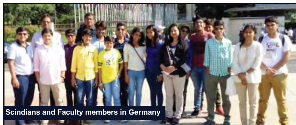
Scindians and Faculty members in Germany

We reached Geneva on 5th June 2015, and checked in a hotel. Afterwards, with the sun shining brightly over our heads, we left for CERN which is built on the Swiss-French Border. The scientists gave us a few presentations on the basics of the CERN's Researches and its purpose. We were then assigned our tour guide who took us around the CERN museum where we saw every single part present in the LHC and were explained about it in the simplest way possible. It