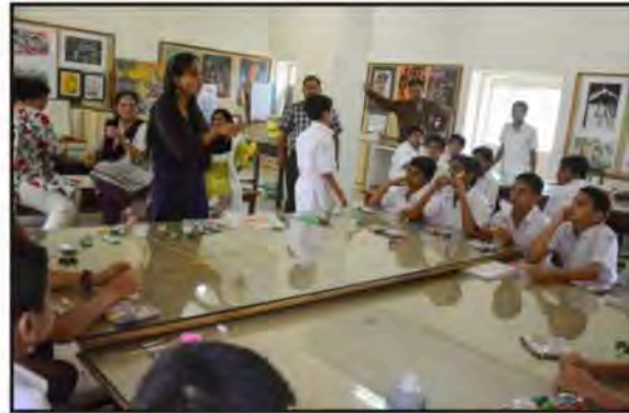
'Soft Toy' making workshop for Junior School