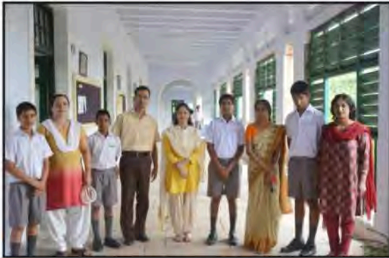
JUNIOR SCHOOL HOUSE PREFECTS, 2014-15