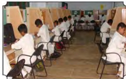
Writing letter's to parents